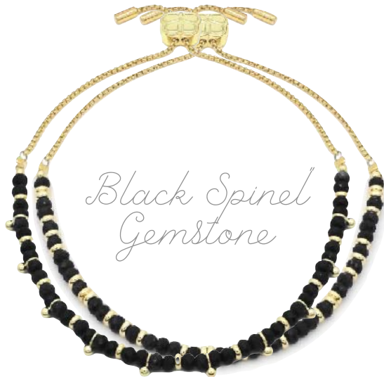
Black Spinel Gemstone