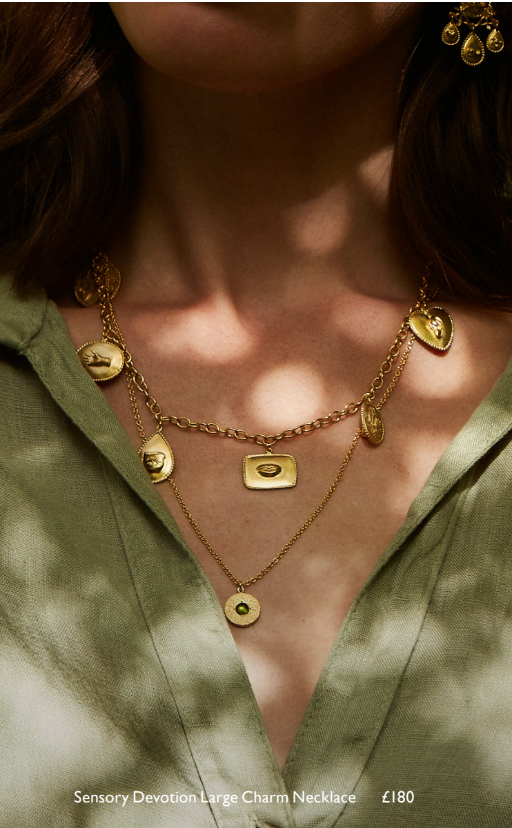
Sensory Devotion Large Charm Necklace £180