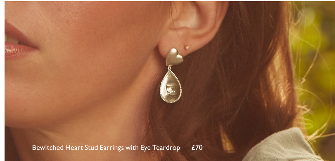
Bewitched Heart Stud Earrings with Eye Teardrop £70