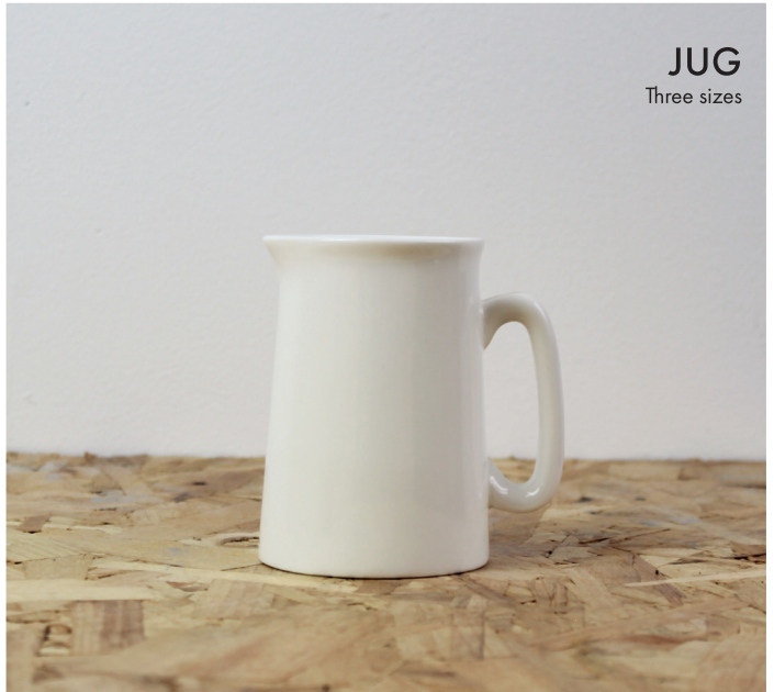
JUG Three sizes