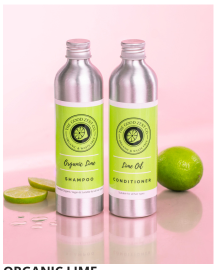
ORGANIC LIME SHAMPOO & CONDITIONER Normal Hair & Everyday use