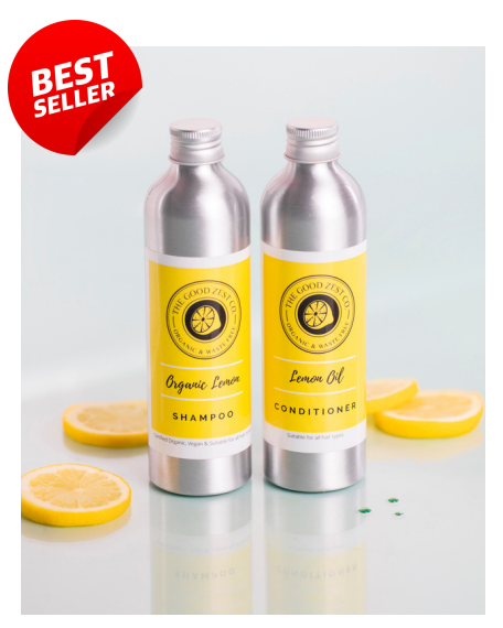
ORGANIC LEMON SHAMPOO & CONDITIONER Oily or Greasy hair