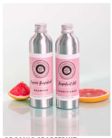
ORGANIC GRAPEFRUIT SHAMPOO & CONDITIONER Weak or Thinning hair