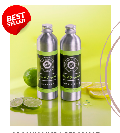
ORGANIC LIME & BERGAMOT SHAMPOO & CONDITIONER