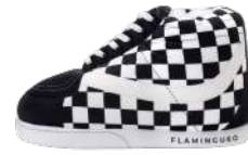
PAULIS ZA-10 PAULIS KIDS ZA-27