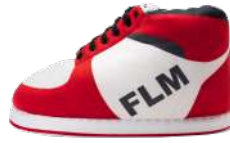
BULLIS ZA-9 BULLIS KIDS ZA-29