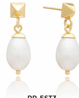
PP-EST3 £18.00 €20.70 Drop: 2.7cm