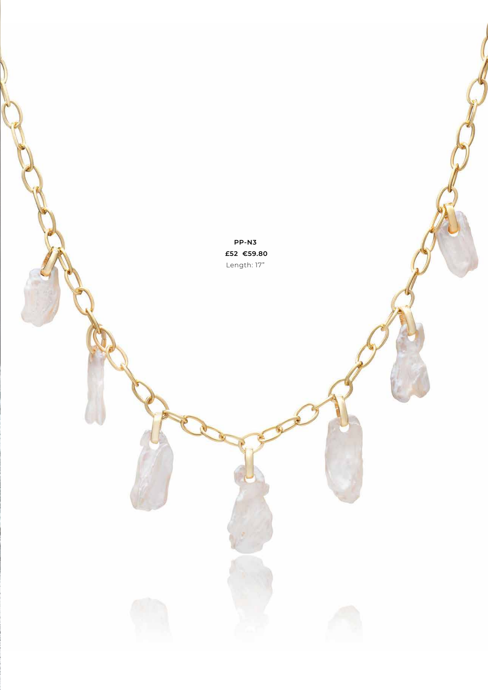
PP-N3 £52 €59.80 Length: 17"