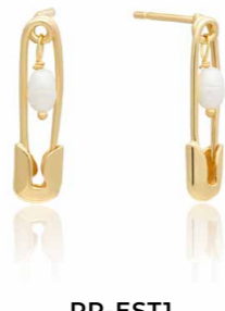
PP-EST1 £13.00 €14.95 Drop: 2cm