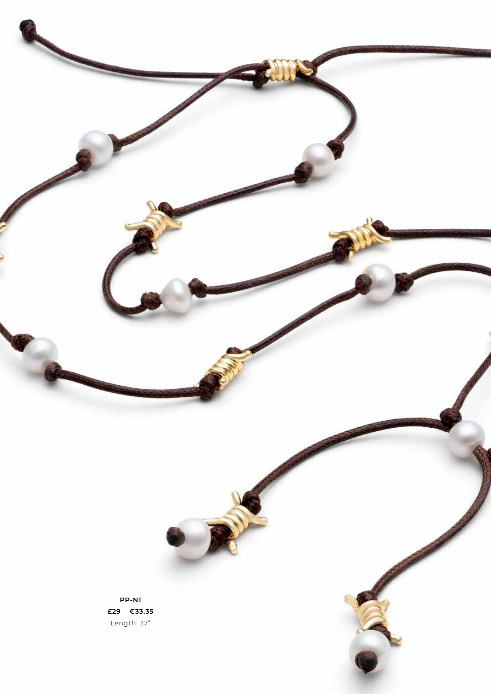
PP-N1 £29 €33.35 Length: 37"