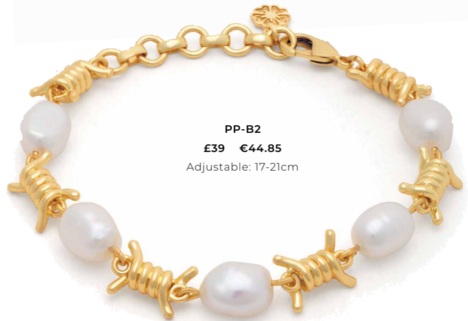
PP-B2 £39 €44.85 Adjustable: 17-21cm