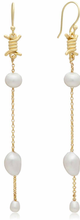
PP-E2 £24.00 €27.60 Drop: 11cm