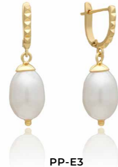
PP-E3 £20 €23 Drop: 3cm