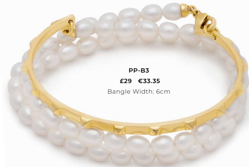
PP-B3 £29 €33.35 Bangle Width: 6cm