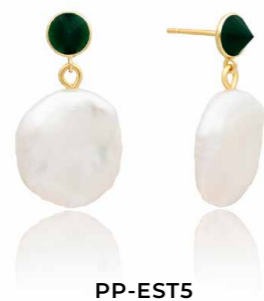
PP-EST5 £23 €26.45 Black Onyx Drop: 3.5cm