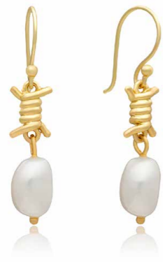
PP-E1 £18.50 €21.27 Drop: 4cm