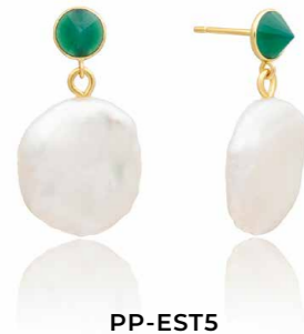
PP-EST5 £23 €26.45 Green Onyx Drop: 3.5cm

22kt gold plate on brass with fresh water pearl