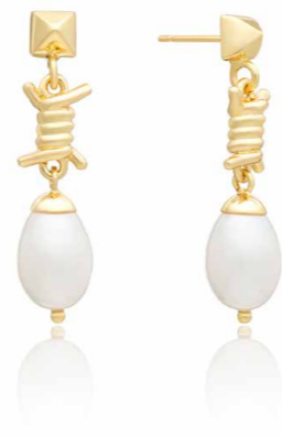
PP-EST4 £21.00 €24.15 Drop: 3.8cm