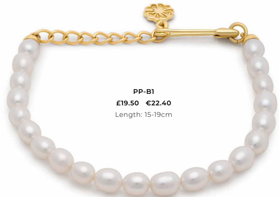
PP-B1 £19.50 €22.40 Length: 15-19cm