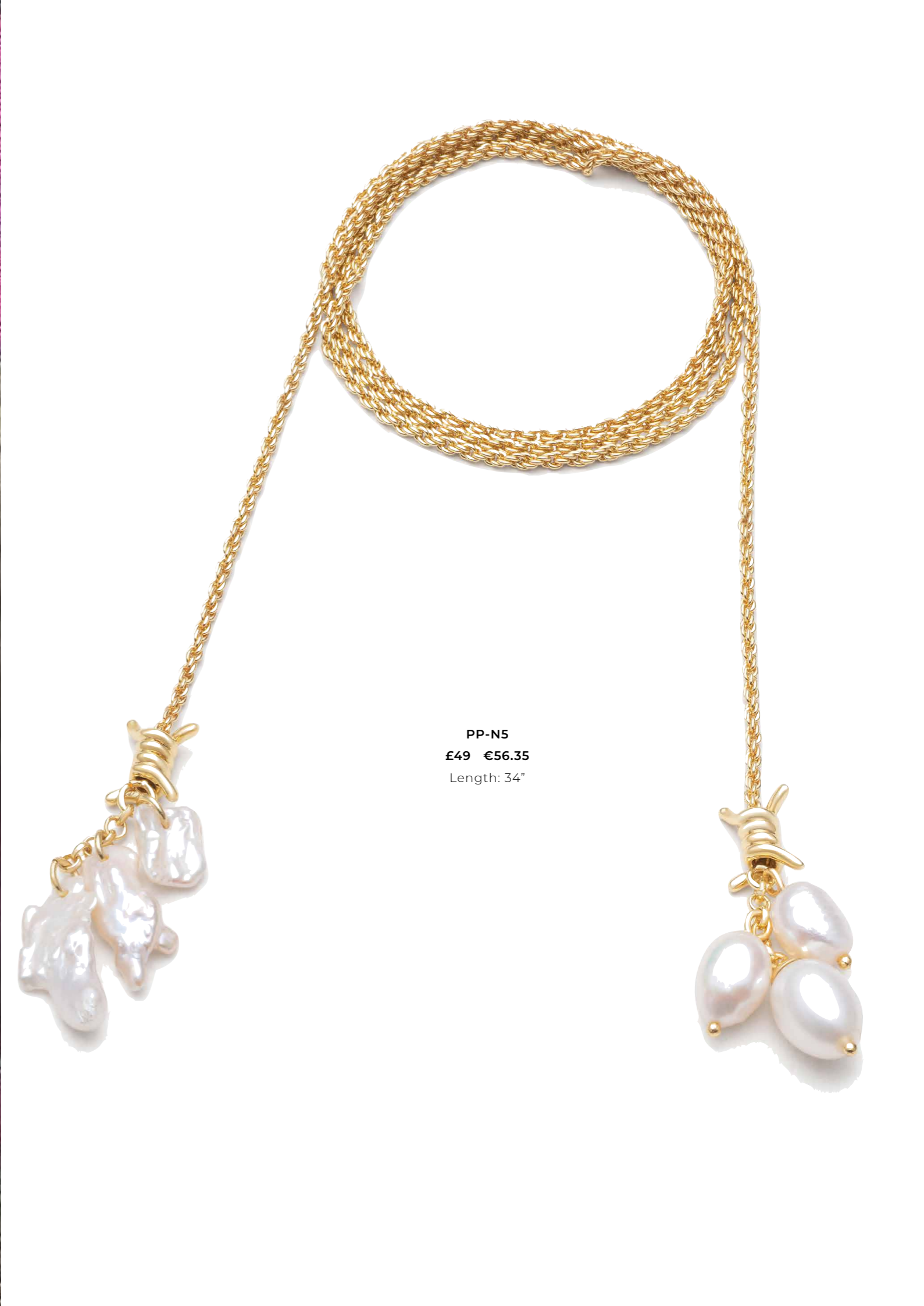
PP-N5 £49 €56.35 Length: 34"