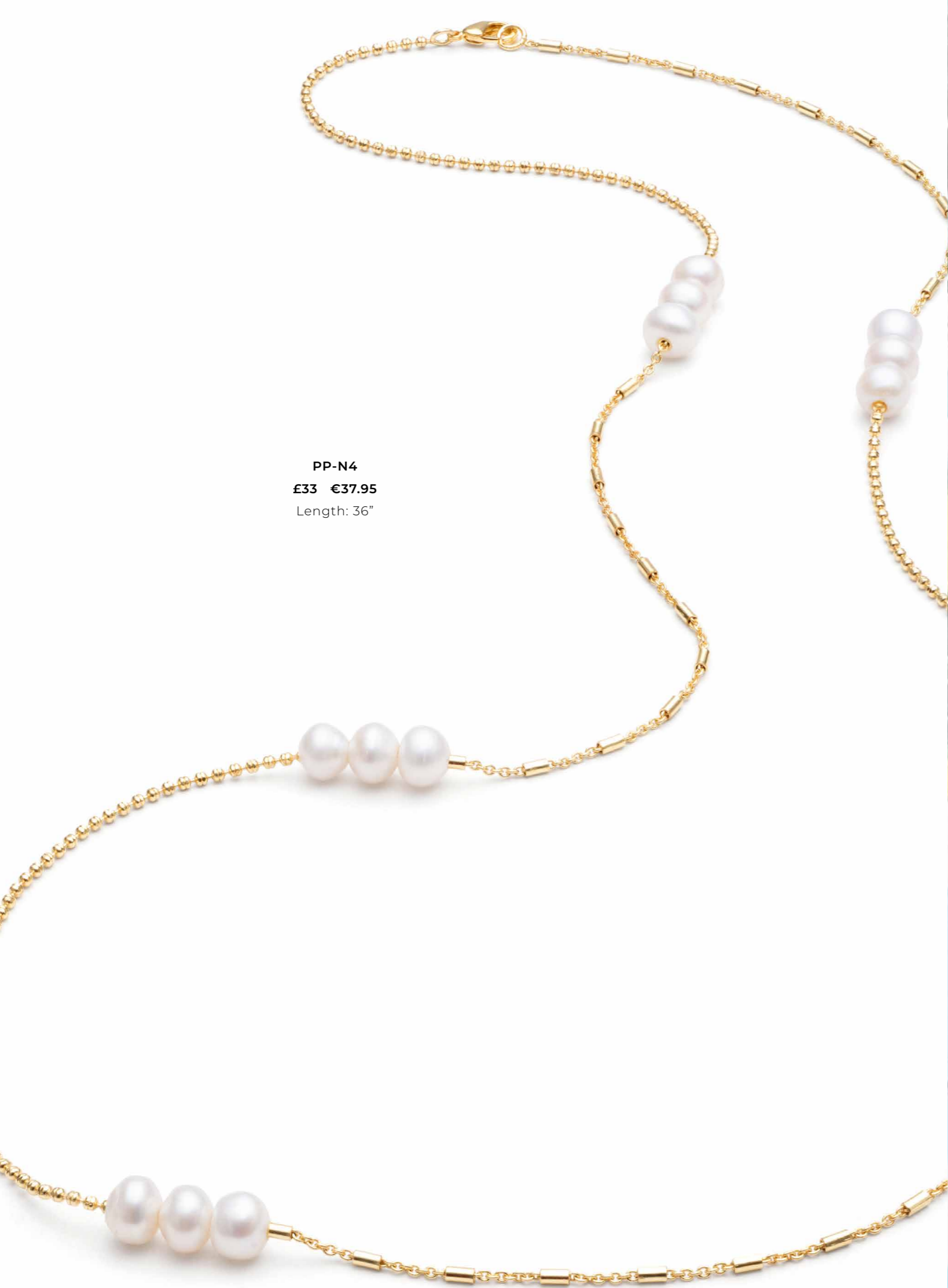
PP-N4 £33 €37.95 Length: 36"