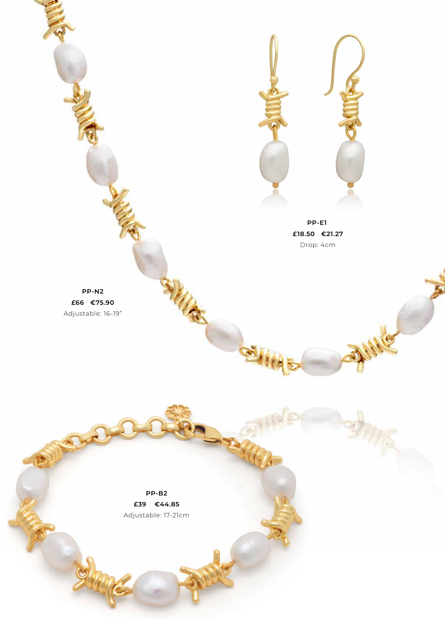
PP-N2 £66 €75.90 Adjustable: 16-19"