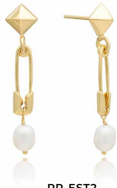
PP-EST2 £18.00 €20.70 Drop: 3.8cm