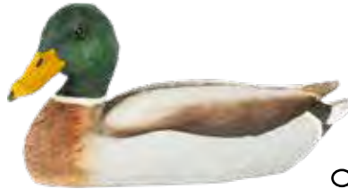
MALLARD MALE Anas platyrhynchos WG457 L: 248 W: 101 H: 121 mm