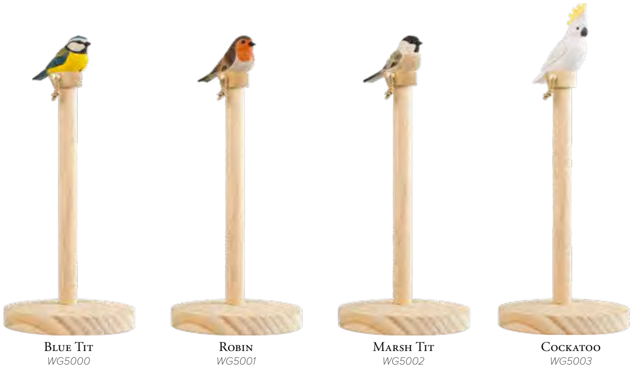
BLUE TIT WG5000

The kitchen roll holders playfully combine form and function. Atop each solid wood holder sits a wood-carved bird, hand-painted in eco-friendly paints. The kitchen roll holders come flat packed in three parts. Each pack contains two different-sized centre rods to suit different lengths of kitchen roll.