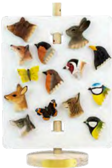
New – DISPLAY BOARD FOR MAGNETS D1003 L: 250 B: 139 H: 373 mm