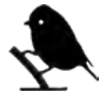
BLUE TIT WG704 L: 88 W: 20 H: 82 mm 63 g