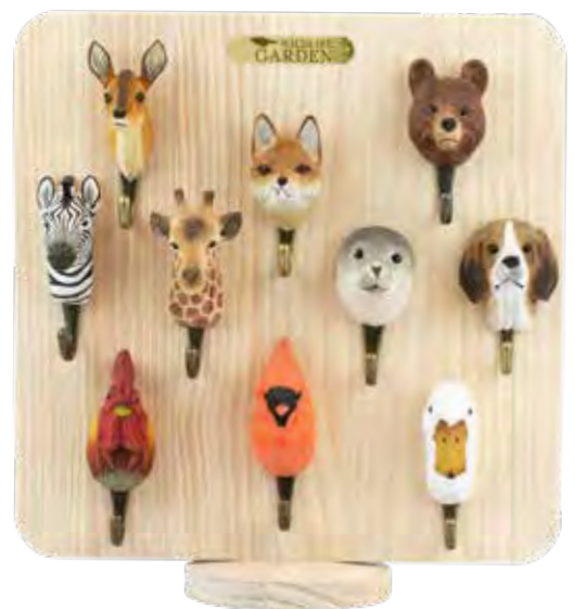
New — DISPLAY BOARD HOOKS