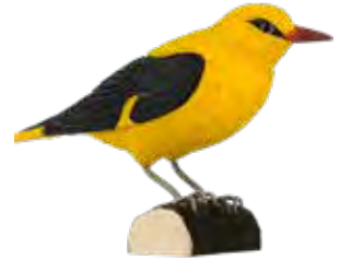
GOLDEN ORIOLE Oriolus oriolus WG4471 L: 218 W: 61 H: 125 mm