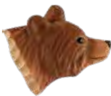
BROWN BEAR WG4913