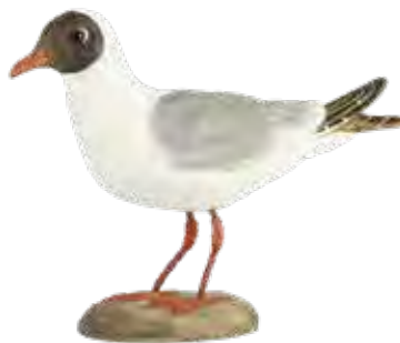
BLACK-HEADED GULL Chroicocephalus ridibundus WG460 L: 237 W: 72 H: 160 mm