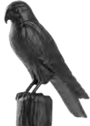
KESTREL WG7728 L: 180 W: 79 H: 232 mm 2,8 kg | 2 / pack