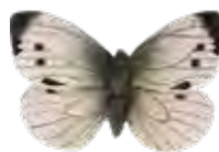
LARGE WHITE WG4598