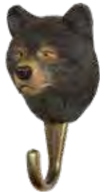
BLACK BEAR WG4546