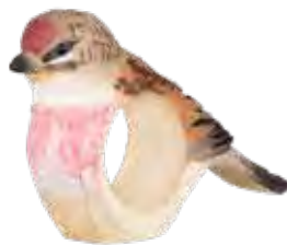
COMMON LINNET WG4572