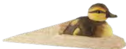
MALLARD DUCKLING WG588

Material: Hand-carved wood, non-toxic paint | Weight: 50–90 g | Dimensions: L: 159–175 W: 45 H: 43–56 mm Items/pack: 4 pcs