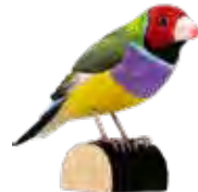
GOULDIAN FINCH Erythrura gouldiae WG4814 L: 117 W: 47 H: 100 mm 6 / pack