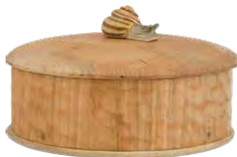
WOODEN BOX SNAIL