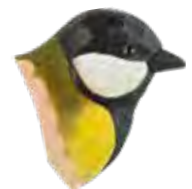
GREAT TIT WG4925

Material: Hand-carved wood, non-toxic paint, magnet | Weight: 6–9 g (Butterflies 3–4 g) Dimensions: Butterflies L: 52–60 W: 12–17 H: 32–40 mm Animals L: 54–67 W: 12 H: 48–78 mm Birds L: 49–51 W: 12 H: 50–55 mm | Items/pack: 10 pcs