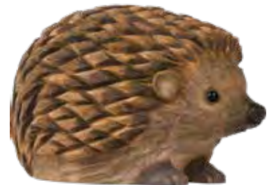
HEDGEHOG WG5946 L: 174 W: 89 H: 90 mm 380 g | 1 / pack

Material: Hand-carved wood, non-toxic paint