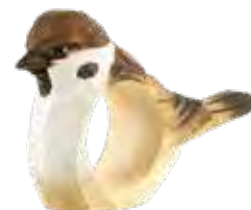
TREE SPARROW WG578