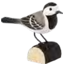
PIED WAGTAIL Motacilla alba WG4405