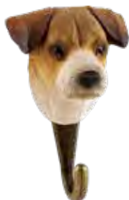
JACK RUSSELL TERRIER WG4496