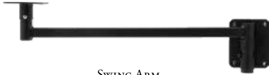
SWING ARM WG902 L: 520 W: 80 H: 185 mm 1 kg | 1 / pack Powder-coated steel

Create a wildlife haven with small changes in your garden—bird feeders, nests, and bird baths can do wonders. When tree- or wall-mounting is not an option, you can opt for a post or swing arm that fits most of our Multiholks, nests and bird feeders. Outdoor candles in the garden give a cosy atmosphere when evening approaches. Lift the light a bit higher with a pole to create interesting shadows in the darkness.