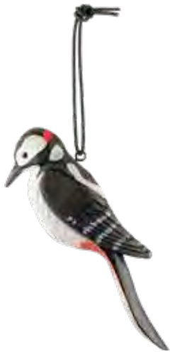
WOODPECKER WG4997 L: 75 W: 41 H: 228 mm

Let these decorative nature-inspired shoehorns adorn the hallway. The hand-carved woodpecker, merlin, and northern cardinal have elongated tailfeathers that form a practical shoehorn. If you prefer a longer shoehorn, there is also a stylish owl made of lacquered steel. Use the leather strip to hang the shoehorns.