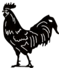
ROOSTER WG757 L: 262 W: 20 H: 306 mm 395 g