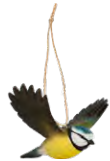
FLYING BLUE TIT Cyanistes caeruleus WG4441 L: 96 W: 135 H: 78 mm 4/pack