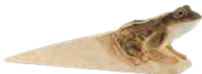
MOOR FROG WG584

These handcrafted doorstops draw inspiration from the animal kingdom. Each has a wood-carved forest animal motif, hand-painted in environmentally friendly paints. The artisans carve the doorstops out of a single piece of wood, and the underside has an anti-slip silicone coating.