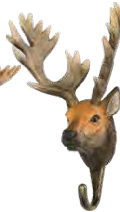
RED DEER WG509