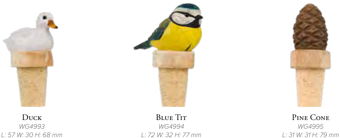
DUCK WG4993 L: 57 W: 30 H: 68 mm

Inspired by nature's natural shapes and designs, we have developed a motley yet stylish collection of bottle stoppers. The detailed, hand-carved bottle stoppers are hand-painted with a water-based colour that is gentle on the environment. A delightful and practical table setting detail where we bring nature closer to stimulate conversations.