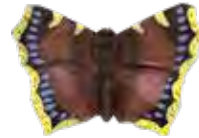
CAMBERWELL BEAUTY WG594