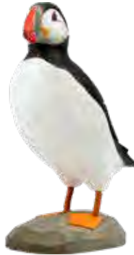
New – ATLANTIC PUFFIN