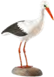
WHITE STORK Ciconia ciconia WG469 L: 160 W: 65 H: 213 mm