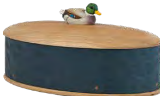
WOODEN BOX MALLARD