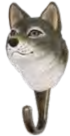
GREY WOLF WG505