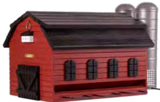
GIANT SILO BARN WG294

The Giant Silo Barn is an extra-spacious bird feeder with room for different seed mixes, suet balls and peanuts. Its interior compartments hold 10 l of birdseed, and the two silos have room for suet balls and peanuts.