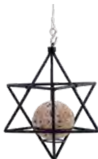
STAR BLACK WG329

The star is easy to refill, and its bars are just the right thickness for birds to be able to perch on. Hang it on a tree, bush or balcony using the accompanying wire.