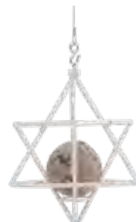
STAR WHITE WG331

Material: Powder-coated steel | Weight: 0.1 kg | Dimensions: L: 147 W: 147 H: 160 mm | Accessories: Metal wire | Items/pack: 12 pcs