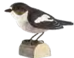
PIED FLYCATCHER Ficedula hypoleuca WG4415

Material: Hand-carved wood, non-toxic paint | Weight: 20–100 g | Dimensions: The birds are life-sized | Items/pack: 6 pcs