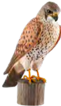
COMMON KESTREL Falco tinnunculus WG4470 L: 208 W: 81 H: 238 mm