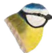
BLUE TIT WG4924