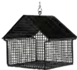
PEANUT FEEDER COTTAGE BLACK WG3345