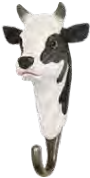
BLACK & WHITE COW WG515