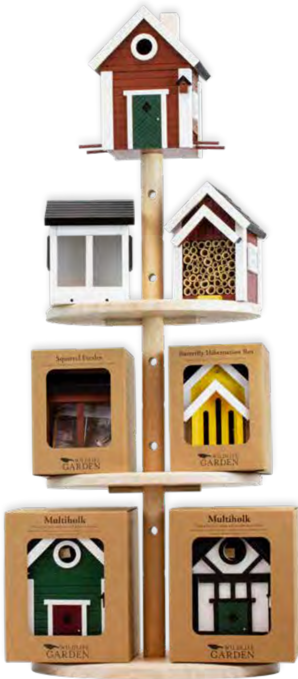
New — SHELF DISPLAY FOR HOUSES AND FEEDERS