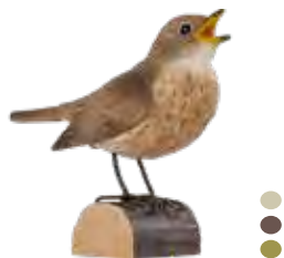
THRUSH NIGHTINGALE Luscinia luscinia WG4440