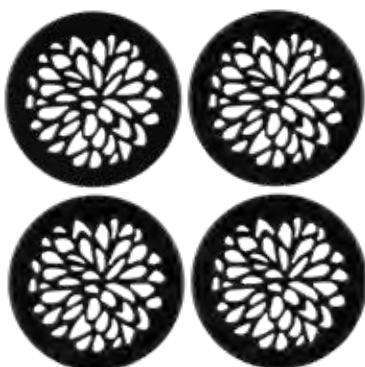
DAHLIA BLACK WG7761

Each pack contains four tablecloth weights.