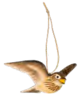
FLYING SKYLARK Alauda arvensis WG4446 L: 125 W: 134 H: 52 mm 4/pack

Material: Hand-carved wood, non-toxic paint | Weight: 30–65 g