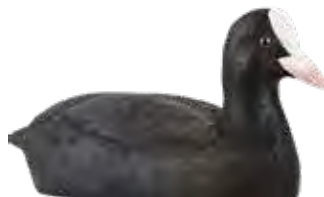
EURASIAN COOT Fulica atra WG4473 L: 212 W: 105 H: 92 mm