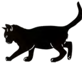
BALANCING CAT WG750 L: 377 W: 23 H: 271 mm 470 g