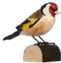
GOLDFINCH Carduelis carduelis WG406