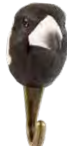
AUSTRALIAN MAGPIE WG4489