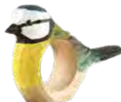
BLUE TIT WG577