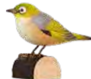
SILVEREYE Zosterops lateralis WG4811 L: 109 W: 48 H: 78 mm 6 / pack