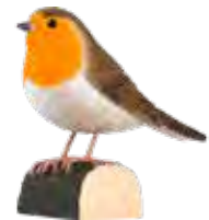
ROBIN Erithacus rubecula WG4404