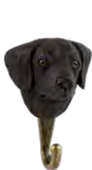
LABRADOR RETRIEVER WG4490

Humans' best friend – the dog – is also our oldest companion. Inspired by popular dog breeds, we created a collection of wood-carved hooks with dog motifs.