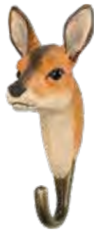
ROE DEER WG507