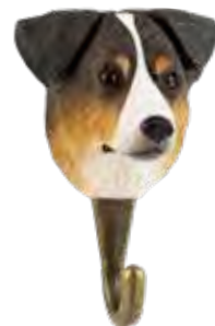
AUSTRALIAN SHEPHERD WG4494