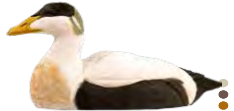
EIDER DUCK Somateria mollissima WG458 L: 277 W: 101 H: 124 mm