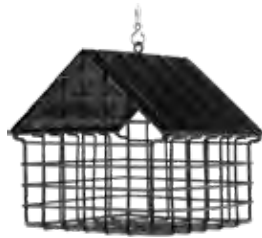
SUET BALL FEEDER COTTAGE BLACK WG3343

Shaped like small cottages, these hanging bird feeders have a clever design. The mesh gives the best grip possible while minimising the risk of diseases spreading between the birds.