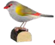
RED-BROWED FINCH Neochmia temporalis WG4803 L: 113 W: 49 H: 88 mm 6 / pack