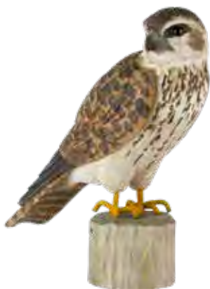
MERLIN Falco columbarius WG462 L: 205 W: 78 H: 209 mm