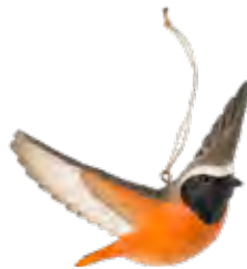
FLYING REDSTART Phoenicurus phoenicurus WG4445 L: 124 W: 120 H: 70 mm 4/pack