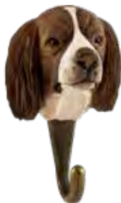
SPRINGER SPANIEL WG4497