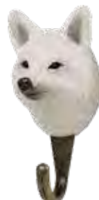
ARCTIC FOX WG4796