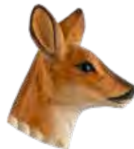
ROE DEER WG4915