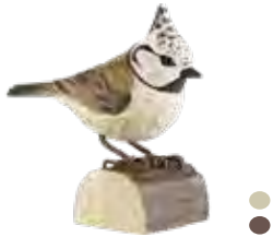
CRESTED TIT Lophophanes cristatus WG428