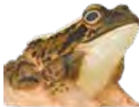
MOOR FROG WG5944 L: 76 W: 45 H: 44 mm 27 g | 4 / pack