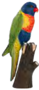
RAINBOW LORIKEET Trichoglossus moluccanus WG4800 L: 117 W: 70 H: 262 mm 1 / pack