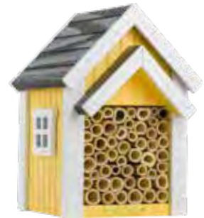
BEE NEST YELLOW WG312 L: 160 W: 155 H: 212 mm

Material: butterfly box: solid wood / bee hotel: solid wood, bamboo canes | Weight: butterfly box: 0,6 kg / bee hotel: 0,8 kg Accessories: Screws