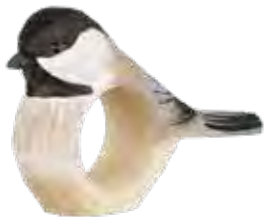
MARSH TIT WG4571