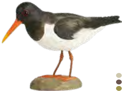
OYSTERCATCHER Haematopus ostralegus WG459 L: 258 W: 71 H: 158 mm