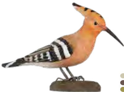
EURASIAN HOPOE Upupa epops WG4472 L: 240 W: 63 H: 155 mm