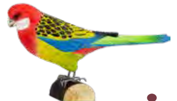
EASTERN ROSELLA Platycercus eximius WG4807 L: 258 W: 66 H: 164 mm 1 / pack