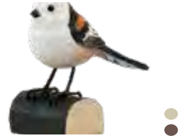
LONG-TAILED TIT Aegithalos caudatus WG420