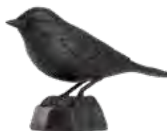
SPARROW STANDING WG726 L: 128 W: 49 H: 81 mm 0,3 kg | 6 / pack