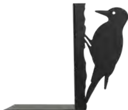
WOODPECKER RIGHT WG7766

Material: Powder-coated steel | Weight: 400 g | Dimensions: L: 178 W: 111 H: 153 mm | Items/pack 1 pc