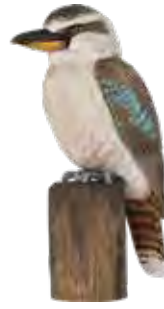
LAUGHING KOOKABURRA Dacelo novaeguineae WG4802 L: 137 W: 74 H: 223 mm 1 / pack