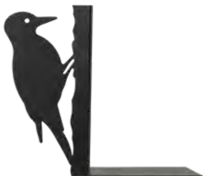
WOODPECKER LEFT WG7765

These practical lacquered steel bookends with woodpecker motifs are playful homeware details that fit nicely on the bookshelf or the writer's desk. The bookends are available for placing either on the left or the right.