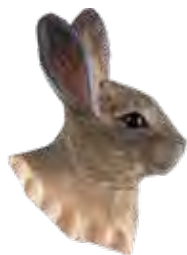
MOUNTAIN HARE WG4914