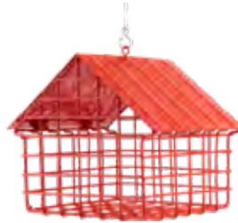
SUET BALL FEEDER COTTAGE RED WG3344