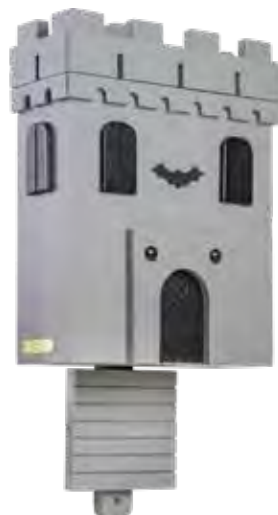
BAT CASTLE WG306

Bats need a place to rest during the day, and in colder climates, they even use the nest during hibernation. Place the nest in a south-facing position, three to four meters above the ground.