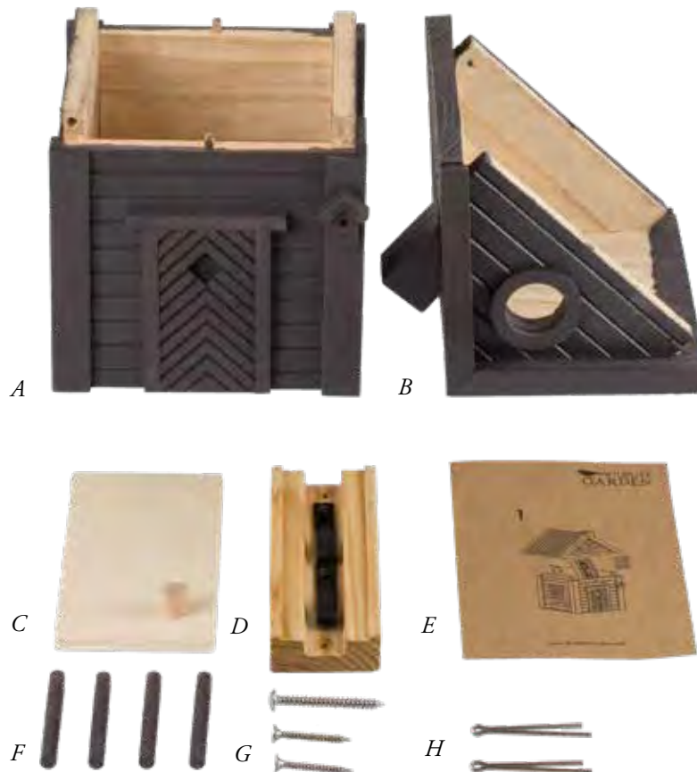
A. House body