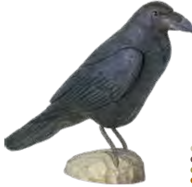
RAVEN Corvus corax WG466 L: 325 W: 94 H: 260 mm