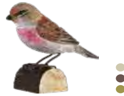
COMMON LINNET Linaria cannabina WG426