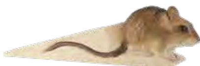
WOOD MOUSE WG586