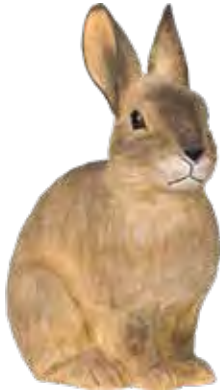
EUROPEAN RABBIT WG5941 L: 150 W: 78 H: 174 mm 260 g | 1 / pack

The collection of wood-carved animals is the perfect decoration for the living room or the conservatory. The selection represents well-known garden visitors, hand-painted in environmentally friendly paints. Being handmade makes each piece unique, and some variations may appear between items.