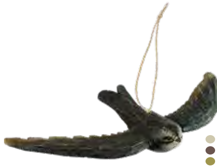
COMMON SWIFT Apus apus WG422 L: 129 W: 275 H: 36 mm 1/pack