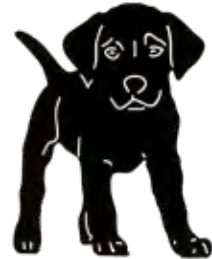
STANDING PUPPY WG751 L: 238 W: 20 H: 300 mm 500 g