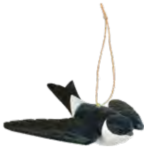
HOUSE MARTIN Delichon urbicum WG421 L: 132 W: 143 H: 30 mm 1/pack