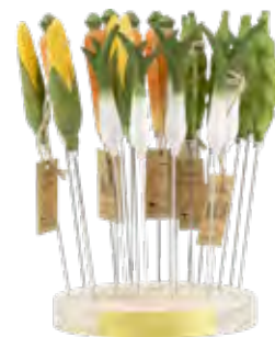
New – DISPLAY CAKE TESTERS D1004 L: 139 B: 139 H: 25 mm

To see more of our display materials, log into our retailer webshop, or contact us at +46 431-768 00 or info@wildlifegarden.se.