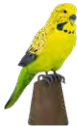
BUDGERIGAR Melopsittacus undulatus WG4810 L: 155 W: 52 H: 151 mm 4 / pack