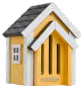
BUTTERFLY HIBERNATION BOX YELLOW WG303 L: 160 W: 157 H: 209 mm