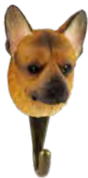
GERMAN SHEPHERD DOG WG4491