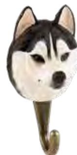
SIBERIAN HUSKY WG4499