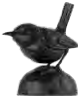
WREN WG711 L: 73 W: 43 H: 88 mm 0,4 kg | 6 / pack