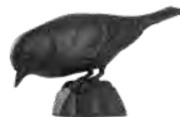
SPARROW EATING WG727 L: 121 W: 47 H: 69 mm 0,4 kg | 6 / pack

Material: Cast iron | Other: N.B. cast iron is a natural material that rusts when exposed to moisture.