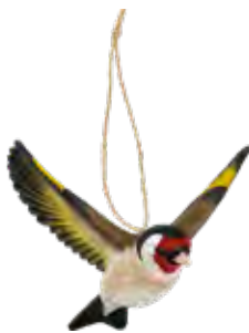
FLYING GOLDFINCH Carduelis carduelis WG4442 L: 105 W: 120 H: 75 mm 4/pack