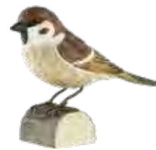
TREE SPARROW Passer montanus WG408