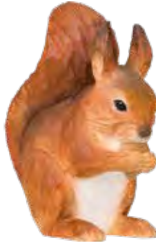
RED SQUIRREL WG5942 L: 140 W: 70 H: 158 mm 250 g | 1 / pack