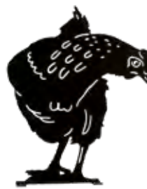
OBSERVING HEN WG758 L: 241 W: 22 H: 286 mm 410 g

Material: Powder-coated steel | Items/pack: 4 pcs