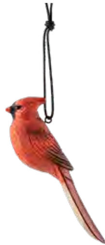
NORTHERN CARDINAL WG4999 L: 69 W: 41 H: 223 mm