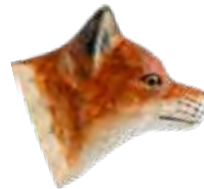
RED FOX WG4911