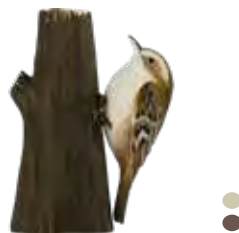
COMMON TREECREEPER Certhia familiaris WG4443