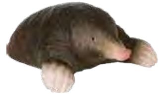
EUROPEAN MOLE WG5943 L: 108 W: 88 H: 41 mm 57 g | 6 / pack