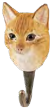
New – HOUSE CAT WG4512