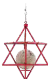
STAR RED WG330