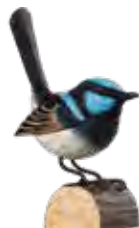
SUPERB FAIRYWREN Malurus cyaneus WG4805 L: 74 W: 49 H: 120 mm 6 / pack