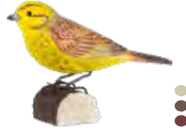
YELLOWHAMMER Emberiza citrinella WG419