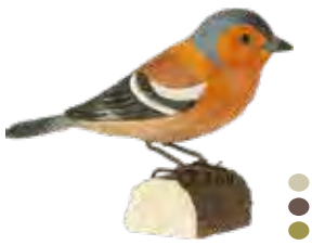
CHAFFINCH Fringilla coelebs WG416