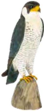
PEREGRINE FALCON Falco peregrinus WG465 L: 225 W: 99 H: 310 mm