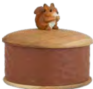
WOODEN BOX SQUIRREL

The boxes are genuine crafts pieces whose materials have a unique character and feel. Each wooden box is made to age beautifully. The carved surface casts beautiful surface shadows that enhance the natural feel of the material.