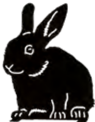
SITTING RABBIT WG752 L: 161 W: 40 H: 203 mm 280 g