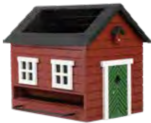
RED HOUSE WG352

The bird feeder is made of wood. The roof with the built-in pool consists of weather- and frost-resistant plastic.