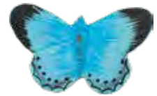
HOLLY BLUE WG595