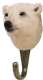
POLAR BEAR WG4793