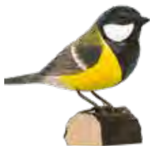
GREAT TIT Parus major WG401