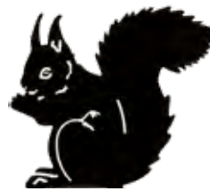
EATING SQUIRREL WG754 L: 191 W: 20 H: 160 mm 250 g