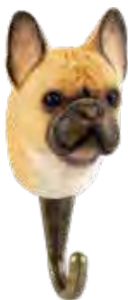
FRENCH BULLDOG WG4492