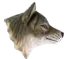
GREY WOLF WG4912