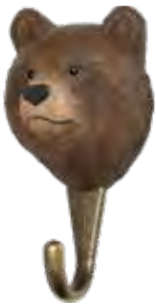
BROWN BEAR WG506