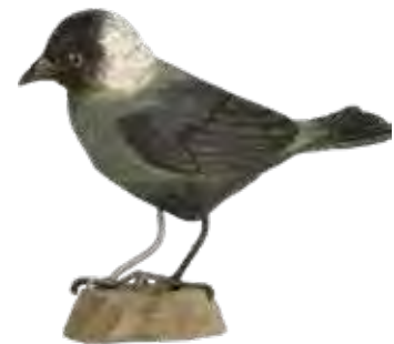
JACKDAW Corvus monedula WG464 L: 215 W: 61 H: 165 mm