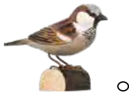
HOUSE SPARROW Passer domesticus WG434