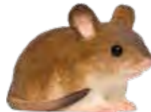
MOUSE WG5945 L: 74 W: 38 H: 45 mm 23 g | 4 / pack