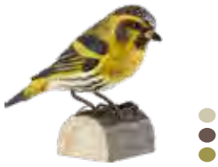
EURASIAN SISKIN Spinus spinus WG423