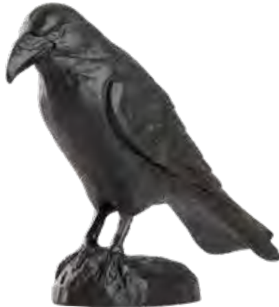
RAVEN WG715 L: 290 W: 90 H: 234 mm 4 kg | 2 / pack