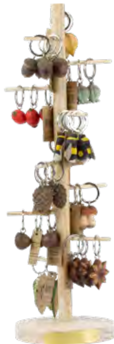
New – DISPLAY KEYRINGS, SHOEHORNS, HANGING PENS D1005 L: 139 B: 139 H: 473 mm