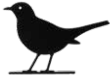
BLACKBIRD WG701 L: 170 W: 20 H: 114 mm 128 g

Some silhouettes (WG701–WG706) can stand independently without screws, while others come with additional footrests that enable them to stand independently (WG752–WG758). To make WG750 and WG751 stand, fasten them to a surface using screws or pegs.