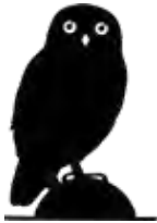
LITTLE OWL WG706 L: 122 W: 20 H: 174 mm 187 g