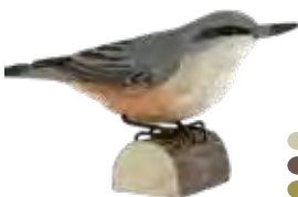
NUTHATCH Sitta europaea WG410