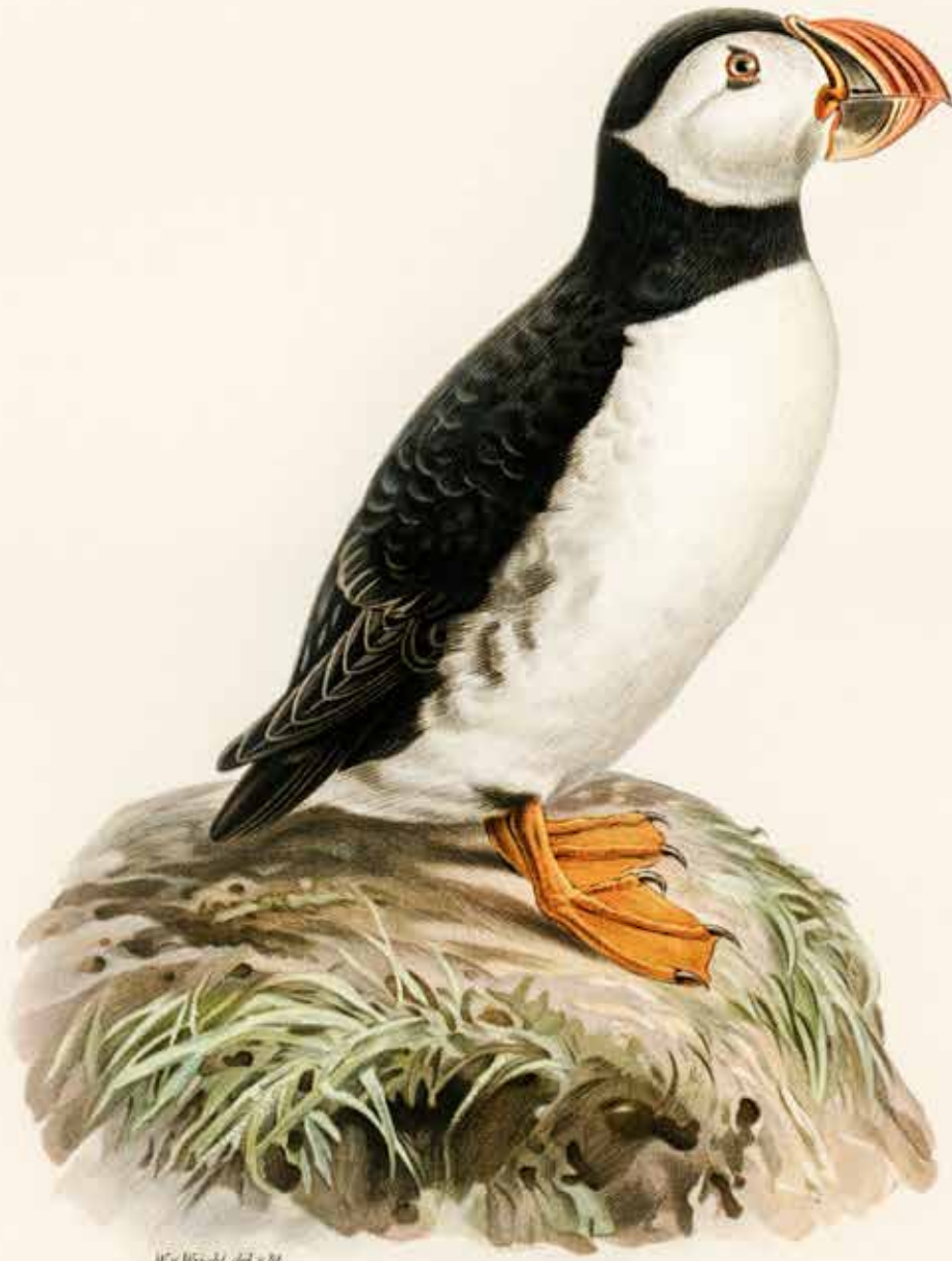
FRATERCULA ARCTICA LIN. ♂ / 10 Lunnefågel.