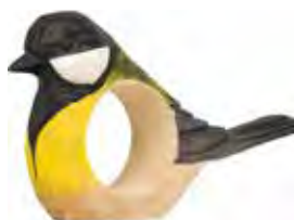
GREAT TIT WG576