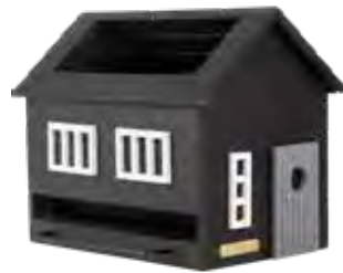
BLACK HOUSE WG355