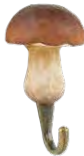
PENNY BUN WG4557