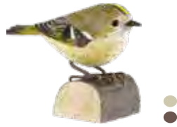
GOLDCREST Regulus regulus WG425