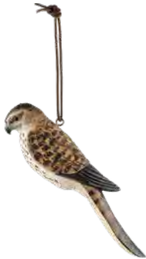
MERLIN WG4998 L: 69 W: 41 H: 230 mm