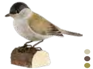
BLACKCAP Sylvia atricapilla WG436