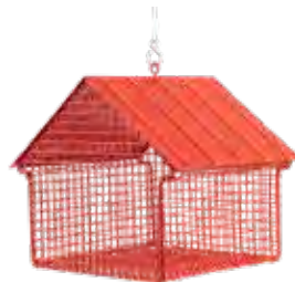
PEANUT FEEDER COTTAGE RED WG3346

Material: Powder-coated steel | Weight: 0,3 kg | Dimensions: L: 150–152 W: 125 H: 137 mm | Capacity: Approximately 6 suet balls / 1,2 l peanuts Accessories: Metal wire | Items/pack: 4 pcs