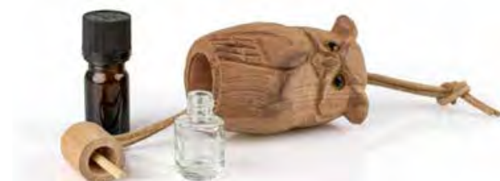
CEDAR EAGLE-OWL WG4601

An eagle-owl, hand-carved out of red cedar wood, guards the clothes in your wardrobe. Inside the owl is a diffuser filled with cedar oil that spreads a refreshing scent. Hang the owl from a clothes hanger using the leather string at the top of the owl's head. When the cedar oil runs out, refill it with the 10 ml cedar oil refill bottle.