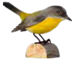
EASTERN YELLOW ROBIN Eopsaltria australis WG4801 L: 155 W: 53 H: 100 mm 4 / pack