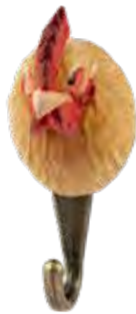
New – HEN WG4511