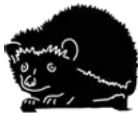
HEDGEHOG WG753 L: 153 W: 40 H: 120 mm 136 g