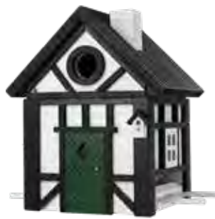
HALF-TIMBERED BLACK COTTAGE