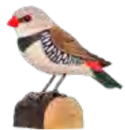
DIAMOND FIRETAIL Stagonopleura guttata WG4812 L: 110 W: 50 H: 95 mm 6 / pack