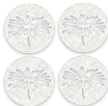
DAISY WHITE WG7762