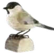
MARSH TIT Poecile palustris WG403