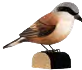
RED-BACKED SHRIKE Lanius collurio WG4447