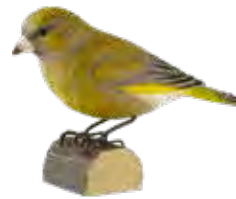
GREENFINCH Chloris chloris WG407