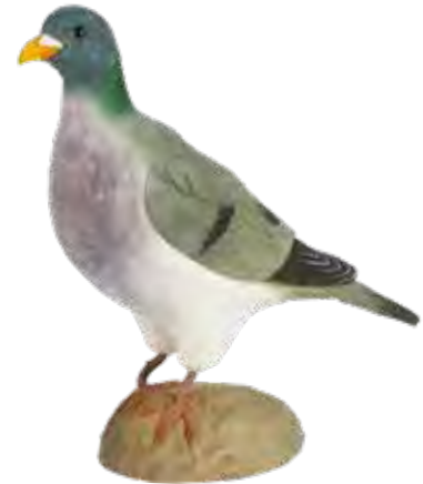
Stock Dove Columba oenas WG461 L: 220 W: 81 H: 254 mm