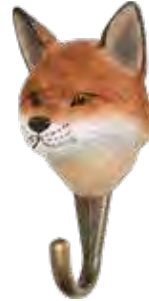
RED FOX WG504