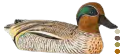
EURASIAN TEAL Anas crecca WG4474 L: 235 W: 80 H: 85 mm