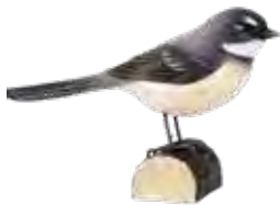
GREY FANTAIL Rhipidura albiscapa WG4808 L: 155 W: 49 H: 93 mm 4 / pack