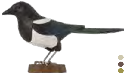
MAGPIE Pica pica WG4456 L: 334 W: 67 H: 164 mm