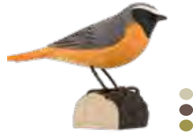
REDSTART Phoenicurus phoenicurus WG4417