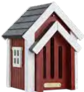
BUTTERFLY HIBERNATION BOX RED WG300 L: 160 W: 157 H: 209 mm

The Nordic countries share a rich history of timber-clad housing, and white-trimmed red cottages dot the countryside. Our range of insect hotels reflects this heritage. In collaboration with experts, these nests draw pollinators to our gardens by giving them a place to stay—boosting biodiversity and increasing harvests.