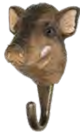
WILD BOAR WG503