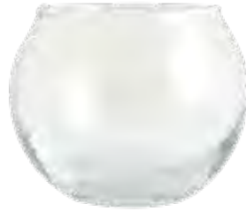
TEALIGHT HOLDER GLASS WG332

The tealight holder, made of clear glass, is specially designed to complement the Suet Ball Feeder Star. When not used as a feeder, the star becomes a candle holder, spreading warm light wherever it hangs.