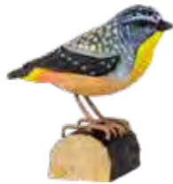
SPOTTED PARDALOTE Pardalotus punctatus WG4804 L: 80 W: 49 H: 83 mm 6 / pack