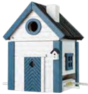
WHITE & BLUE COTTAGE