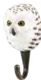
SNOWY OWL WG4795