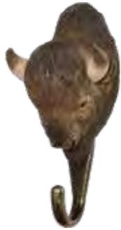
AMERICAN BISON WG4543