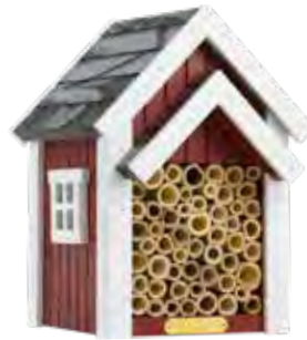
BEE NEST RED WG311 L: 160 W: 155 H: 212 mm