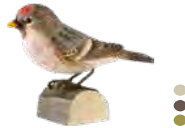
REDPOLL Acanthis flammea WG435