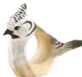
CRESTED TIT WG580

Material: Hand-carved wood, non-toxic paint | Weight: 30–40 g Dimensions: Birds L: 110–123 W: 26 H: 66–77 mm Animals: L: 88–110 W: 26 H: 55–73 mm | Items/pack: 6 pcs