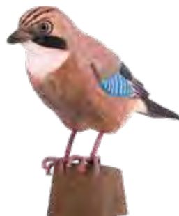
JAY Garrulus glandarius WG4463 L: 221 W: 68 H: 150 mm