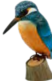
KINGFISHER Alcedo atthis WG4454