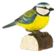
BLUE TIT Cyanistes caeruleus WG402