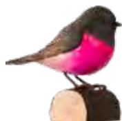
PINK ROBIN Petroica rodinogaster WG4813 L: 105 W: 47 H: 90 mm 6 / pack