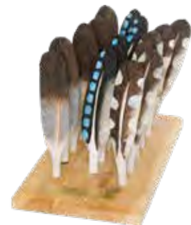
DISPLAY BOARD PENS D530 L: 280 B: 18 H: 145 mm