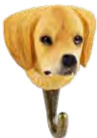
GOLDEN RETRIEVER WG4495