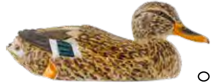
MALLARD FEMALE Anas platyrhynchos WG468 L: 254 W: 100 H: 87 mm