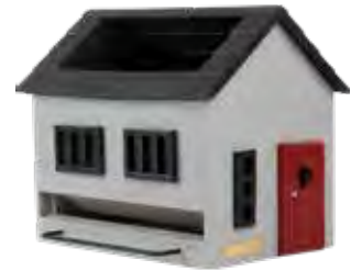
GREY HOUSE WG356

Material: Wood, recyclable plastic roof | Weight: 1.1 kg | Dimensions: L: 171 W: 241 H: 202 mm | Capacity: 2.5 l of seeds Accessories: Screws, metal perches | Items/pack: 4 pcs