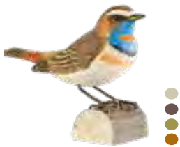
BLUETHROAT Luscinia svecica WG433