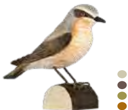
NORTHERN WHEATEAR Oenanthe oenanthe WG4439