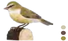
CHIFFCHAFF Phylloscopus collybita WG432