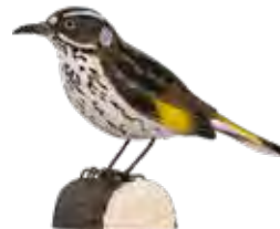
NEW HOLLAND HONEYEATER Phylidonyris novaehollandiae WG4806 L: 174 W: 53 H: 111 mm 4 / pack