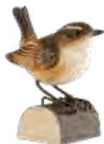
WREN Troglodytes troglodytes WG413