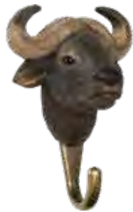
AFRICAN BUFFALO WG4538