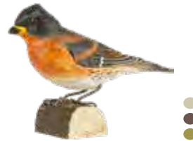
BRAMBLING Fringilla montifringilla WG431