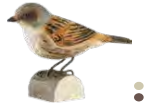
DUNNOCK Prunella modularis WG427