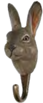
MOUNTAIN HARE WG510