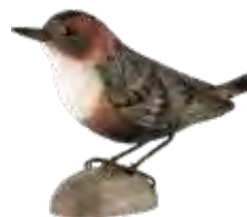
DIPPER Cinclus cinclus WG414