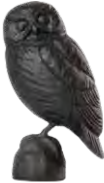
OWL WG714 L: 100 W: 77 H: 186 mm 1,8 kg | 4 / pack

Wildlife Gardens' series of cast iron figurines are lifelike reproductions of various birds. Place the sculptures either indoors or outdoors. If placed outside, they develop a rustic patina with time.