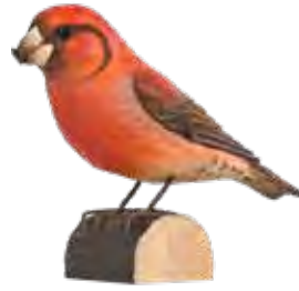
RED CROSSBILL Loxia curvirostra WG4444