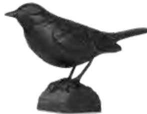
BLACKBIRD WG712 L: 160 W: 52 H: 101 mm 0,6 kg | 4 / pack