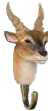
COMMON ELAND WG4540