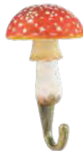
FLY AGARIC WG4558

Material: Hand-carved wood, non-toxic paint | Dimensions: L: 37–103 W: 37–90 H: 98–185 mm | Weight: 60–80 g Accessories: Informative booklet about the species | Items/pack: 4 pcs