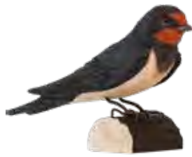
BARN SWALLOW Hirundo rustica WG4438