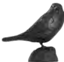
SPARROW SITTING WG725 L: 97 W: 48 H: 91 mm 0,3 kg | 6 / pack