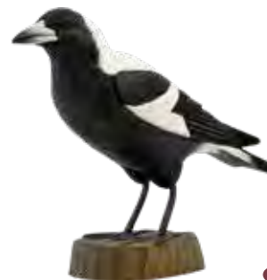
New-Australian MAGPIE Gymnorhina tibicen WG4815 L: 290 B: 97 H: 230 mm 1 / pack

Material: Hand-carved wood, non-toxic paint | Weight: 37–550 g