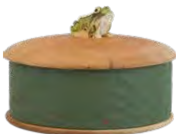
WOODEN BOX FROG