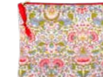
Lodden Wild Cherry