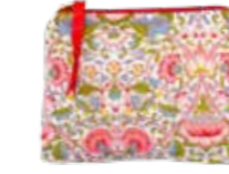
Lodden Wild Cherry