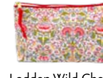
Lodden Wild Cherry