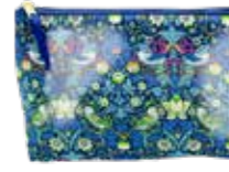
Strawberry Thief Songbird