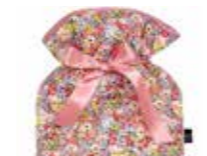
Thorpe Hill Coral