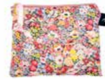
Thorpe Hill Coral