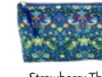
Strawberry Thief Songbird