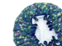
Strawberry Thief Songbird