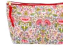
Lodden Wild Cherry