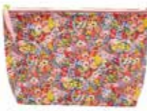
Thorpe Hill Coral