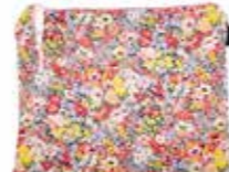
Thorpe Hill Coral