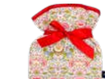
Lodden Wild Cherry