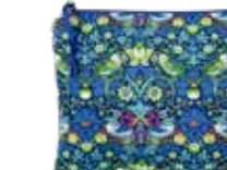
Strawberry Thief Songbird