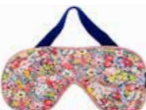
Thorpe Hill Coral