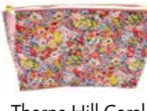
Thorpe Hill Coral