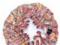
Thorpe Hill Coral