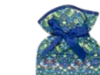
Strawberry Thief Songbird