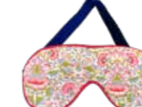
Lodden Wild Cherry