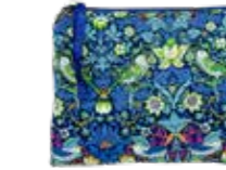
Strawberry Thief Songbird