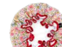
Lodden Wild Cherry