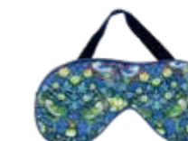
Strawberry Thief Songbird