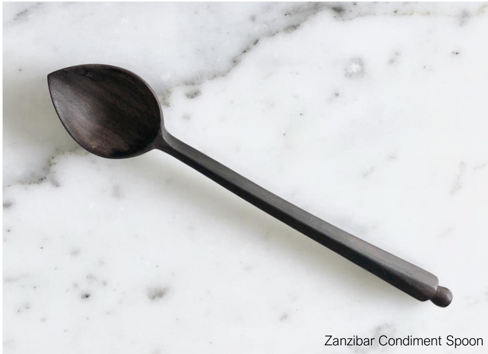
Zanzibar Condiment Spoon