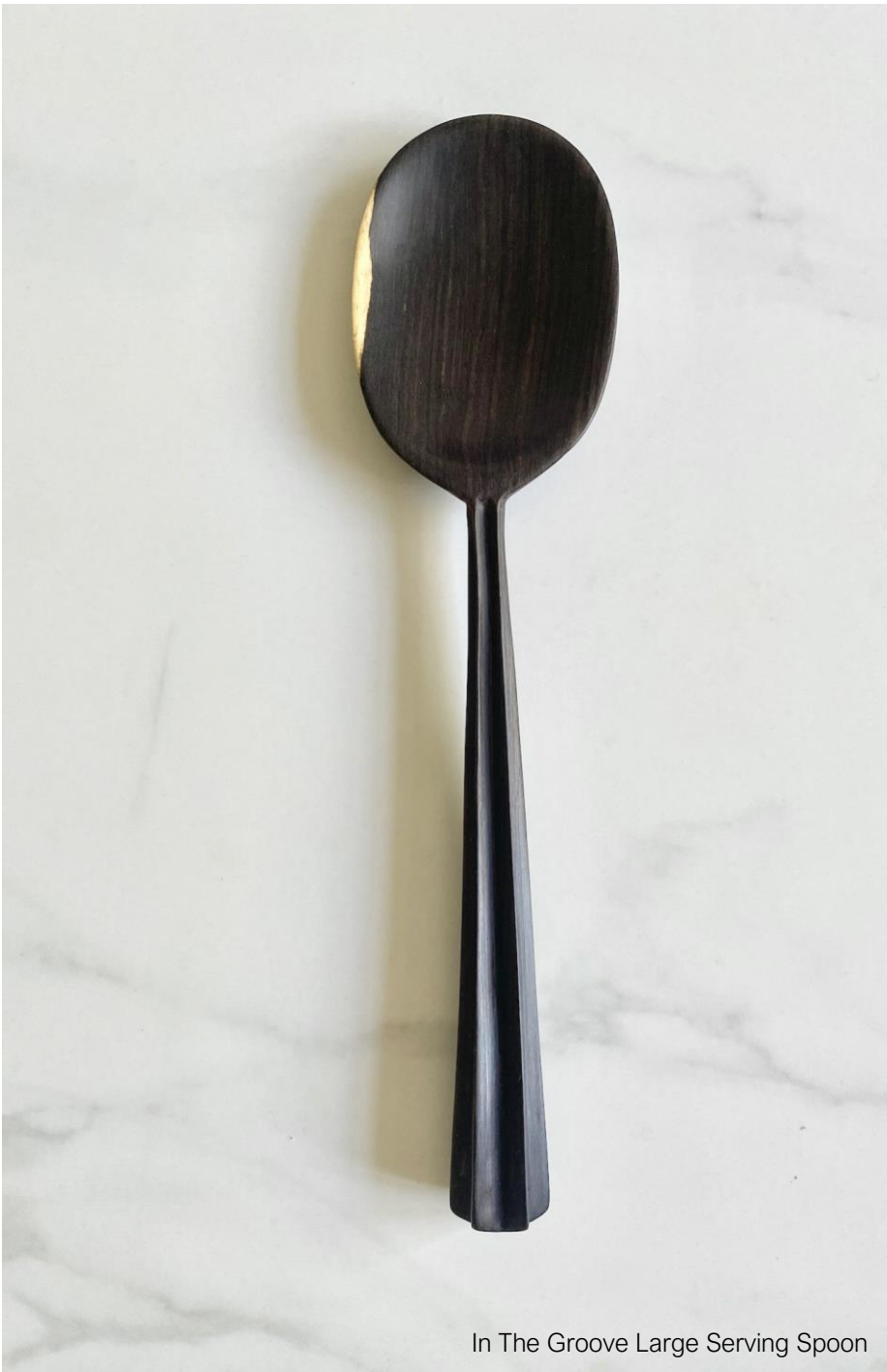
In The Groove Large Serving Spoon