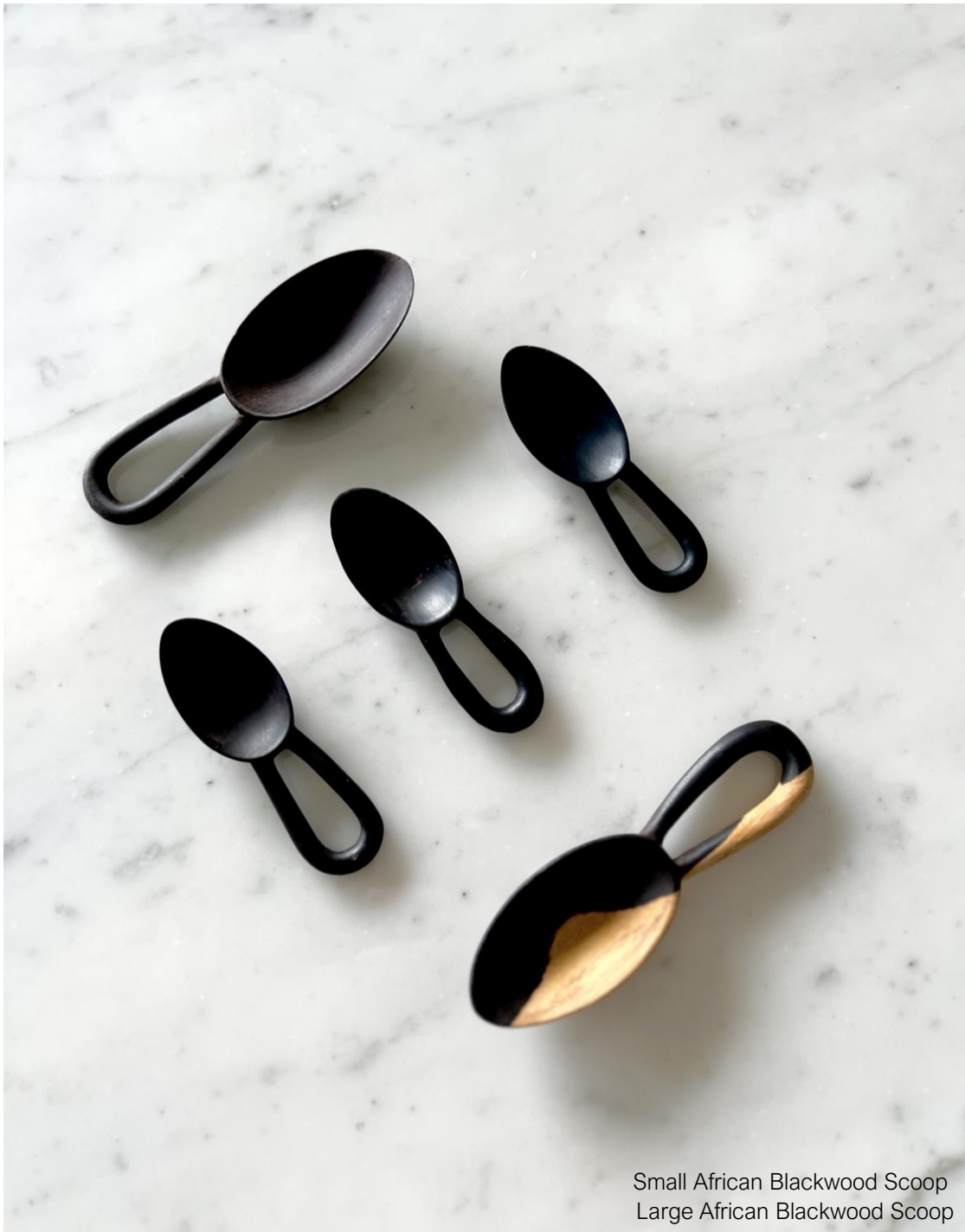
Small African Blackwood Scoop Large African Blackwood Scoop