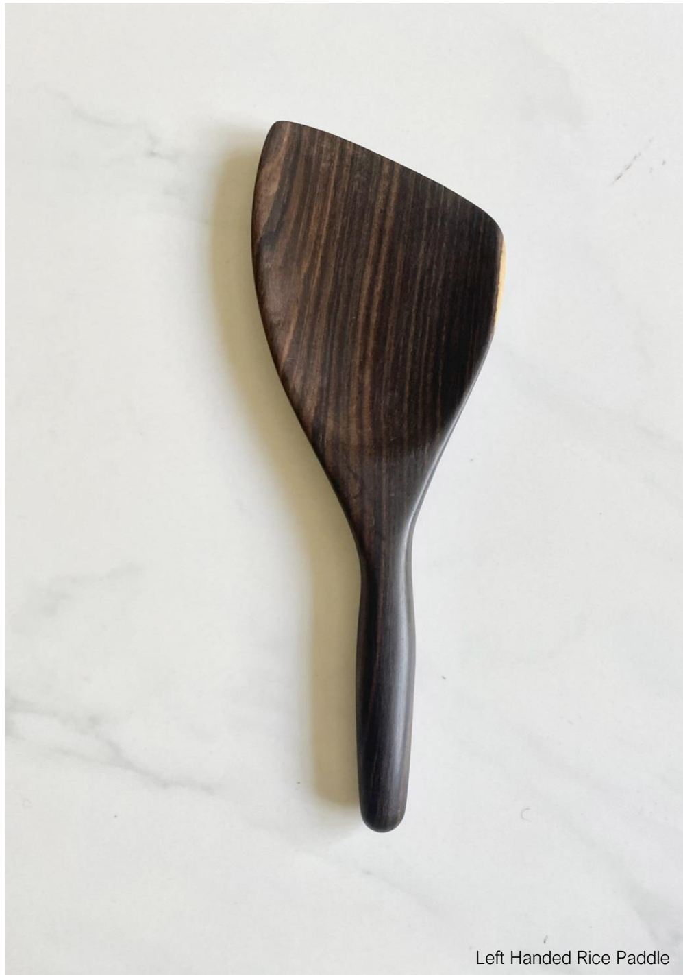
Left Handed Rice Paddle