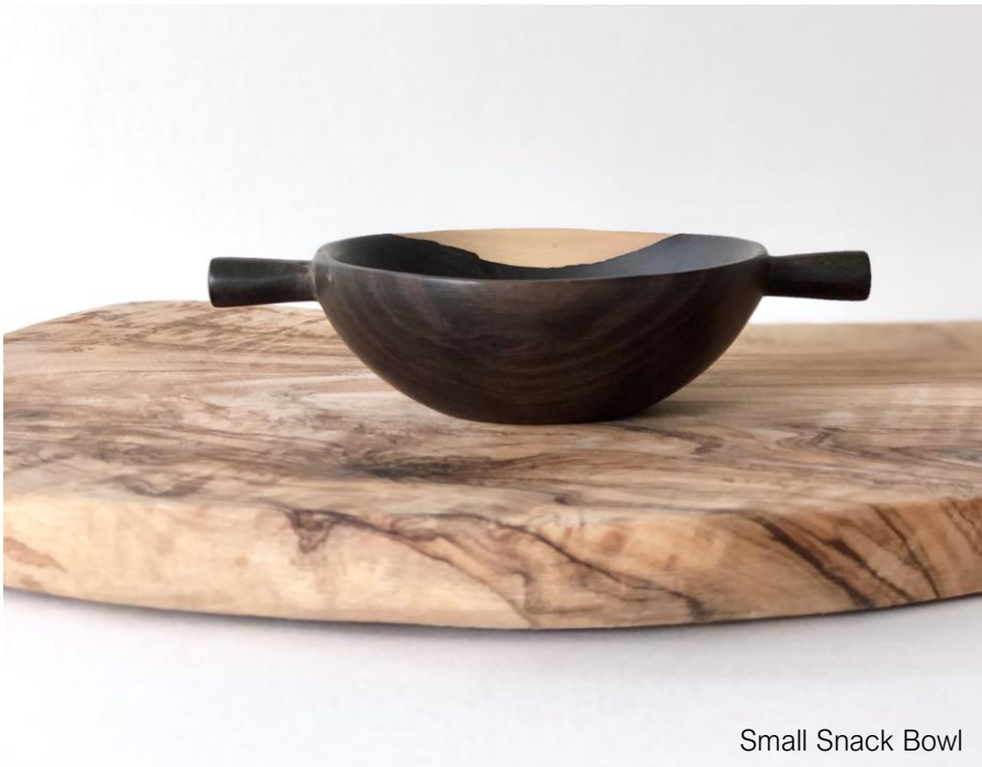
Small Snack Bowl