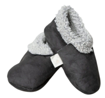
BAA-BOOT-GREY-06 BAA-BOOT-GREY-612 BAA-BOOT-GREY-12-24