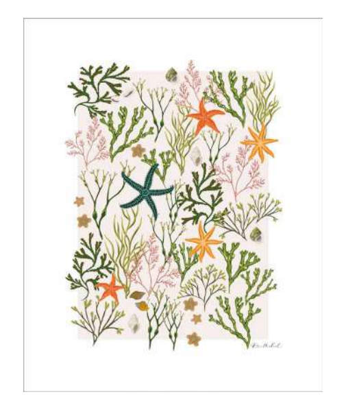
INTERTIDAL FRIENDS Seaweed & Sea Stars SKU: PR-10in-003 RRP £35.00 Wholesale £15.00