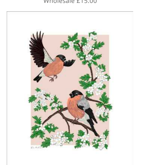
WHISPERS OF FORTUNE Bullfinch & Hawthorn SKU: PR-10in-001 RRP £35.00 Wholesale £15.00