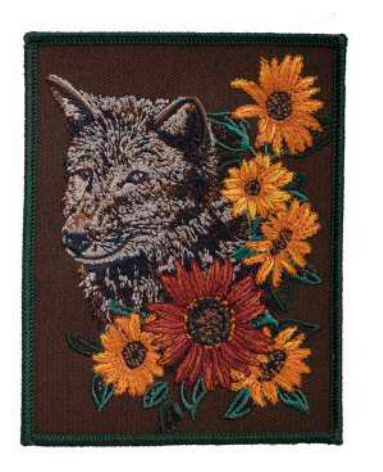
THE KINDRED Wolf & Sunflower SKU: PT-WL-011 RRP £15.00 Wholesale £6.25