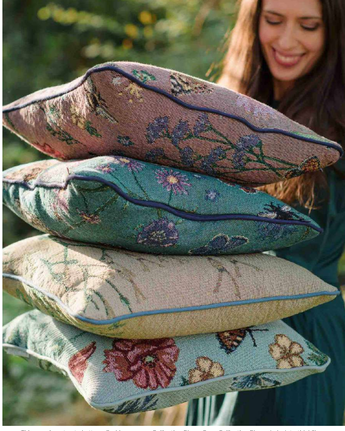
This page from top to bottom: Cushion covers - Pollination Bloom Rose, Pollination Bloom Jade, Intertidal Shore Crab, Pollination Meadow (the latter also shown with the blanket of the same name on the previous spread).

Printed in England with OEKO-TEX and GOTS Certified Ink, and sewn by a seamstress in Hampshire, these cushion covers are also washable at 30°C on a gentle cycle.