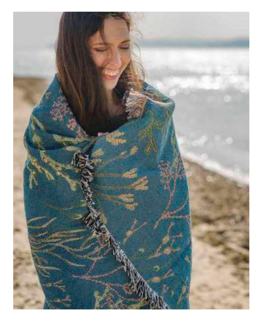
This page, top: Intertidal Wrap blanket; bottom: Intertidal Star blanket. Facing page: Intertidal Sand blanket.

As the tide goes out, the secrets of the ocean can be discovered. The intertidal zone, a place submerged in water at high tide and exposed at low tide, is a unique environment where you'll find a wealth of creatures and plants seeking refuge in rock pools and nestling in the sand: sea stars to seaweeds, sea snails, anemones and crabs. This collection is owed to these beautiful jewels of the coastal change.