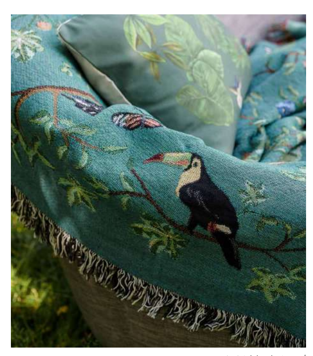
This spread: Forest Flight blanket and Forest Flight Hummingbirds cushion

There's an abundance of things to see in the Belizean rainforest. Look up to find tree species, cedar, cecropia and firebush, housing a party of woodpeckers, hummingbirds, oropendolas, euphonias, trogans and toucans. Let your imagination take flight, see what you can find.