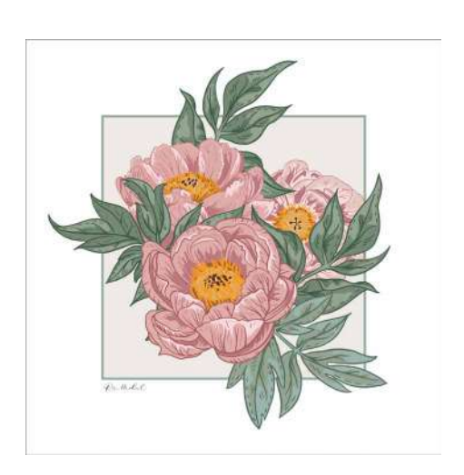
PEONIES SKU: PR-8in-001 RRP £35.00 Wholesale £15.00