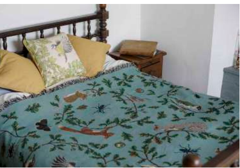
This page, top: Wild Oak Autumn blanket; bottom, left: Wild Oak Wrap blanket; bottom, right: Wild Oak Summer blanket. Facing Page: Wild Oak Duotone blanket & Forager and Patterned cushions.