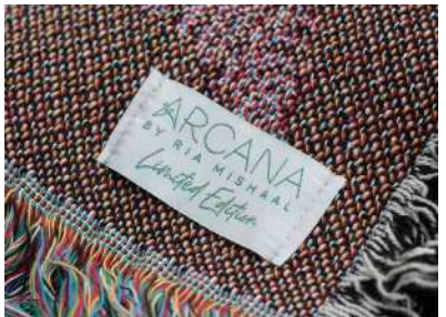
All pictures show the limited edition Spring Botanical blanket.

This blanket is in our largest size, perfect for throwing across a bed or sofa.