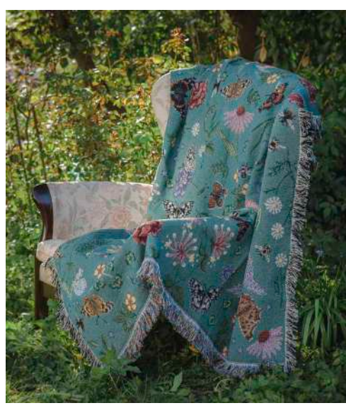
This page, left: Pollination Bloom Wrap blanket; right: Pollination Bloom blanket;