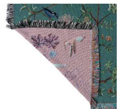
Please note blankets are not shown to scale relative to one another.