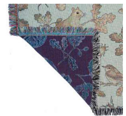
Please note blankets are not shown to scale relative to one another.