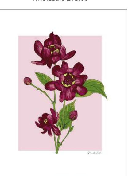
APHRODITE Calycanthus aphrodite SKU: PR-10in-005 RRP £35.00 Wholesale £15.00