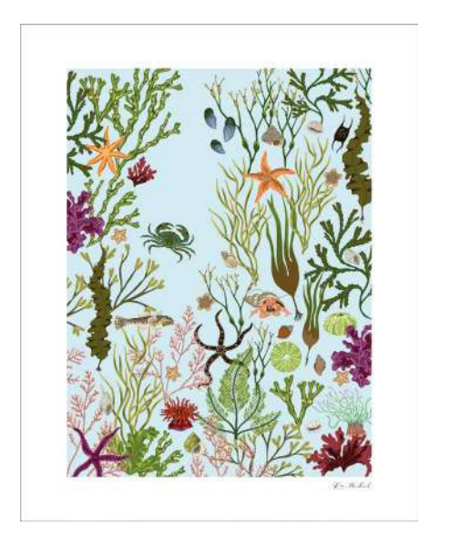
INTERTIDAL STORY The intertidal ecosystem SKU: PR-10in-004 RRP £35.00 Wholesale £15.00