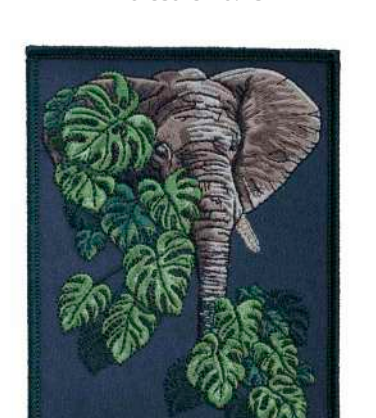
THE LONG LIVED Elephant & Monstera SKU: PT-WL-001 RRP £15.00 Wholesale £6.25