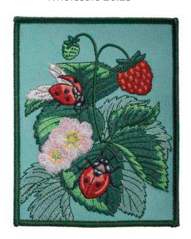
THE LOVED Ladybird & Strawberry SKU: PT-WL-009 RRP £15.00 Wholesale £6.25