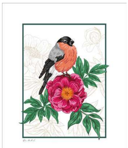
THE FORTUNATE Bullfinch & Peony SKU: PR-10in-002 RRP £35.00 Wholesale £15.00