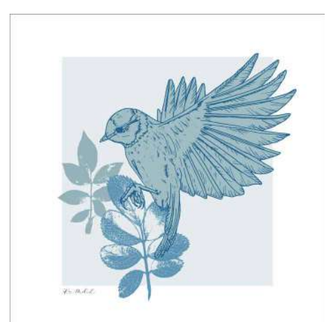
BLUE TIT SKU: PR-8in-002 RRP £35.00 Wholesale £15.00