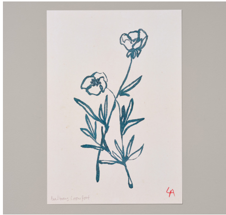
BULBOUS CROWFOOT 2