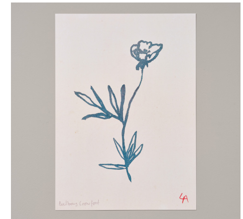
BULBOUS CROWFOOT 1