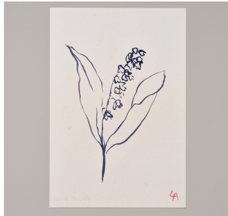
LILY OF THE VALLEY