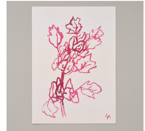
BELLS OF IRELAND