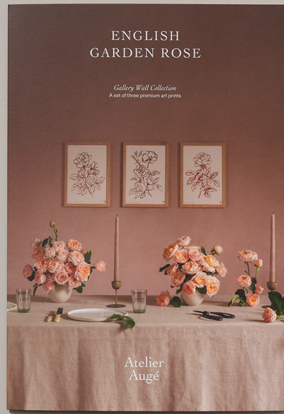
FRONT OF FOLDER