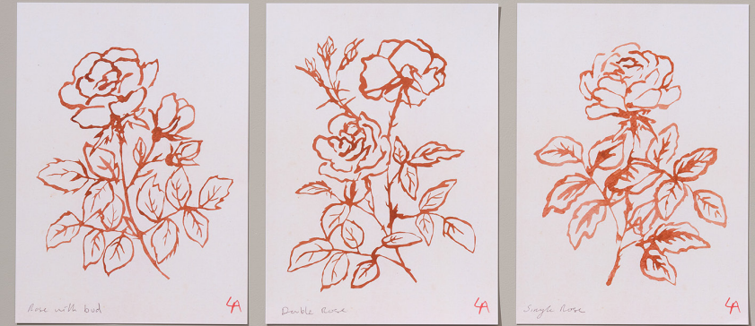
PRINTS INCLUDED IN PACK