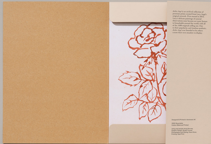
FOLDER WHEN OPEN