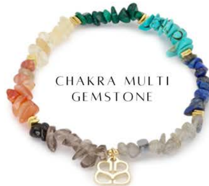
CHAKRA MULTI GEMSTONE