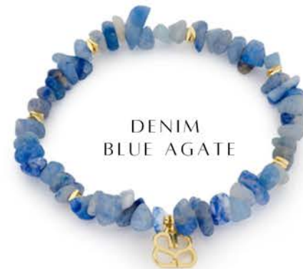
DENIM BLUE AGATE