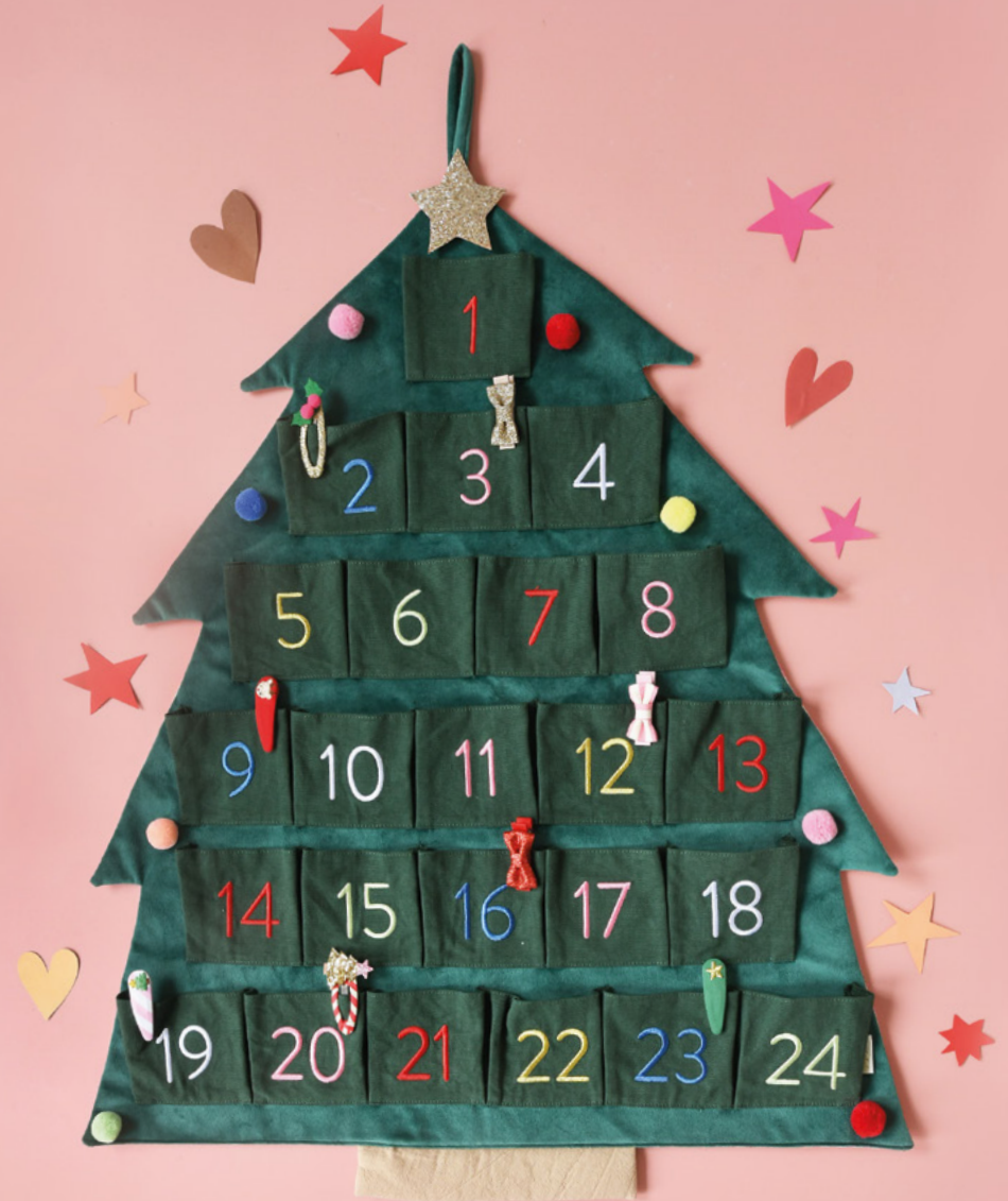
X537 - Christmas Tree Reusable Advent Calendar