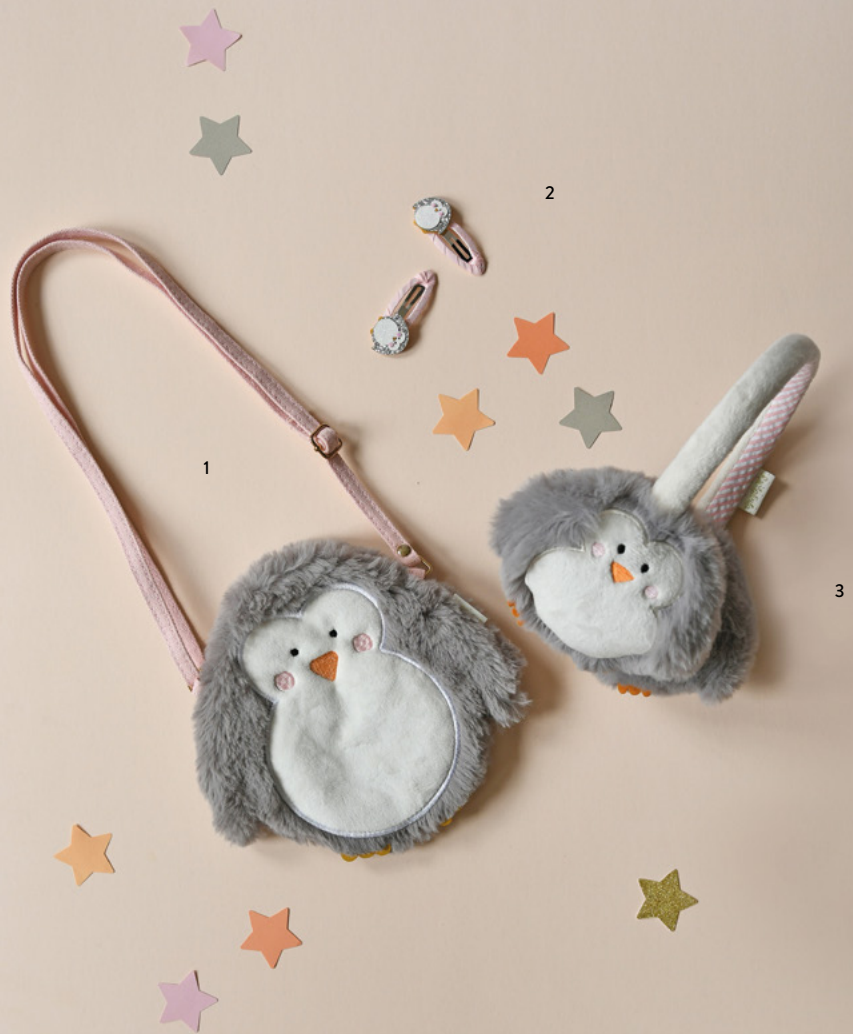
1 - X532 - Little Penguin Bag Pack: 4 units Made using recycled velvet, fur and PU Measures: 18cm x 16cm Adjustable crossbody strap