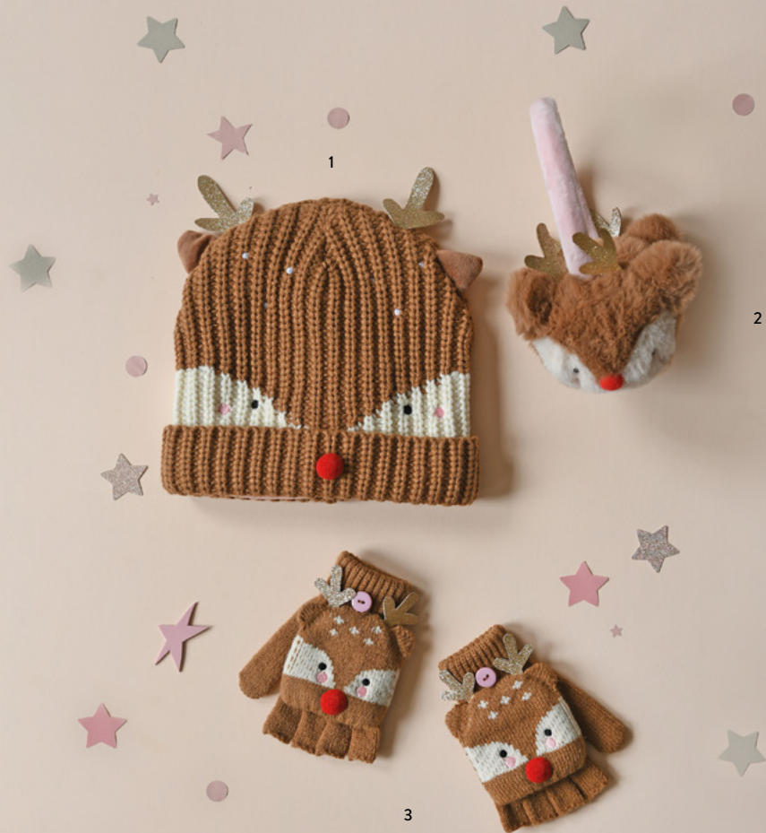
1 - X543-1 (3-6 Years), X543-2 (7-10 Years) Little Reindeer Knitted Hat Pack: 4 units Made using recycled fleece lining