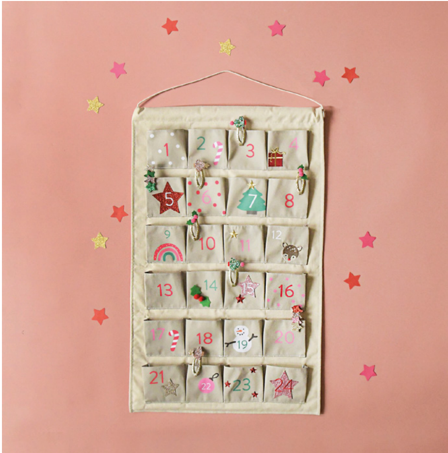
X551 - Jolly Christmas Reusable Advent Calendar

Our gorgeous reusable advent calendars have 24 roomy pockets, ready to fill with sweets, treats, and plenty of Rockahula hair clips! Made from sturdy woven fabric, they roll up into a practical size for storing away until next year.