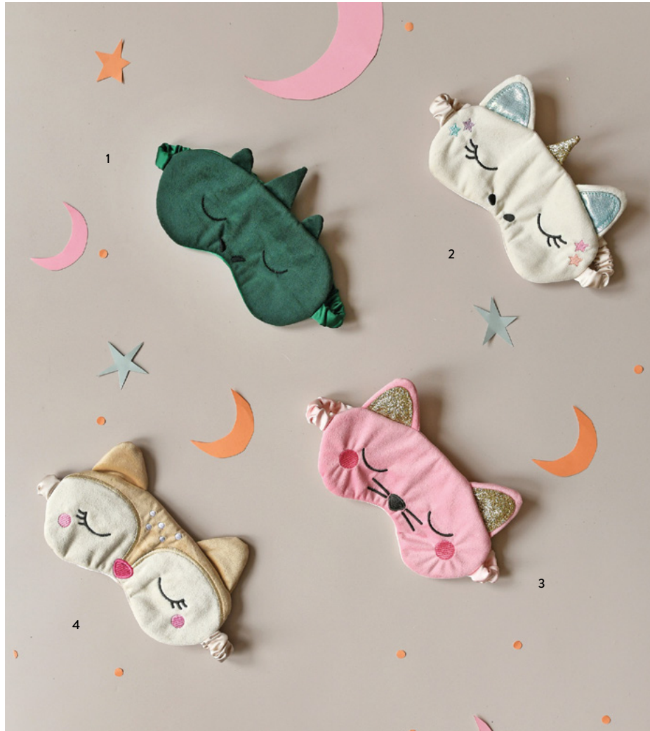
1 - SLP04 - T-Rex Sleep Mask (3-10 Years)