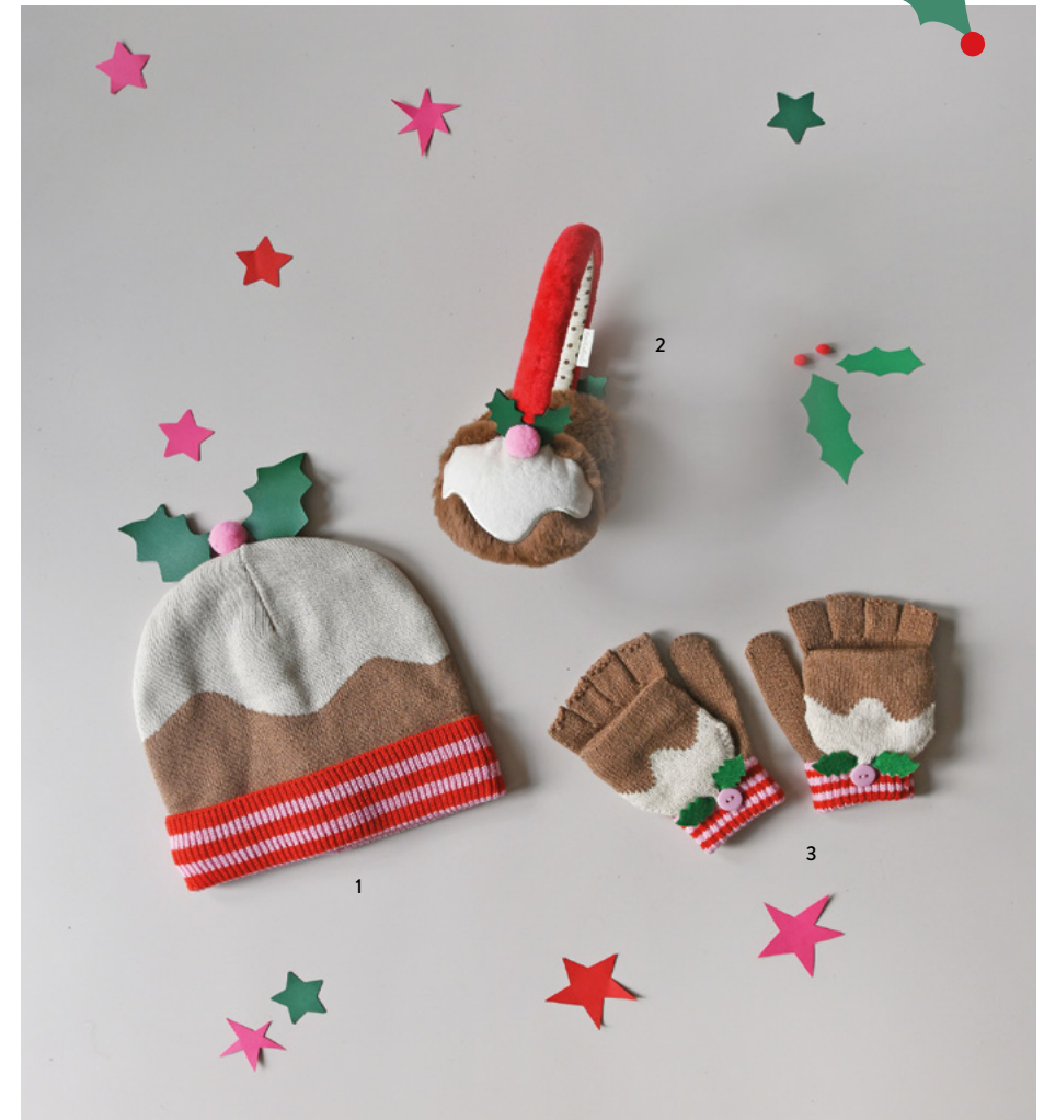
3 - X547-1 (3-6 Years), X547-2 (7-10 Years) Christmas Pudding Knitted Gloves Pack: 4 units Made using recycled fleece lining