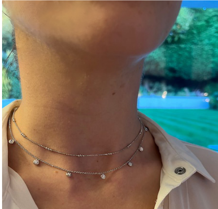
BEADS IN TRIO N525S | £18