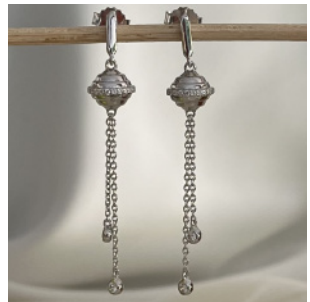
STYLE E595S | £35