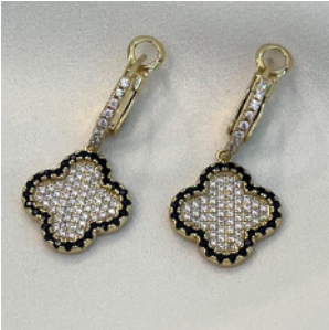
SPARKLING CLOVER E701G | £25