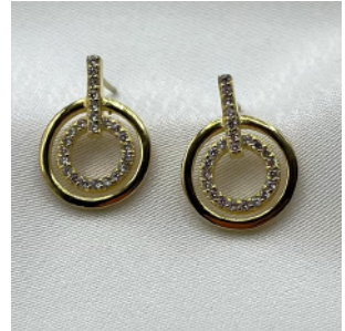
EYE OF THE STORM E585G | £19