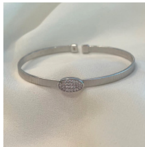
IDENTITY BA503 | £56