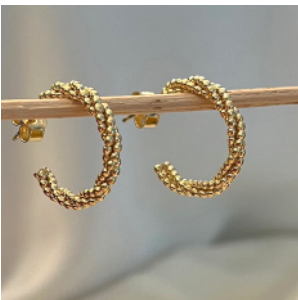
TWISTED CIRCLES E741G | £24