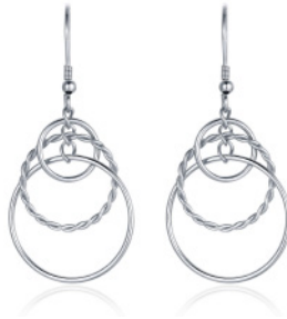
E707S | £17