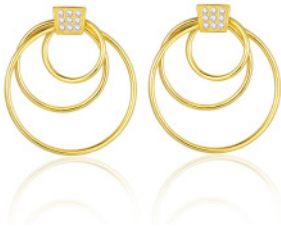
E702G | £21