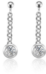
E641S | £17