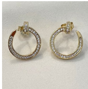
CIRCLE OF SPARKS E704G | £20