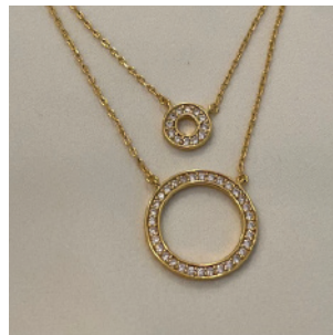
IRRESISTIBLE N552G | £29