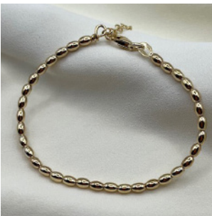
EVERLASTING B535G | £18