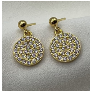
PAVE E719G | £20