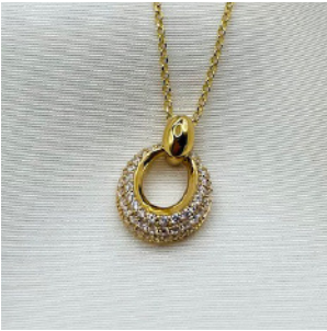
ELEGANCE P595G | £34