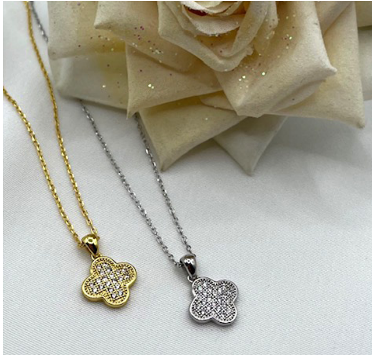
LITTLE CLOVER P630 | £19