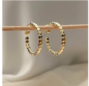
GOLDEN RING OF FIRE E740G | £24