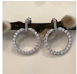
THE SILVER WHEEL E586S | £19