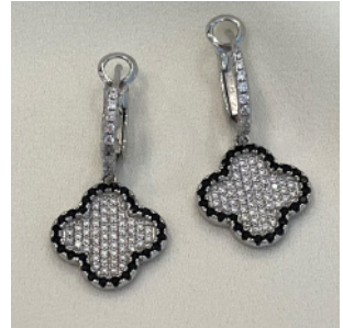
SPARKLING CLOVER E701S | £25