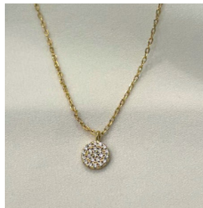
PAVE P626G | £18