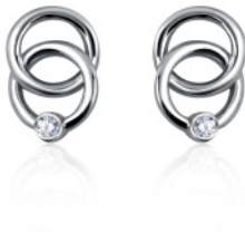
E666S | £20