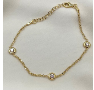
STARRY EYES B540G | £16