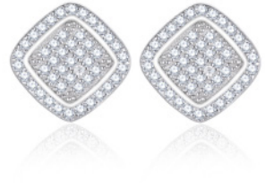
E708S | £18