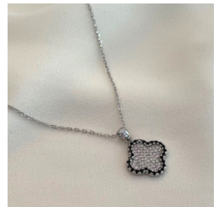
SPARKLING CLOVER P629S | £24