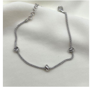
INTERLACEMENT B559S | £18