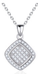
P627S | £21