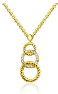
P596G | £24