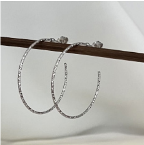
REBEL HOOPS E670S | £16