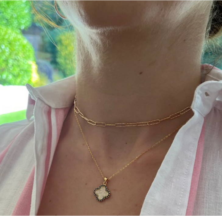
POWER N547G | £24