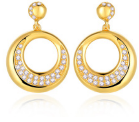
E706G | £22