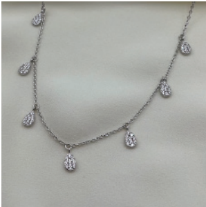
GOLDEN TEAR N527S | £38