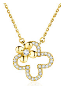
P620G | £22