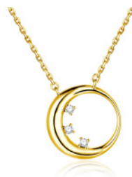
P631G | £20