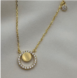
MELTING RINGS N551G | £24