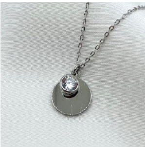
LIGHT REFLECTIONS P623S | £22