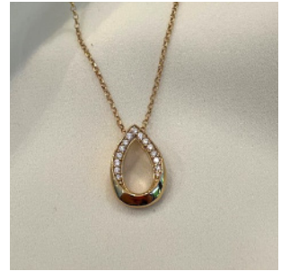
GOLDEN TEAR P597G | £24