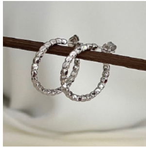
RING OF FIRE E740S | £24