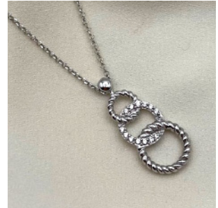
UNITED CIRCLES P596S | £24