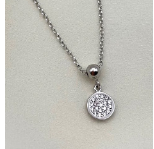
PAVE P608S | £18