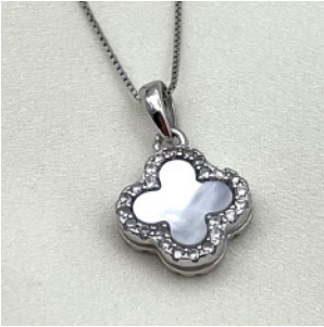
PEARLY CLOVER P634S | £23