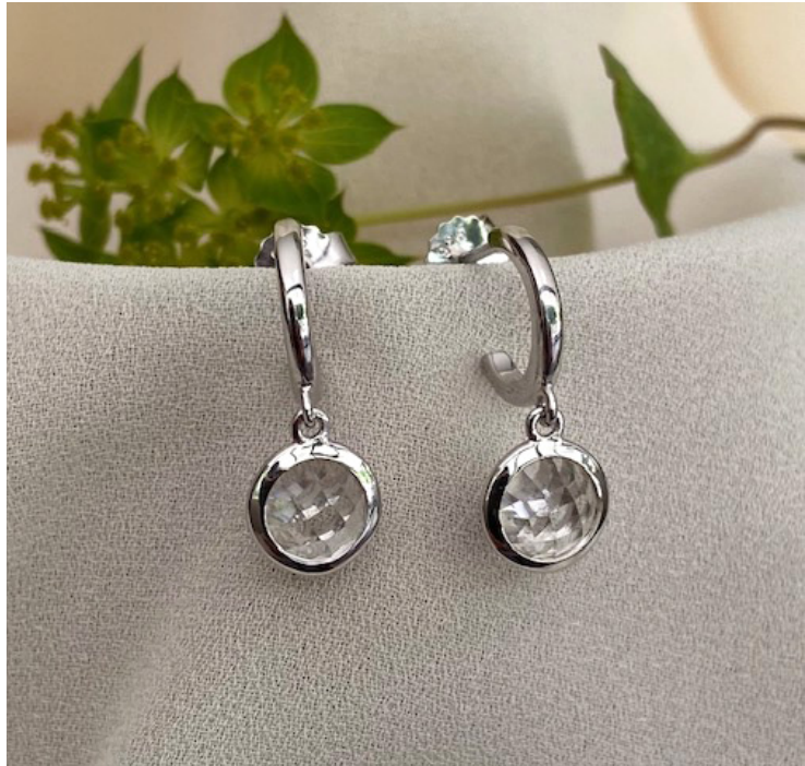
CRYSTAL E608S | £29