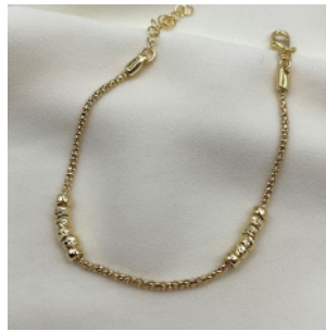
PROTECCION B547G | £18