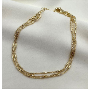
EVERLASTING B558G | £19