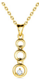
P622G | £18