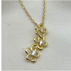
FLOWERS FOREVER P621G | £19