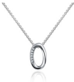
P598S | £24