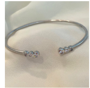
HERITAGE BA504 | £52