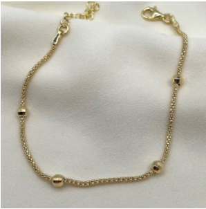
AGELESS B560G | £15