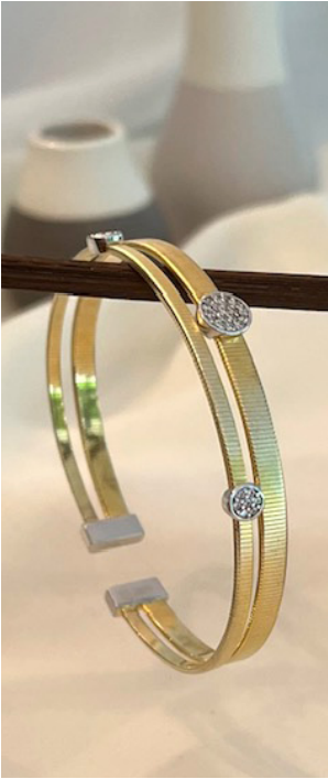
PROSPERITY BA501 | £62