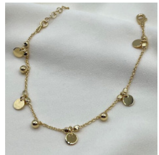
THE WINNING MEDALS B556G | £22