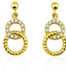
E659G | £24