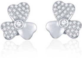
E703S | £18