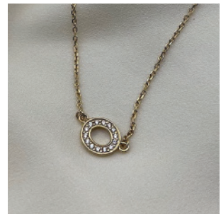
DAINTY LADY N542G | £22