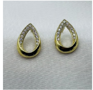
DISTINCTION E657G | £24