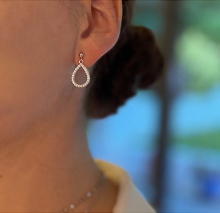
TIMELESS E718S | £20