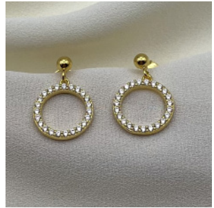
SPARKLING RING E717G | £20