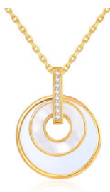
P625G | £24