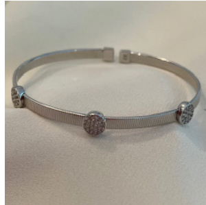
INTEGRITY BA502 | £56