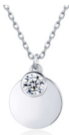
P623S | £22