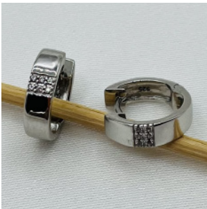
ELEGANCE E536S | £24