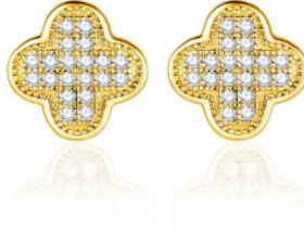
E705G | £18