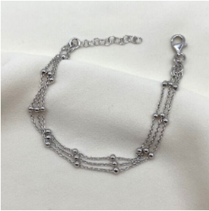
CHEERFUL TRIO B557S | £20