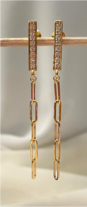
EXCELLENCE E712G | £21