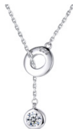
P624S | £21