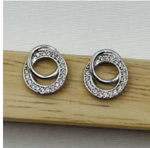
ENTWINNED CIRCLES E528S | £17