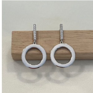
LESS IS MORE E714S | £19