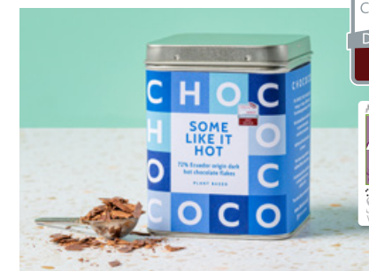
72% ECUADOR SINGLE ESTATE DARK CHOCOLATE FLAKES

naturally vegan-friendly if made with any plant based milk