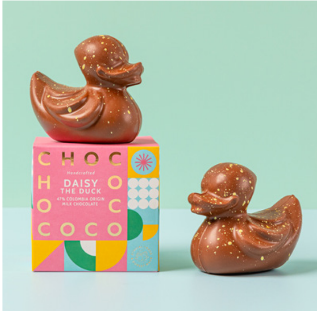
DAISY THE MILK CHOCOLATE DUCK

Meet Daisy, made from our signature 47% Colombia milk chocolate, made exclusively for Chococo. Rich yet surprisingly creamy taste. Speckled with naturally coloured cocoa butter.