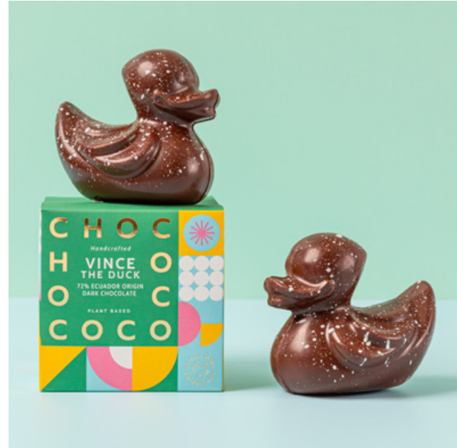
VINCE THE DARK CHOCOLATE DUCK

Meet Daisy, made from our signature 47% Colombia milk chocolate, made exclusively for Chococo. Rich yet surprisingly creamy taste. Speckled with naturally coloured cocoa butter.