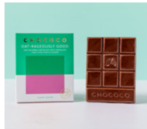
43% COLOMBIA OAT MILK

Oat milk chocolate studded with crunchy banana chips and a hint of cinnamon.