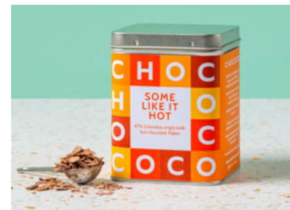
47% COLOMBIA SINGLE ORIGIN MILK CHOCOLATE FLAKES

Colombia origin chocolate. Rich, creamy cocoa.