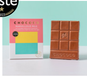
47% COLOMBIA MILK

Rich & creamy cocoa, bright top notes, less sugar.