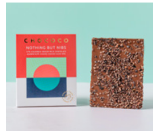
NOTHING BUT NIBS

Colombia origin milk chocolate studded with roasted cocoa nibs.