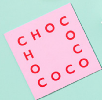
Box of 9 Handcrafted Chocolates