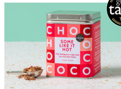
70% MADAGASCAR SINGLE ORIGIN DARK CHOCOLATE FLAKES

Colombia origin chocolate. Rich, creamy cocoa.