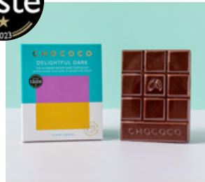
72% ECUADOR DARK

Moreish purple fruit notes, smooth soft finish.