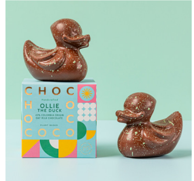
OLLIE THE OAT MILK CHOCOLATE DUCK

Meet Ollie, the Oat Milk Duck! Deliciously rich and creamy, he is a dairy-free delight! Made with 43% Colombian Oat Milk chocolate. Tastes like milk chocolate without the dairy.