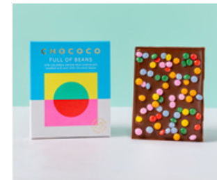
FULL OF BEANS

Colombian origin milk chocolate studded with mini milk chocolate beans.