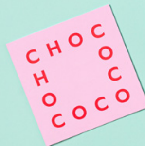
Box of 16 Handcrafted Chocolates