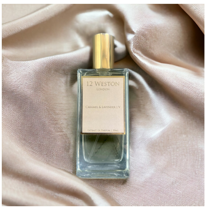
Fragrances Caramel & Lavandin | V - £40

This beautiful unisex Gourmand fragrance is inspired by our proudly British heritage. Linear in smell but leave an exquisite trail. Sticky Toffee Caramel is the main character here, tinged with herbal Lavandin, spiked with praline and a Turkish delight accord all whilst being grounded by Tobacco blossom, English Oak and smoothing Osmanthus.