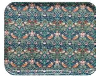
Strawberry Thief Forest