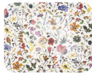
Floral Eve Multi