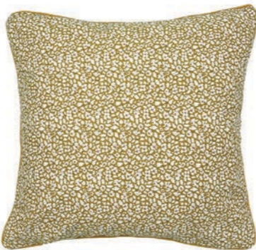
Feather Meadow Gold