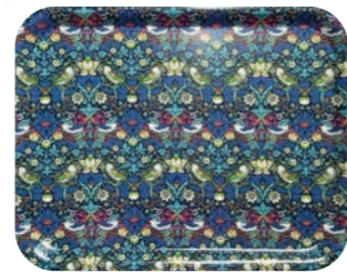
Strawberry Thief Songbird*