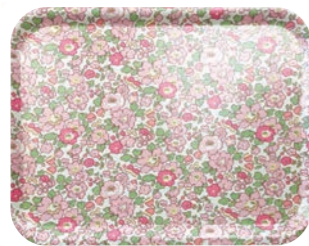
Betsy Apricot Blossom