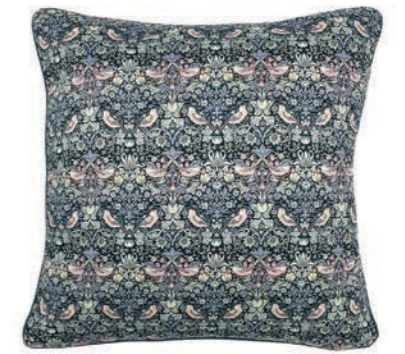
Strawberry Thief Eau De Nil