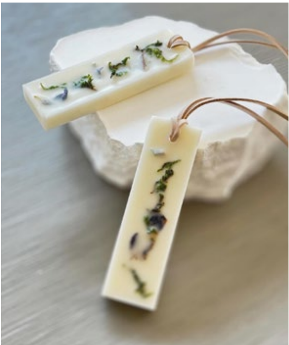
Bar 100mm x 30mm 1.2oz / 36g

Our Perfolet is a solid room freshener made by infusing our signature fragrances into 100% soy wax allowing you to fragrance any space, no matter the size. Simply place the Perfolet in your desired space, and enjoy its subtle scent. Lasts up to 2 years in enclosed spaces, such as closets or drawers.