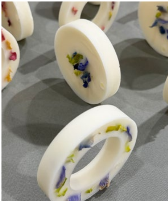
Round & Wreath 7.5mm x 7.5mm 1.2oz / 36g