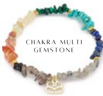
CHAKRA MULTI GEMSTONE