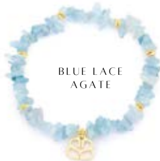
BLUE LACE AGATE