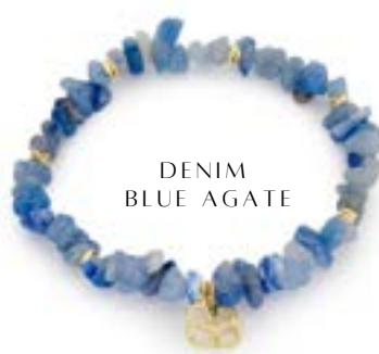
DENIM BLUE AGATE