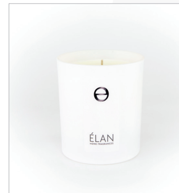
30 CL CANDLE

Flores draws inspiration from rare and exquisite flowers. It evokes a sense of mystery and elegance blending exotic notes of ginger lily, ylang ylang and tagette for an enchanting allure