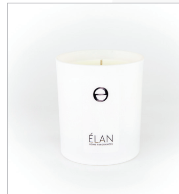
30 CL CANDLE

Escape evokes thoughts of white beaches and clear waters. Fresh, bright bergamot is perfectly balanced with delicate notes of warming coconut, vanilla and almond