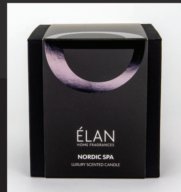
30 CL CANDLE