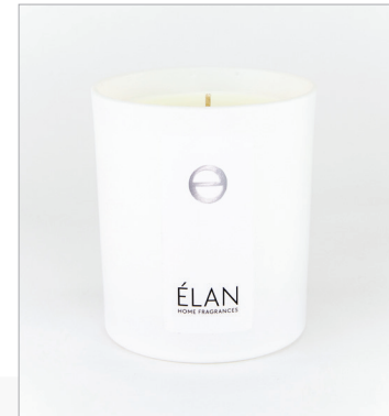
30 CL CANDLE

Christmas Tree captures the essence of this magical season with invigorating notes of pine forest and fresh eucalyptus blended with cedar, guaiaac and sandal woods