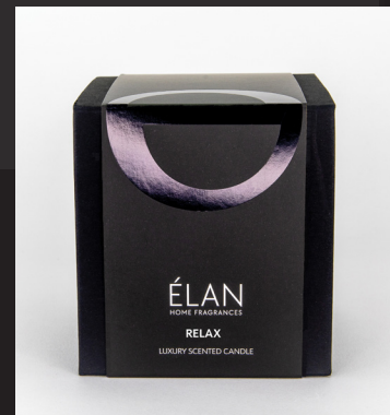
30 CL CANDLE