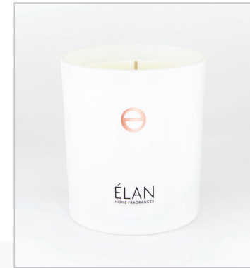
30 CL CANDLE

captures the essence of an exotic, floriantal blend. Warm, romantic notes of saffron, rose, Eastern spices and sandalwood come together to create a sensory experience full of mystery and intrigue