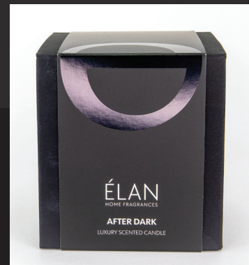
30 CL CANDLE