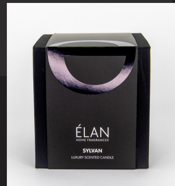
30 CL CANDLE