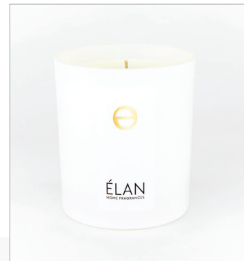
30 CL CANDLE

Frankincense & Myrrh combines exotic floral notes with soothing warm woods and hints of sensuous musk