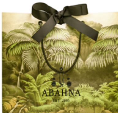
Large Bag ABP051