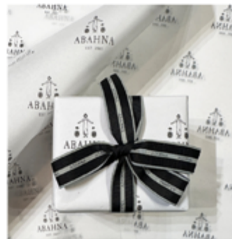
Tissue Paper ABP052