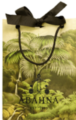
Small Bag ABP050