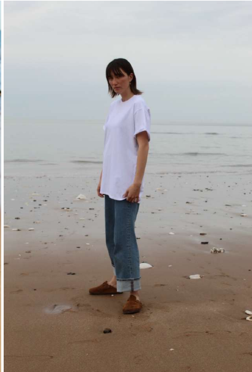
7017.2701.0 Louise T Shirt | White