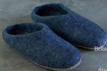
6106.2806.2 Bella Slipper | Charcoal