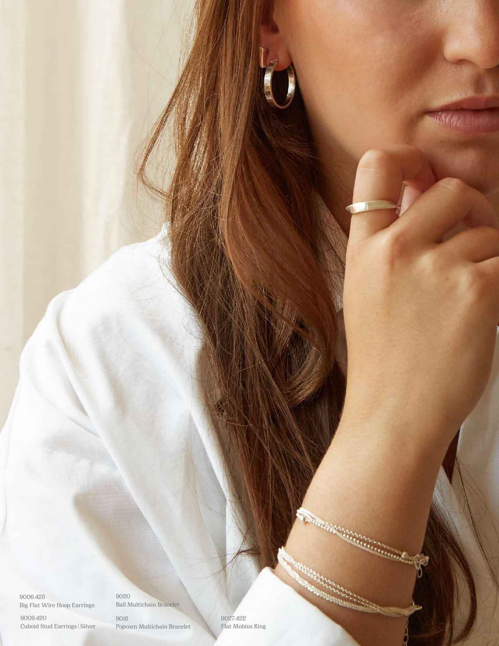
9006.425 Big Flat Wire Hoop Earrings