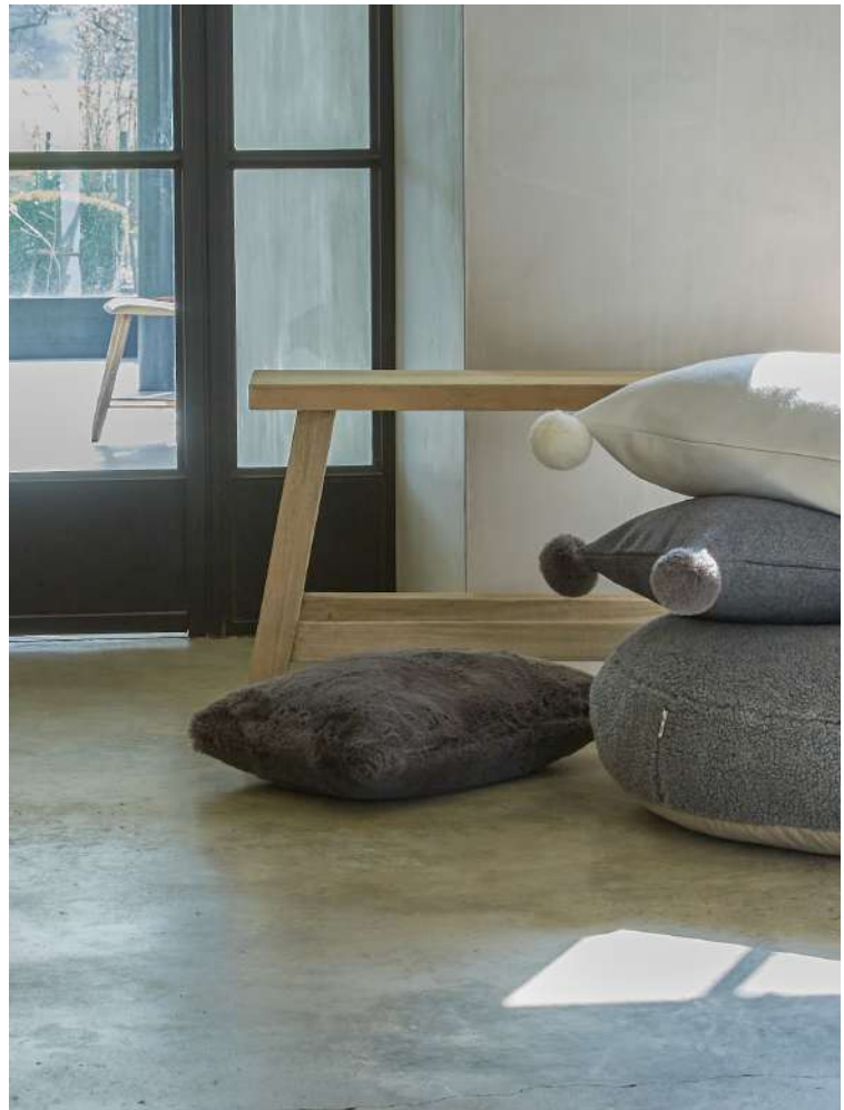
1064.3613 Monkton Recycled Rectangle Rug | Cream

Our homeware range is made up of beautiful, complementary fabrics and textures. Soft sherpa made in Yorkshire, lush velvets, amazing faux furs, 100% cotton waffle and linen-look fabrics means there is something to take you through every season.