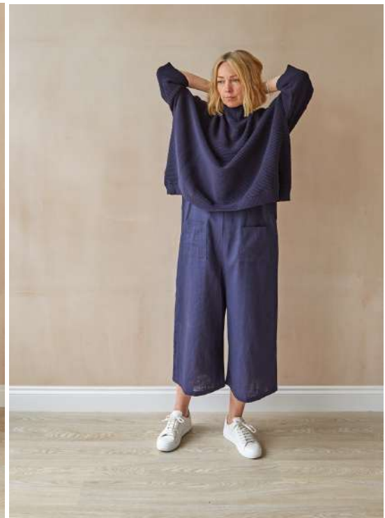
1106.0903.0 Vicki Jumper | Navy