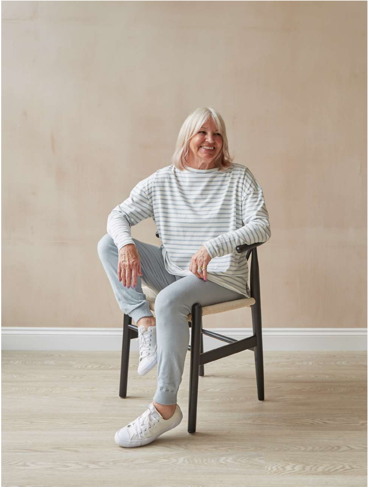
7041.1931 Bryony Stripe Top | Ice Blue