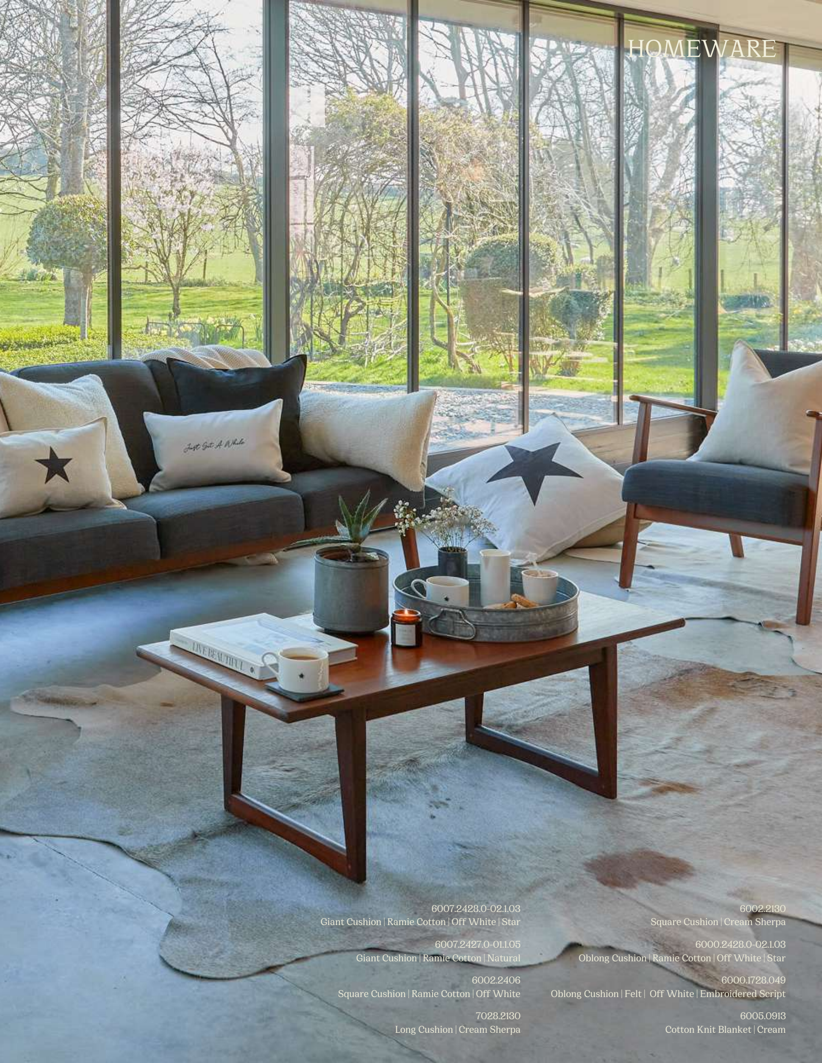
6007.2428.0-02.1.03 Giant Cushion | Ramie Cotton | Off White | Star