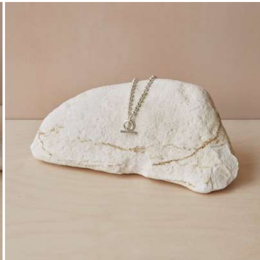
9016 Ball Necklace