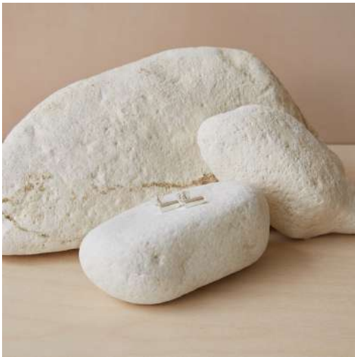
9009.420 Cuboid Stud Earrings | Silver

Each piece is made of sterling silver with some gold plated. With simplicity and style at the forefront the jewellery complements the rest of the CHALK range perfectly.