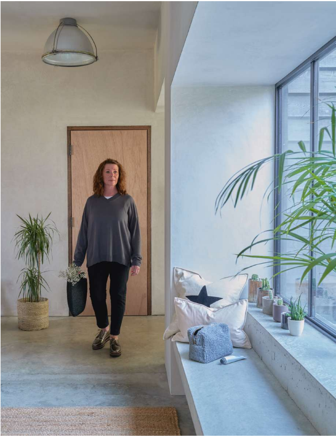
1060.3450.0 Jenny Jumper | Dark Grey