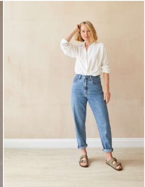
7034.3301 Petra Shirt | White