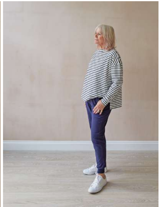
7040.1903 Fleur Stripe T Shirt | Navy