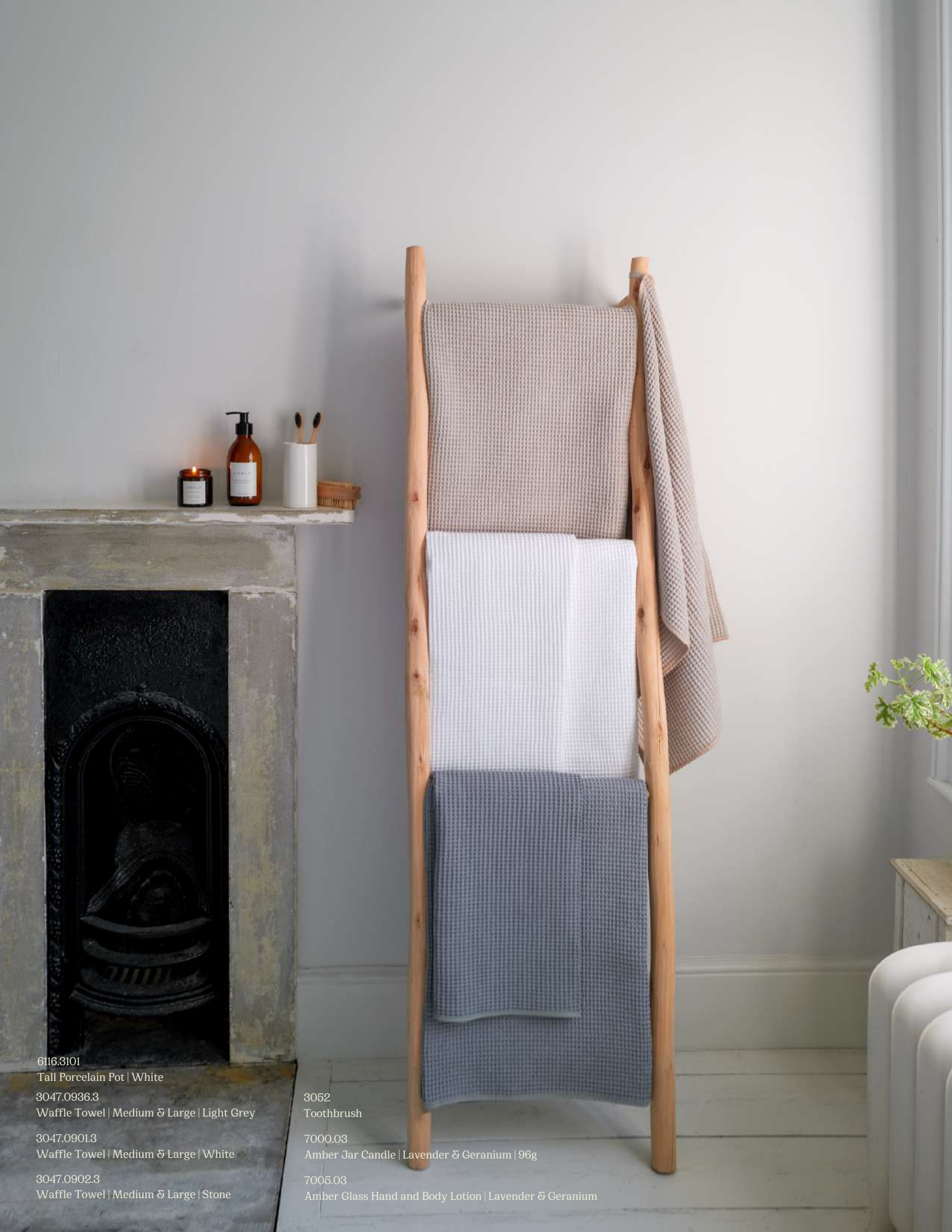
6116.3101 Tall Porcelain Pot | White