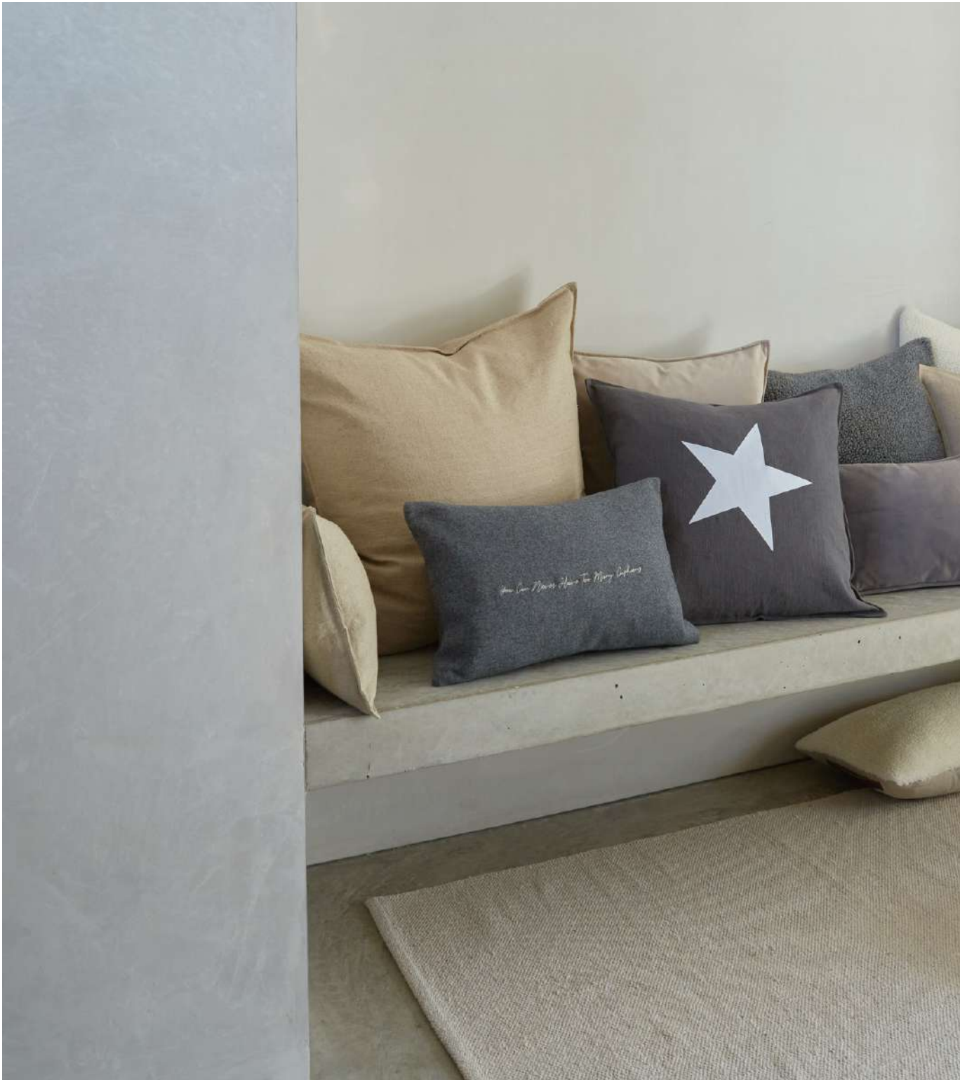
6007.2427 Giant Cushion | Ramie Cotton | Natural