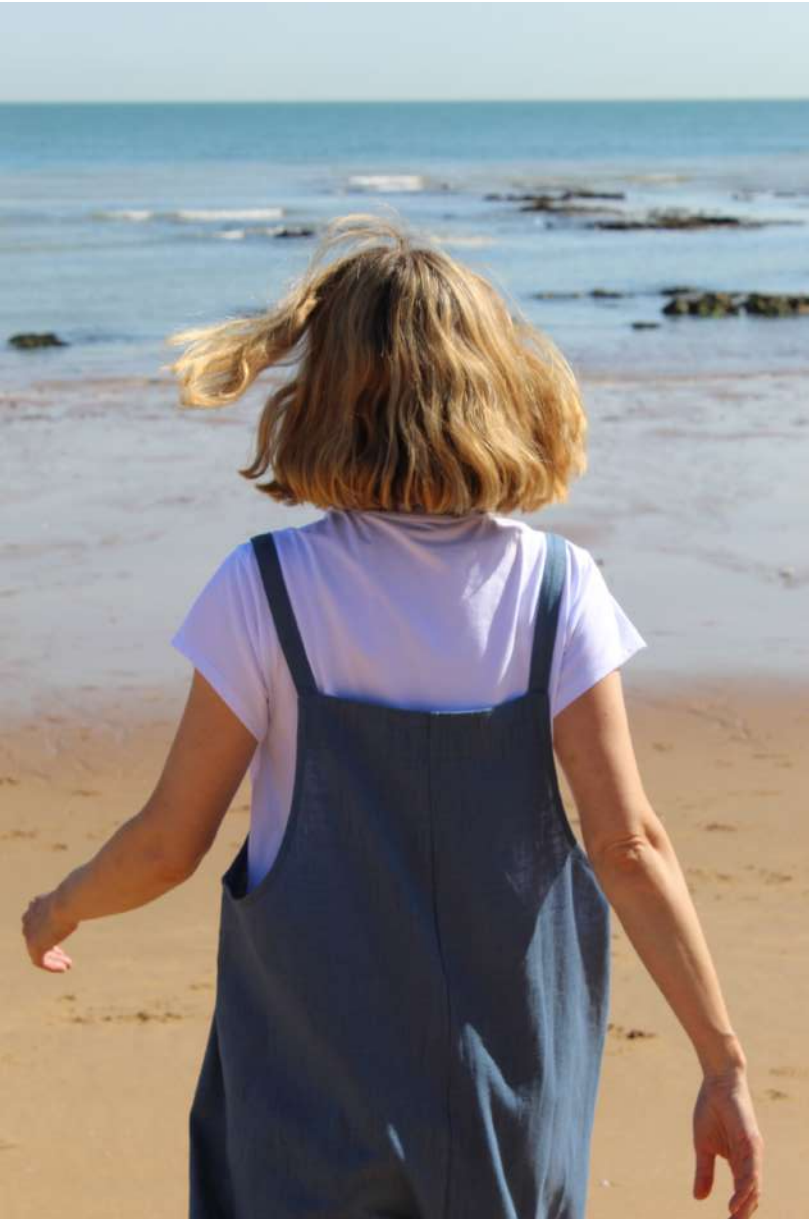
7016.2701.0 May T Shirt | White