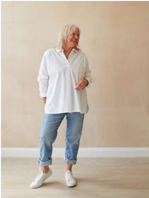
1107.3301 Sophie Shirt | White

Petra is a grandad-style shirt, featuring a delicate shell button. It can be dressed up or down for any occasion.