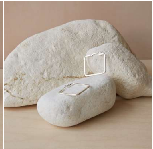
9001.425 Large Square Hoop Earrings | Silver