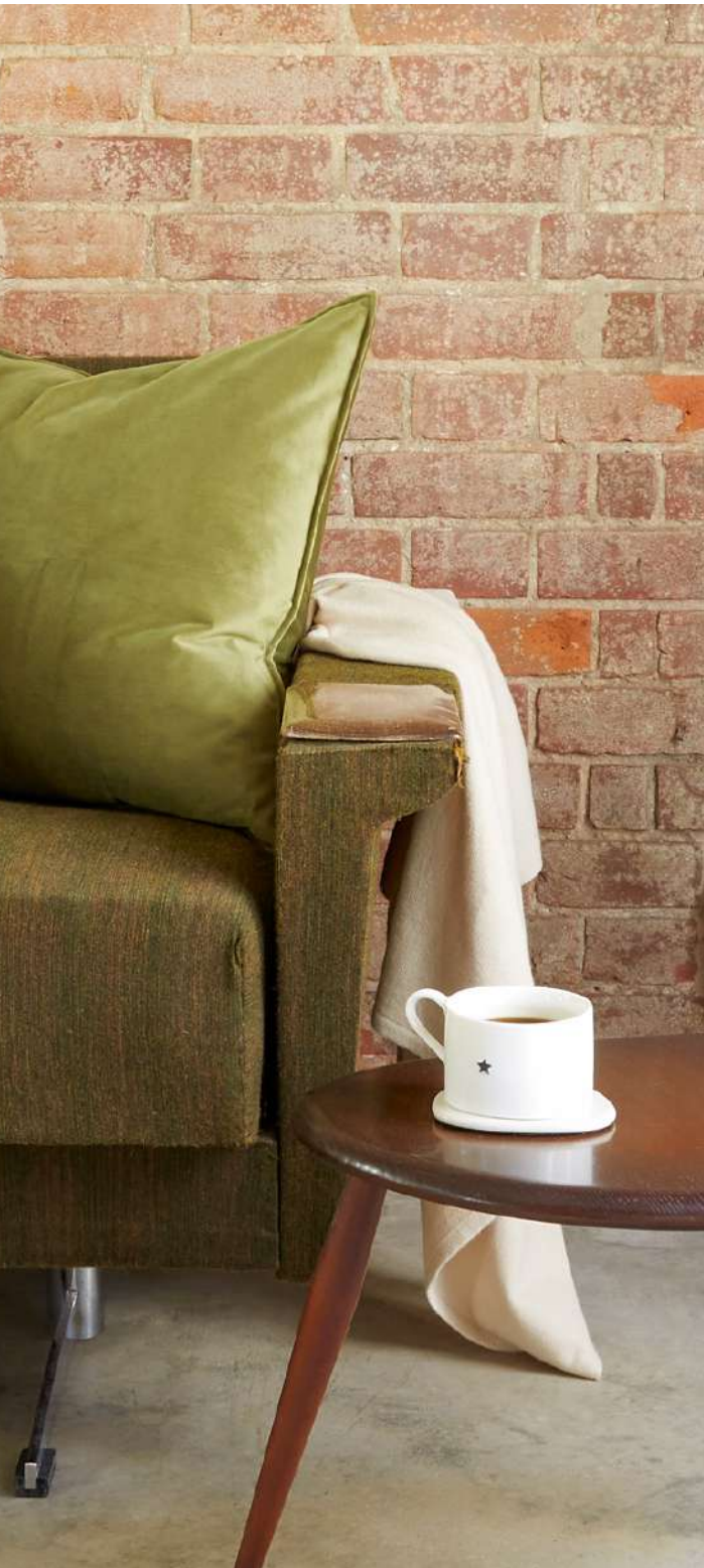
1066 Raffia Basket | Black