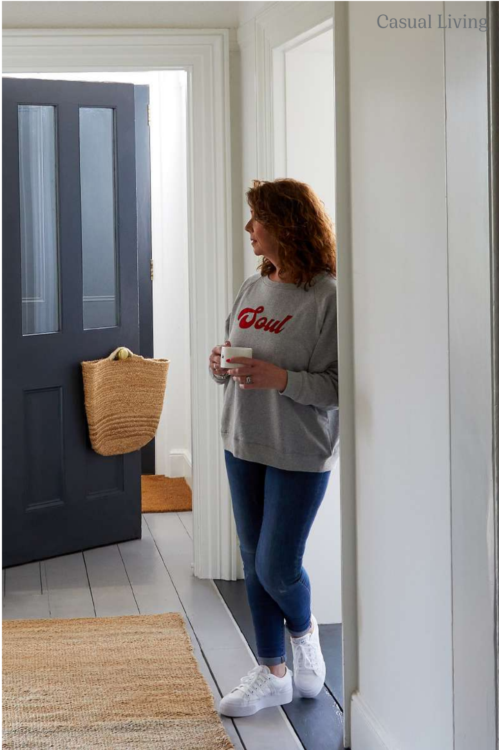
1062.35 Rye Small Rectangle Rug | Natural