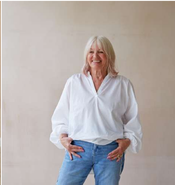
7033.3301 Deb Shirt | White