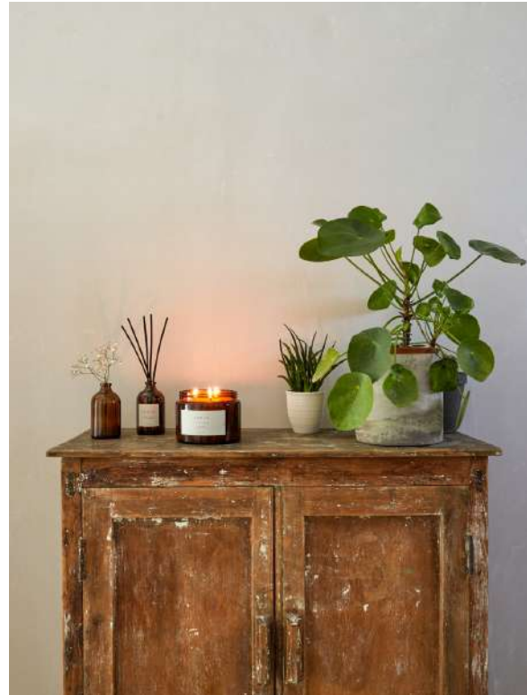
6108.3101 Porcelain Pot | White