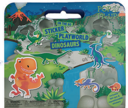
6851 Dinosaur Sticker Set

On-The - Go Magnetic Sets: Fold out magnetic playworlds, for hours of story making on-the-go or at home.