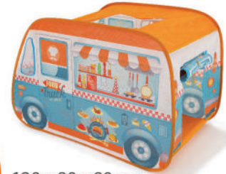
120 x 80 x 80 cm