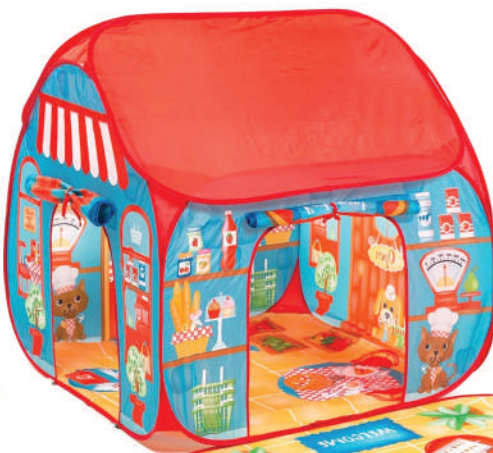
Tent: 90 x 90 x 90 cm Playmat: 100 x 100 cm