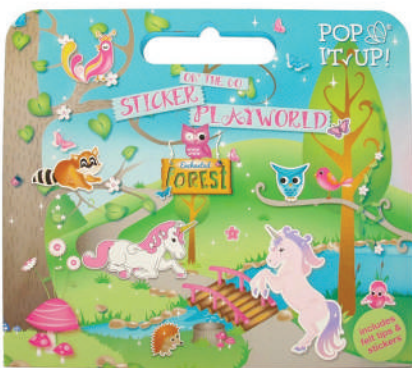
6811 Enchanted Sticker Set

4 Playscenes, 4 sheets of stickers (2 to colour), 10 markers (Dimensions 21cm x 14cm x 4cm)