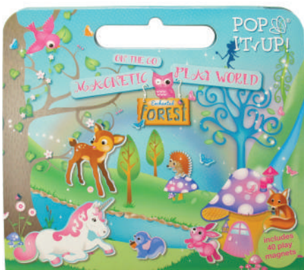
6810 Enchanted Magnetics

1 Large Fold Out Playscene (3x4A), 30 Magnetic Play Pieces, Suitable for 3+