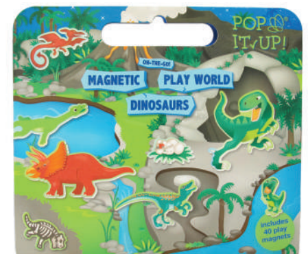
6850 Dinosaur Magnetics