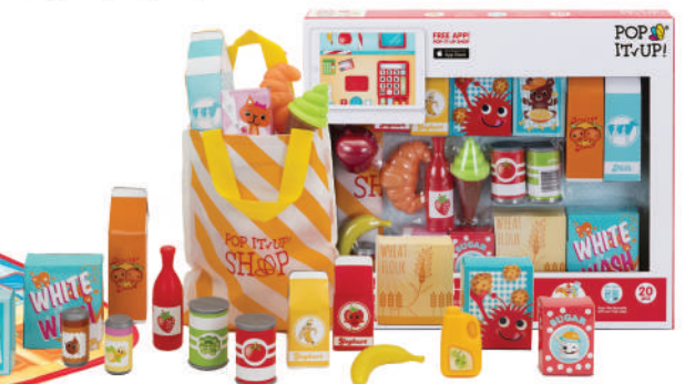
201 Scan & Play Accessories