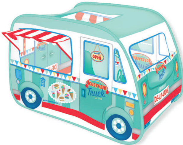
204 Ice Cream Truck