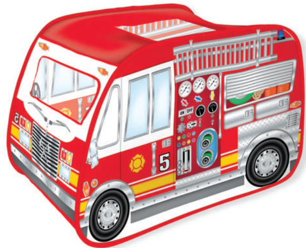
778 Fire Truck