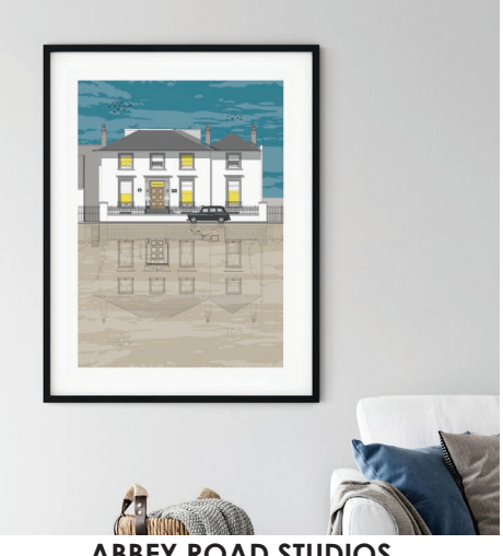
ABBEY ROAD STUDIOS