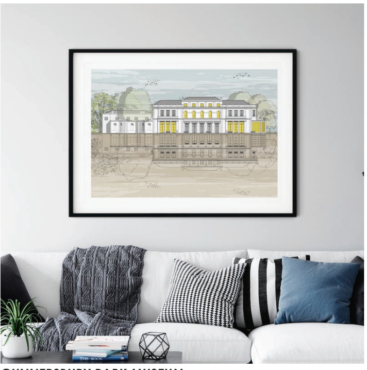
GUNNERSBURY PARK MUSEUM