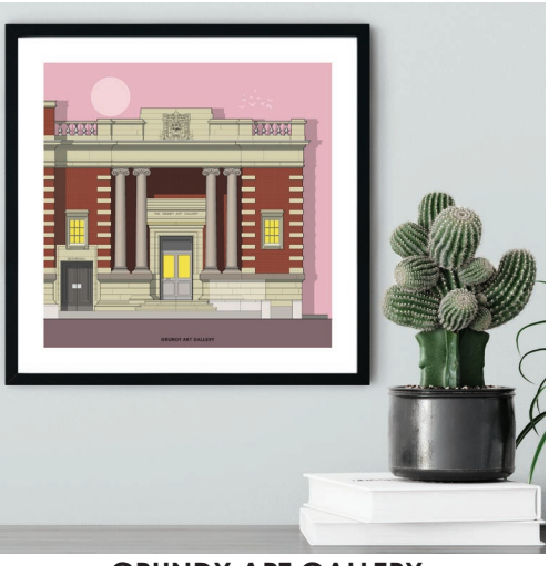
GRUNDY ART GALLERY