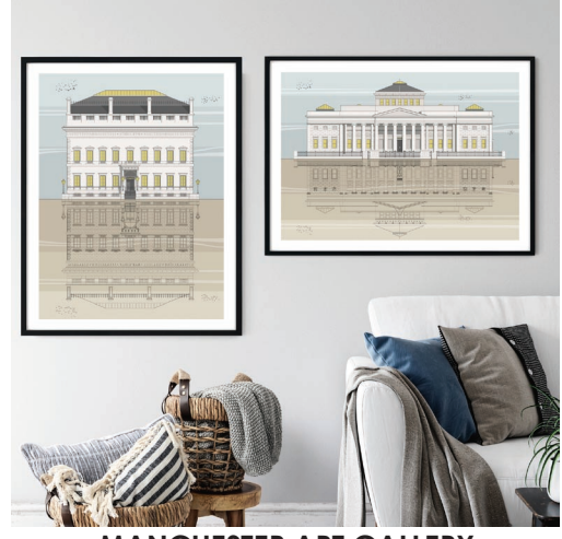
MANCHESTER ART GALLERY