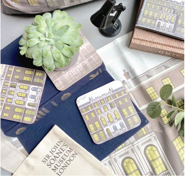
SIR JOHN SOANE'S MUSEUM