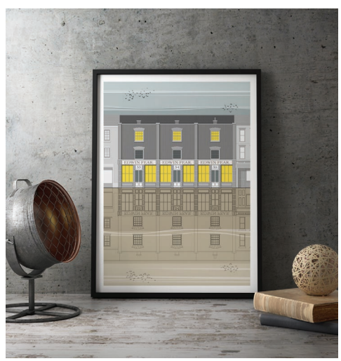
FEARS WATCHES SHOP