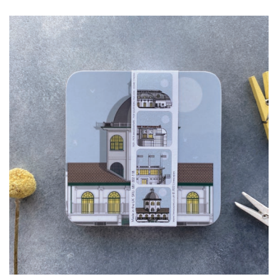
SUN COLLECTION COASTER SETS

Satin finish melamine coasters, cork back Set of 4 assorted: 98x98x16mm. Presented with belly band Set of 6 assorted: 98x98x24mm. Presented with belly band