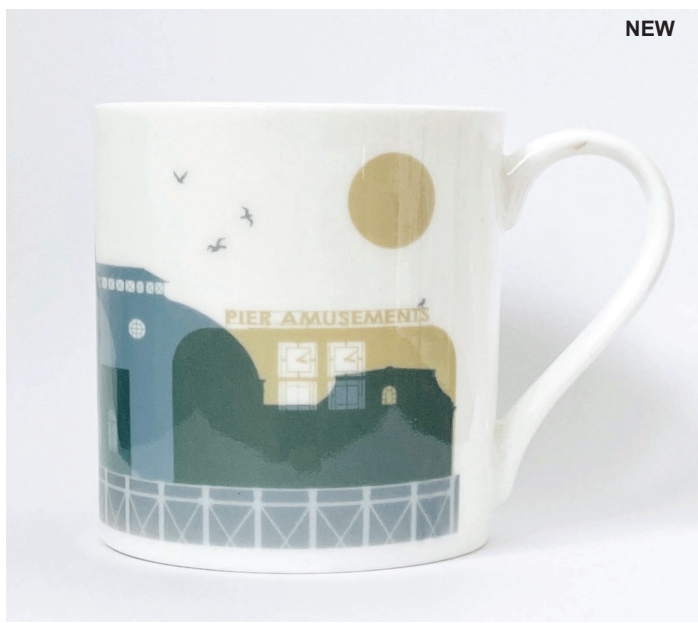
Worthing Landmarks Bone China Mug Worthing Landmarks Bone China Mug