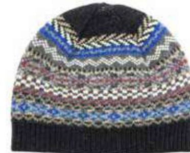
HAT-714 BLUE MIX