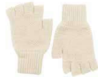
GLOVE122 AIRDALE LADIES