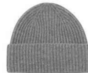
CAHAT01-G GREY MELANGE