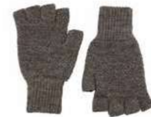
GLOVE123 DENTDALE LADIES