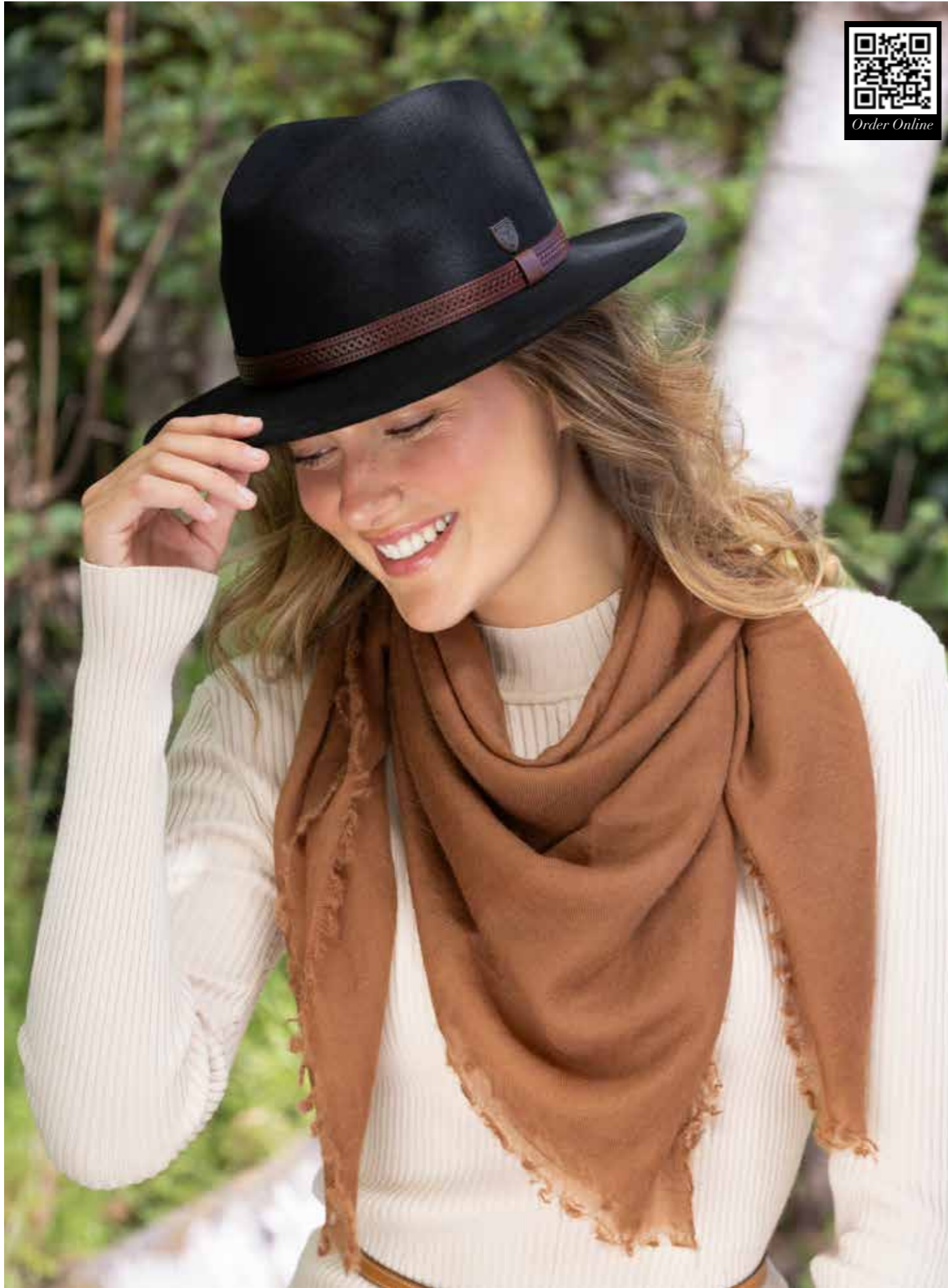
MODEL WEARS RUST FEATHER FRINGE CASHMERE SCARF CASCAR03-R.