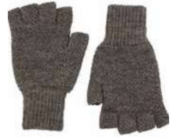
GLOVE101 DENTDALE MENS