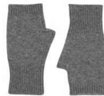
CAHAND01-G GREY MELANGE