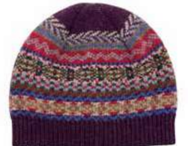
HAT-715 OXBLOOD MIX