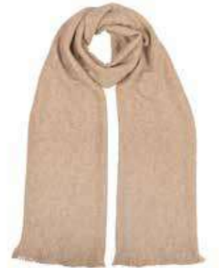
CIG66 PLAIN OATMEAL