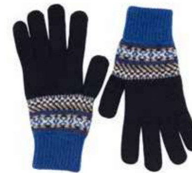
GLOVE103 BLUE MIX