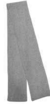
CASCAR01-G GREY MELANGE