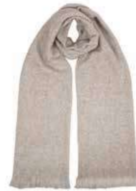
CIG64 PLAIN SILVER

Made from 100% Merino Wool. This Premium Collection is crafted in Mongolia using the finest Merino. The luxurious yarn creates the softest lightweight accessories which are naturally breathable and sustainable. Measures 48 x 200cm