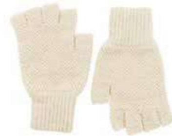
GLOVE99 AIRDALE MENS

Made from 100% Lambswool. This Premium Collection is crafted in Scotland using the finest fibres. The luxurious yarn creates a durable accessory which is naturally soft and warm.