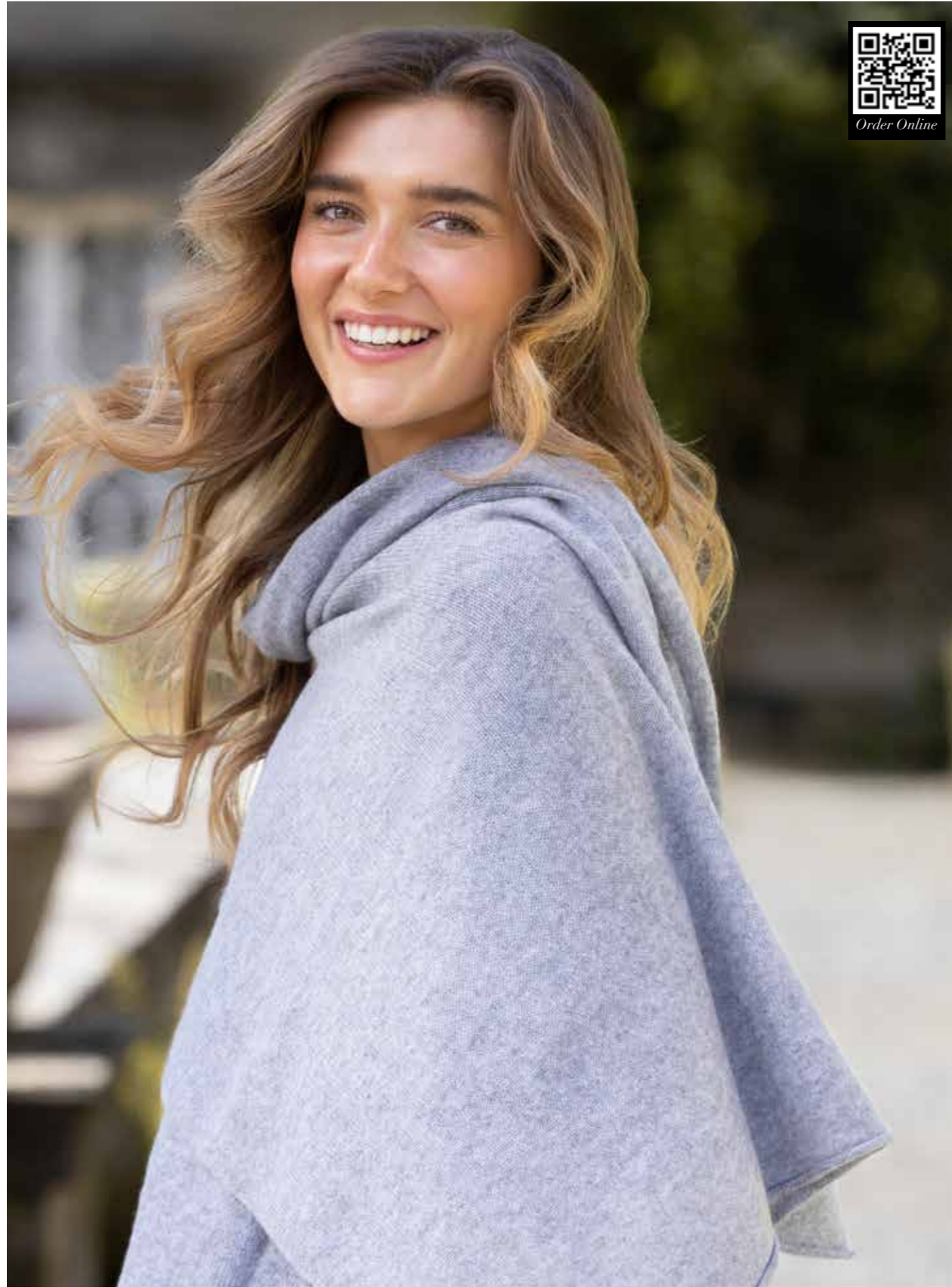
MODEL WEARS SILVER CASHMERE BLANKET SCARF CASCAR02-G.