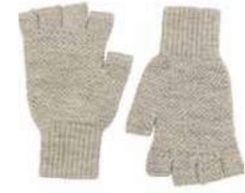
GLOVE100 BISHOPDALE MENS