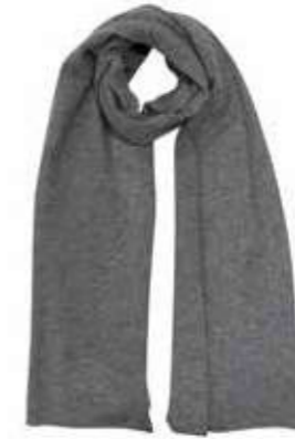
CASCAR02-G GREY MELANGE