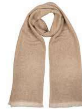
CIG65 PLAIN PEBBLE