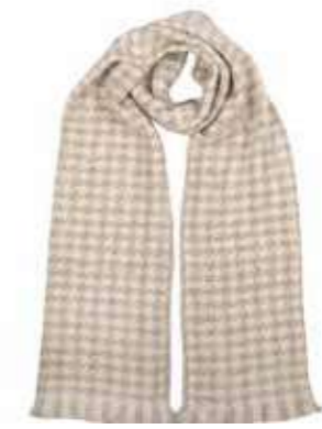
CIG68 SILVER DOGTOOTH