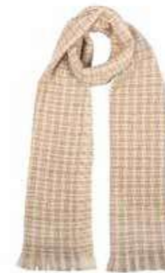
CIG67 OATMEAL CHECK