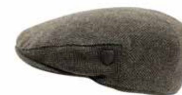
HAT-724 Brown Herringbone 100% Wool