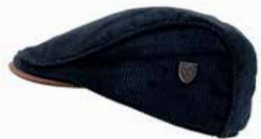
HAT-799 Black 100% Cotton