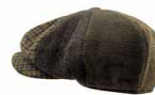
HAT-899 Olive Mix 100% Wool