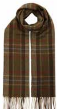
CASCAR08 Olive 100% Cashmere