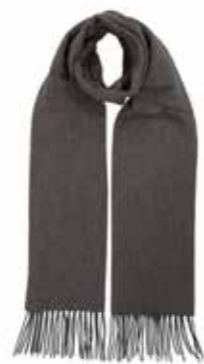
CASCAR05 Silver 100% Cashmere