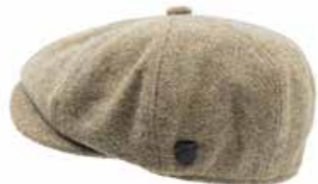
HAT-730 Olive 60% Wool / 40% Polyester