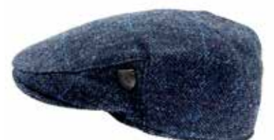
HAT-798 Blue Box Check 50% Wool / 50% Polyester