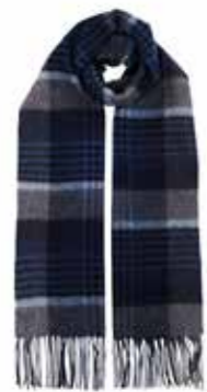
CASCAR07 Blue 100% Cashmere