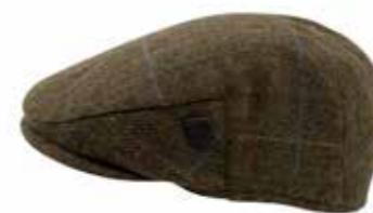
HAT-731 Brown Box Check 100% Wool