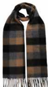
CASCAR09 Charcoal 100% Cashmere