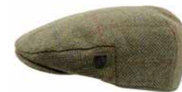
HAT-732 Kiwi Box Check 60% Wool / 40% Polyester