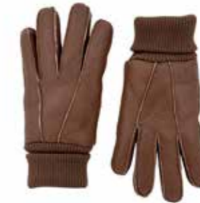
GLOVE138 Brown 100% Leather