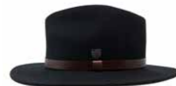
HAT-733 Black 100% Wool