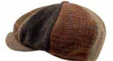
HAT-900 Brown Mix 100% Wool