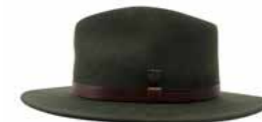
HAT-734 Green 100% Wool