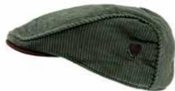
HAT-800 Olive Green 100% Cotton