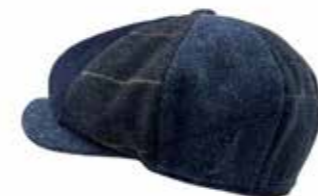
HAT-898 Blue Mix 100% Wool