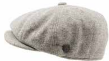
HAT-729 Silver 60% Wool / 40% Polyester