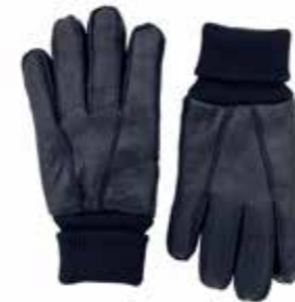
GLOVE137 Black 100% Leather