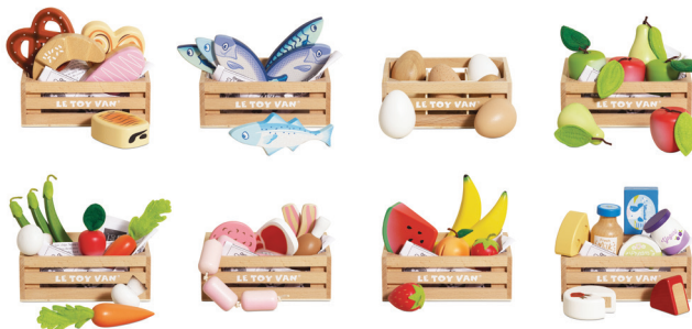
TV188 Complete Set of Market Crates