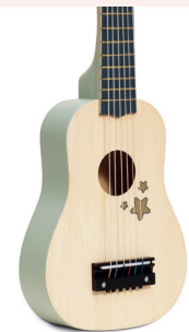
TV5003 Guitar Play Instrument