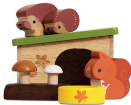
ME046 Hedgehog Animal Set