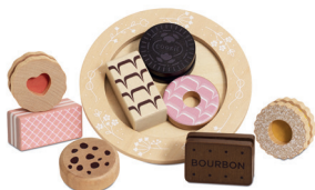
TV298 Biscuit & Cookie Set