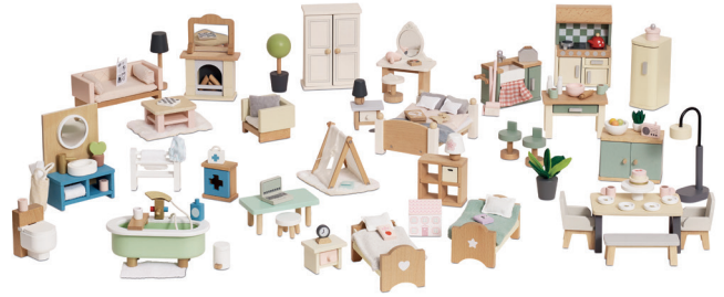
ME100 Deluxe Dolls House Furniture Set