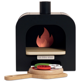
TV3007 Wooden Pizza Oven