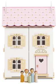
H124 Roseheart, Furniture & Family