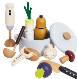
TV3006 Soup & Utensil Set