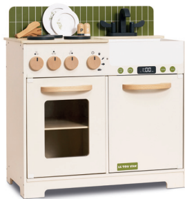
TV3009 Olive Play Kitchen