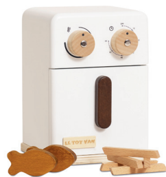
TV3005 Air Fryer & Playfood