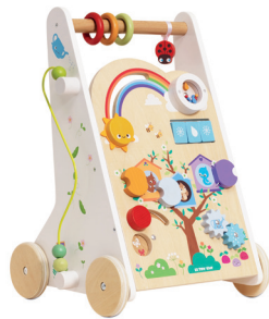
PL112 Woodland Activity Walker