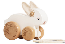
PL146 Pull Along Hopping Bunny