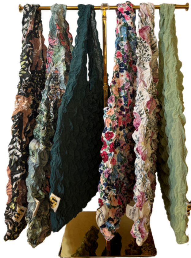
MULTI-BAG BRASS STAND