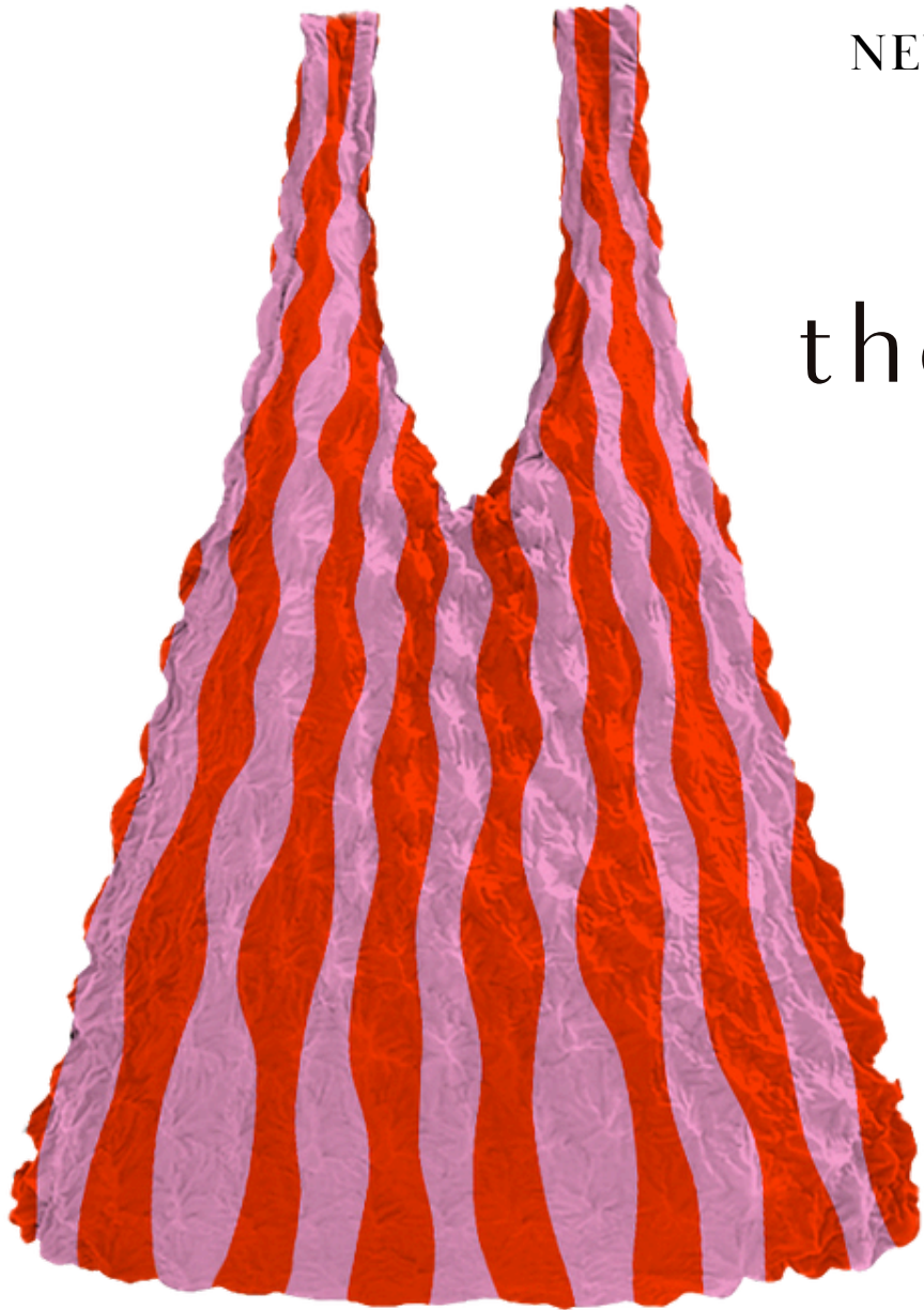
Matisse Does Pink