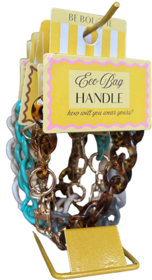
GOLD HANDLE STAND