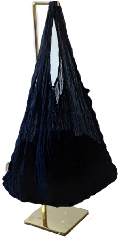
SINGLE BRASS STAND