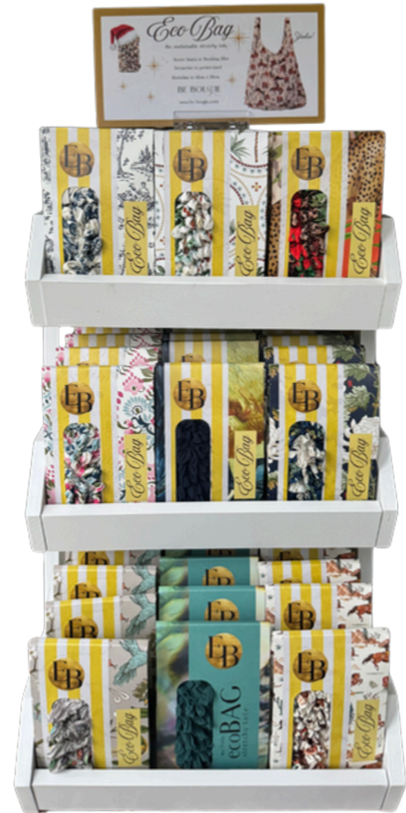
THREE TIER BAMBOO STAND