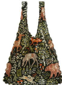
DEER & BEAR