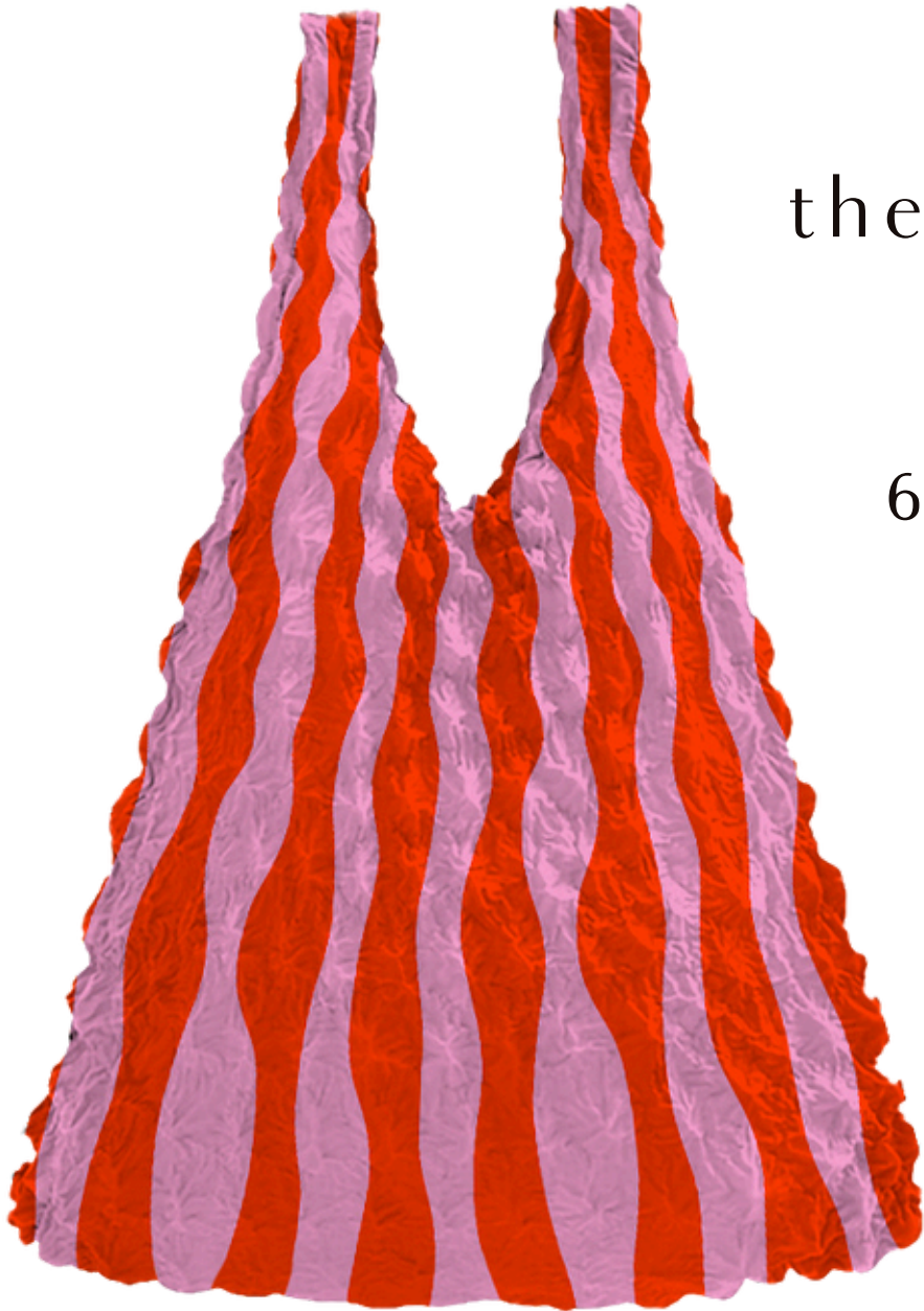
Matisse Does Pink