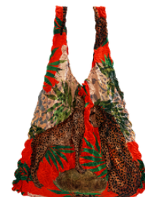
LEOPARD & PALM