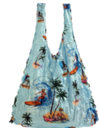
SUN, SEA & SURF