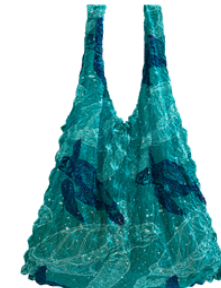
BLUE OCEAN TURTLE