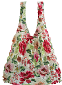
BERRIES & ANEMONE