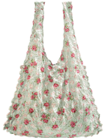
DUCK EGG BLUE & ROSE