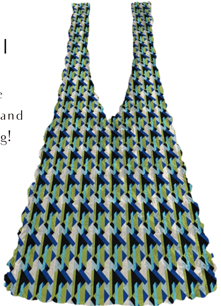
Green & Blue Graphic