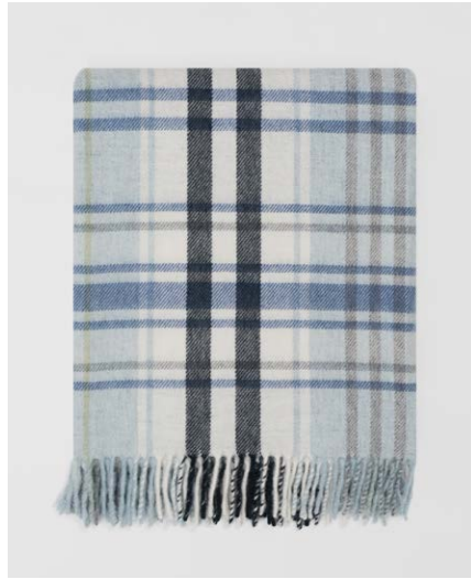
THR861/005 Sea Blue