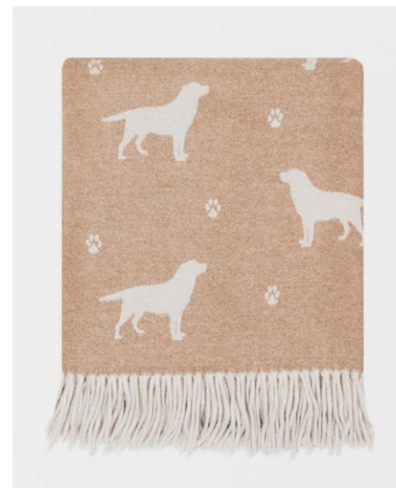
THR756/003 Labrador Bran