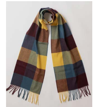
WWS778/004 Bazaar Storm

90% merino lambswool / 10% cashmere ~ 30cm x 200cm, including purled fringe