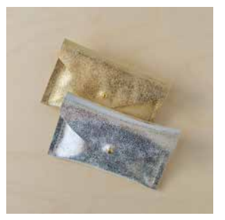
Card Holder CHLESGOL / CHLESLV