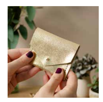
Shimmer Jewellery Pouch LSLESGOL