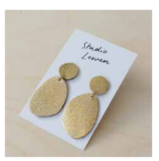
Pebble Earrings ERPBSGOL