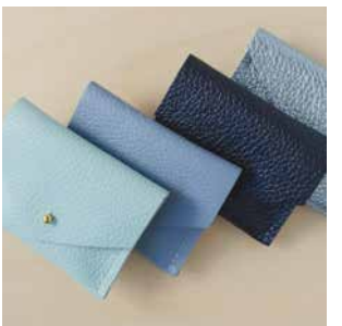
Jewellery Pouch Card Holder LSLESEA/LSLEPOW/LSLEMNA/LSLEDIA CHLESEA/CHLEPOW/CHLEMNA/CHLEDIA