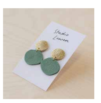
Bili Pop Earrings