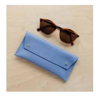
Double Stud Glasses Case GCDLEPOW