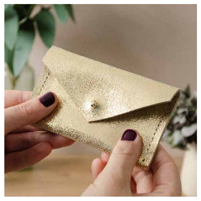
Shimmer Gold Card Holder CHLESGOL