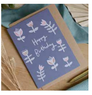
Navy Happy Birthday CRDNHB