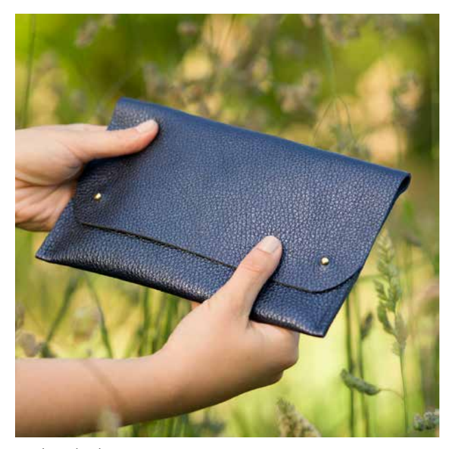
Leather Clutch Bag