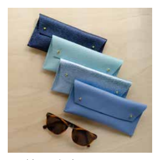
Double Stud Glasses Case GCDLEMNA / GCDLESEA / GCDLEDIA / GCDLEPOW