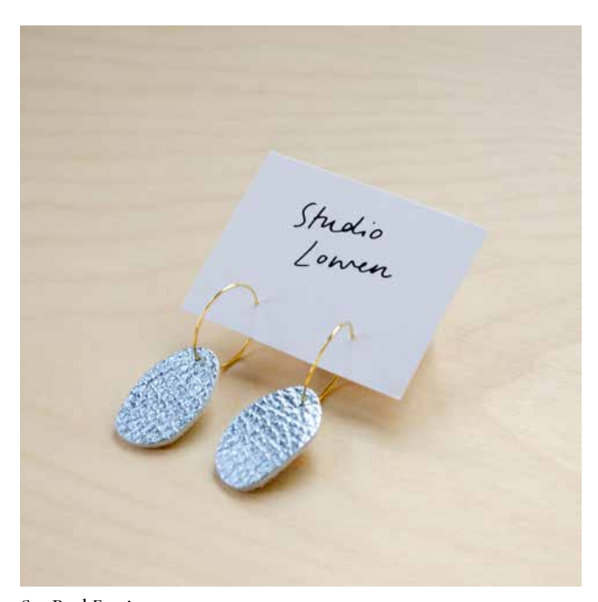
Sea Pool Earrings ERSPDIA Available in all leather and suede colours.