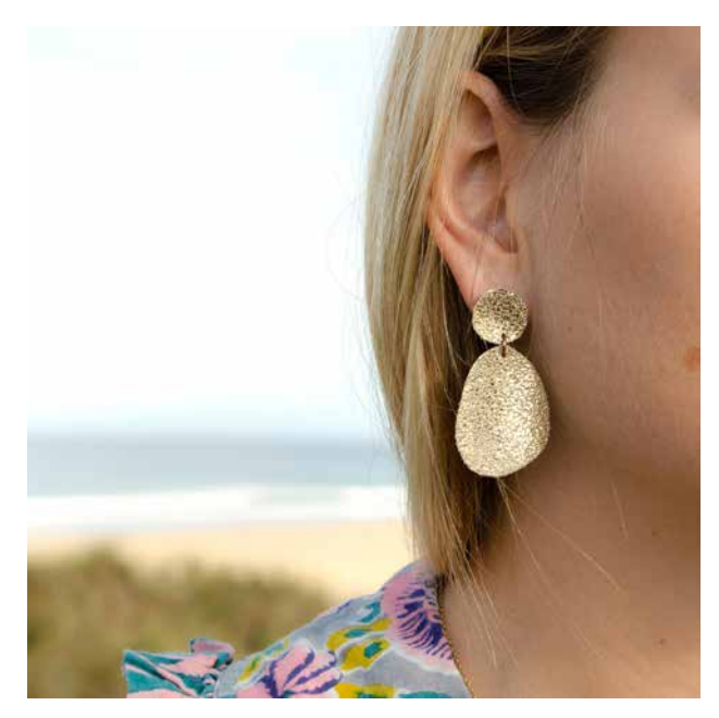
Pebble Earrings ERPBSGOL