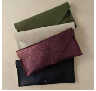
Clutch Purse CPLEOLV / CPLECRM CPLEBER / CPLEBLK