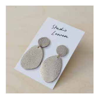
Pebble Earrings ERPBSLV