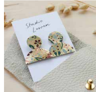
Floral Studs -Autumn ERSTFLOWA