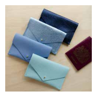
Envelope Passport Purse PPLEMNA / PPLEDIA / PPLEPOW / PPLESEA