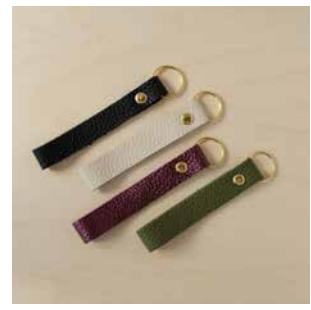
Loop Keyring KRLEBLK / KRLECRM / KRLEBER / KRLEOLV