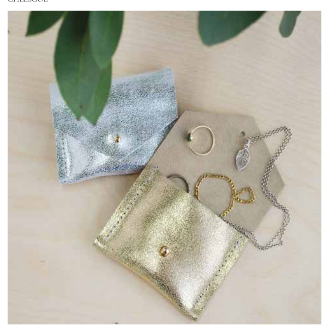
Shimmer Jewellery Pouch LSLESLV / LSLESGOL