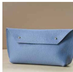
Make Up Bag MBLEPOW, also available MBLEMNA MBLEDIA / MBLESEA

Clutch Purse also available in these colours.