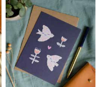
Navy Doves CRDNDV