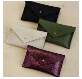
Card Holder CHLEBLK/CHLEBER/CHLEOLV/CHLECRM