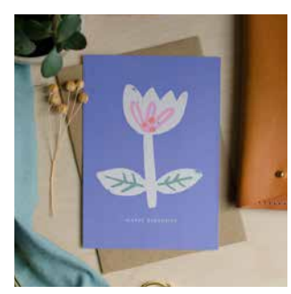
Happy Birthday - Blue Tulip CRDHBT