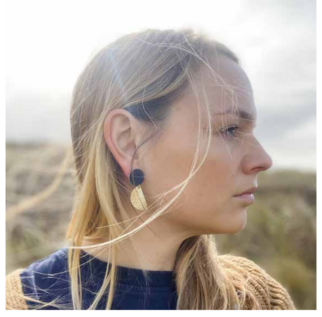
Celestial Drop Earrings ERCDSGOL Dark navy stud with gold or silver moons.