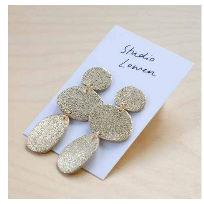
Kensa Earrings ERKNSGOL Also available in Silver.