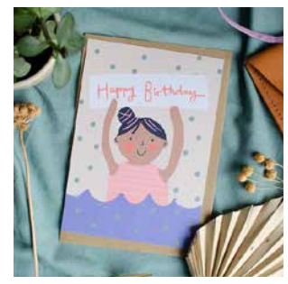
Swimmer Birthday CRDSHB