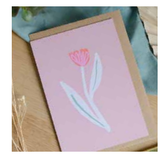
Pink Tulip CRDPTU