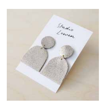
Arc Drop Earrings