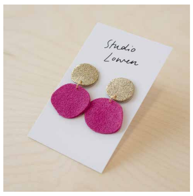
Bili Pop Earrings ERBPFUCH Available with gold top and any colour suede or leather drop.