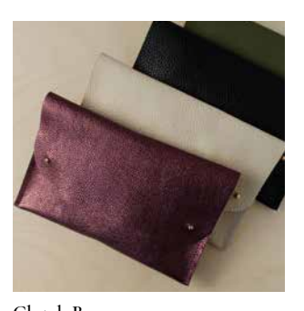
Clutch Bag CBLEOLV / CBLEBLK / CBLECRM / CBLEBER

Make Up Bag also available in these colours.