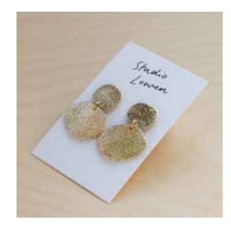
Bili Earrings ERBISGOL Available in silver too.