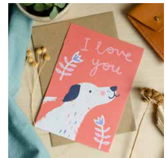
I love you - Dog