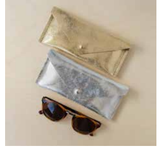
Glasses Case GCLESGOL / GCLESLV