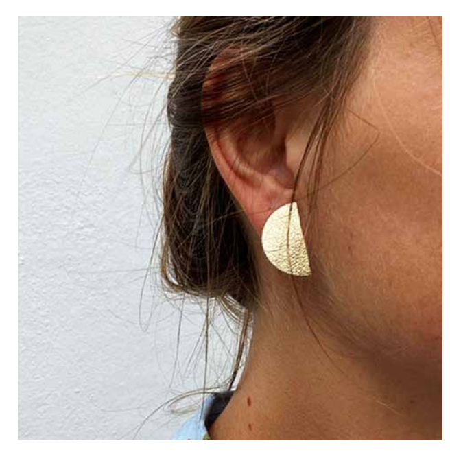
Half Moon Earrings ERMNGOLD Made with a foil gold leather.