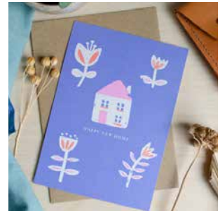
Happy New Home