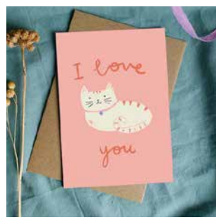
I love you - Cat