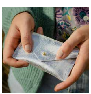
Shimmer Silver Card Holder CHLESLV