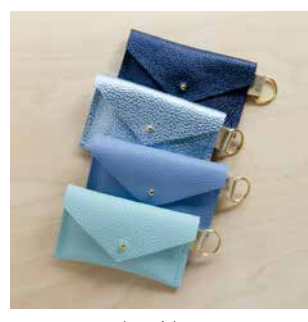
Keyring Card Holder CKLEMNA/CKLEDIA/CKLEPOW/CKLESEA