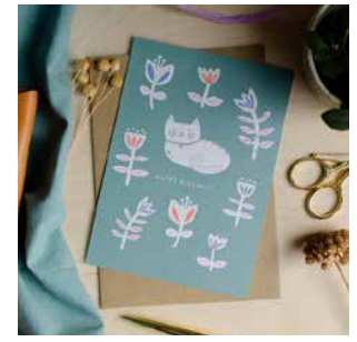
Happy Birthday Cat