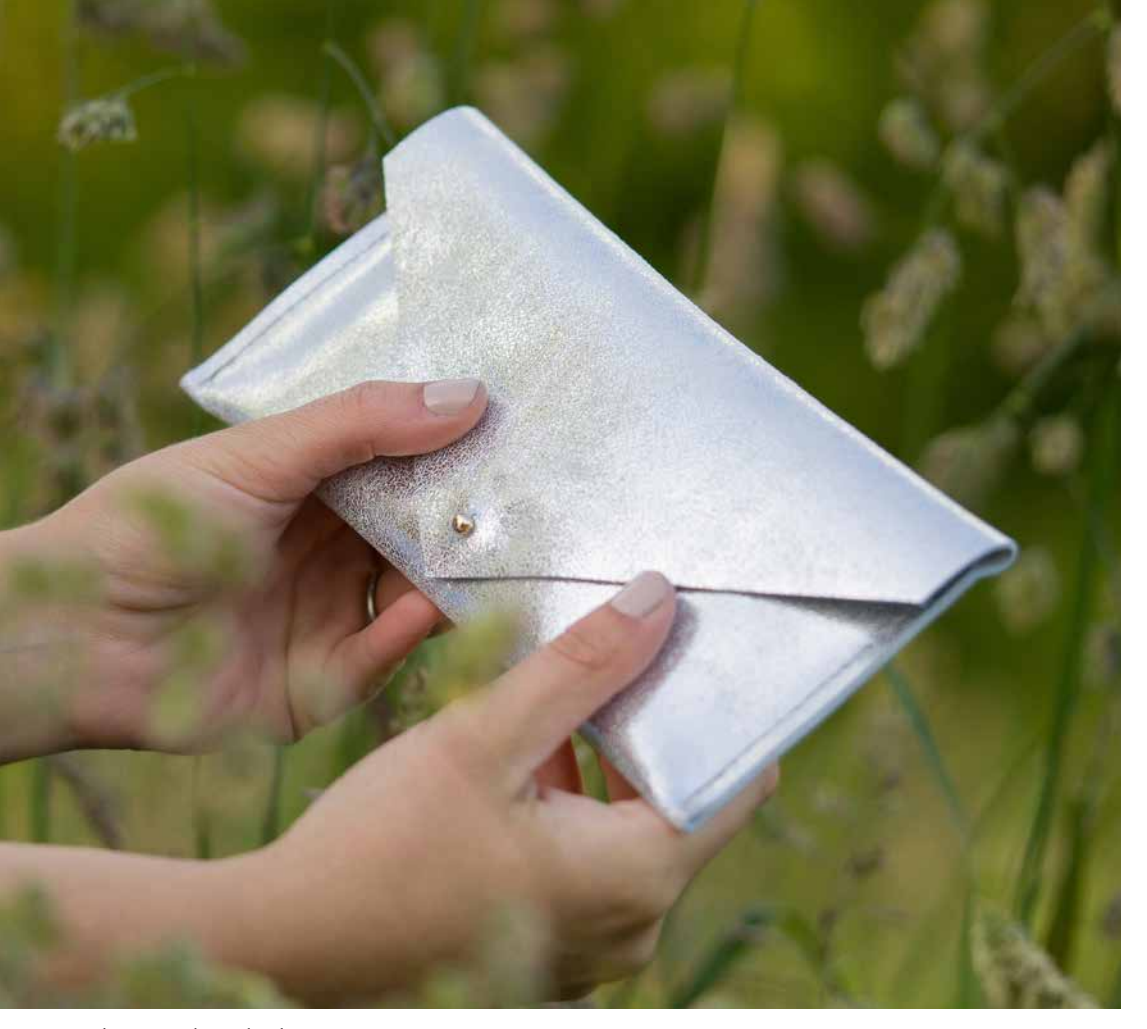
Shimmer Silver Clutch Purse