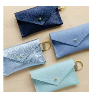
Keyring Card Holder CKLEMNA/CKLEDIA/CKLEPOW/CKLESEA