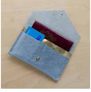
Inside of Envelope Passport Purse