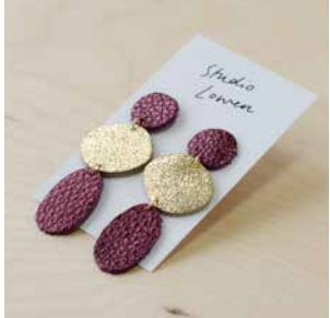
Nessa Earrings ERNSGPOW / ERNSGBER Also available with any pebble leather contrast colour.