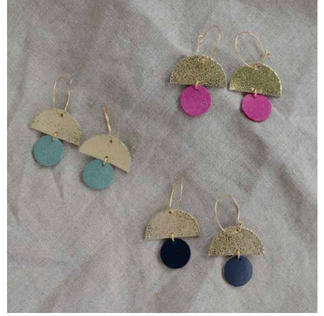
Sunrise Hoops ERSHFUCH ERSHMINT ERSHNAVY

18K gold plated hoops with Shimmer Gold semi circle and any colour of leather or suede drop.