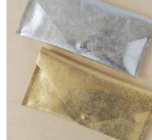
Clutch Purse CPLESGOL / CPLESLV