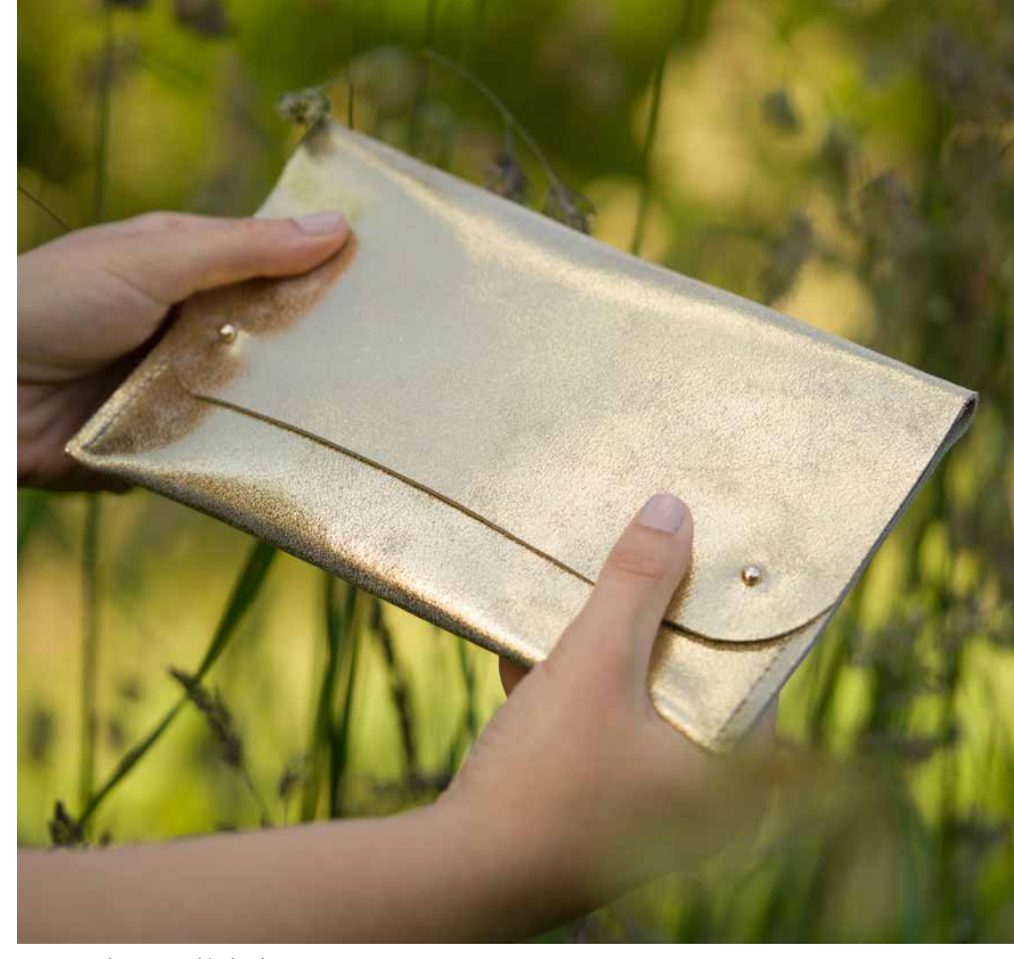
Shimmer Gold Clutch Bag CBLESGOL