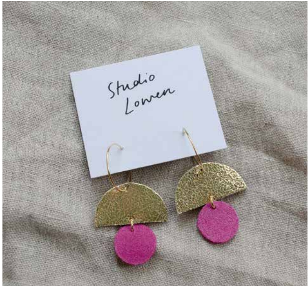
Sunrise Hoops ERSRFUCH