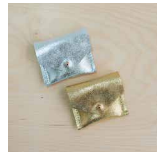
Jewellery Pouch LSLESLV / LSLESGOL