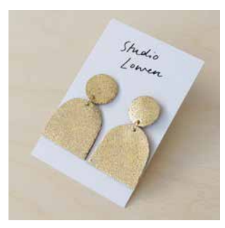
Arc Drop Earrings