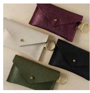
Keyring Card Holder CKLEBER / CKLECRM / CKLEBLK / CKLEOLV