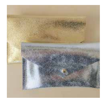
Everyday Purse EPLESGOL / EPLESLV