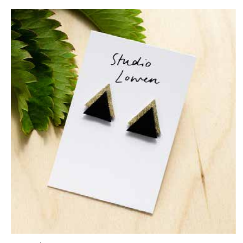
Triangle Earrings ERTRBLK Available in all suede colours.