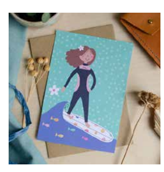
Surfer Girl CRDSUG