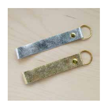
Loop Keyring KRLESLV / KRLESGOL