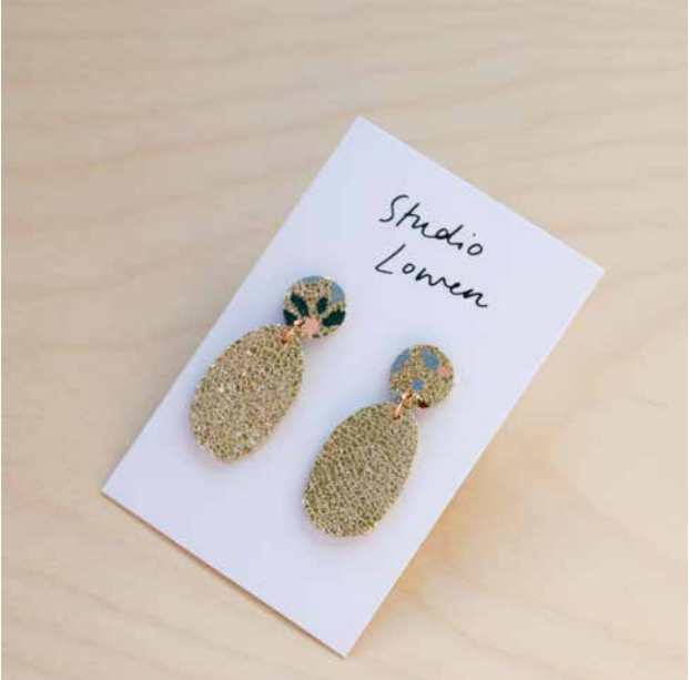
Floral Oval Drop - Autumn ERDDFLOWA