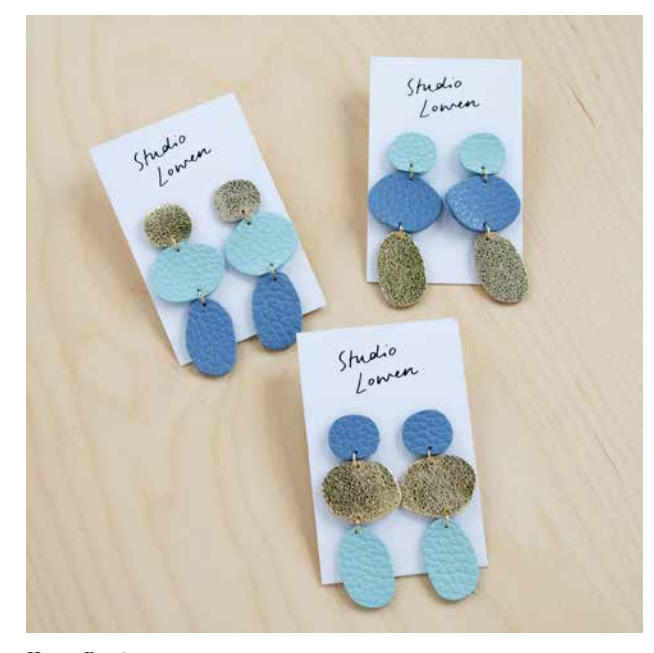
Kensa Earrings ERKNCOA A coastal mix of Seaglass, Powder Blue and Shimmer Gold. Also available in a Metallic Berry, Olive and Shimmer Gold Mix