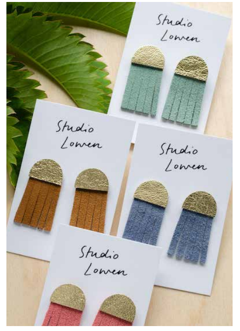
Jellyfish Tassel Earrings ERJFMINT / ERJFTANB / ERJFSBLU / ERJFCORA