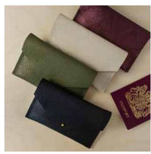
Envelope Passport Purse PPLEBLK / PPLEOLV / PPLECRM / PPLEBER