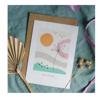
Just to Say