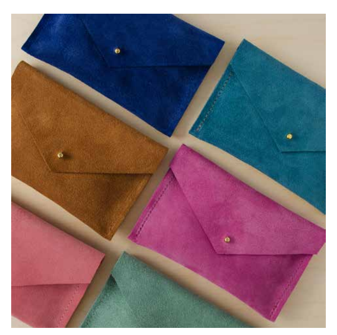
Suede Everyday Purse EPSUUBLU / EPSUTEAL / EPSUTANB / EPSUFUCH / EPSUCORA / EPSUMINT