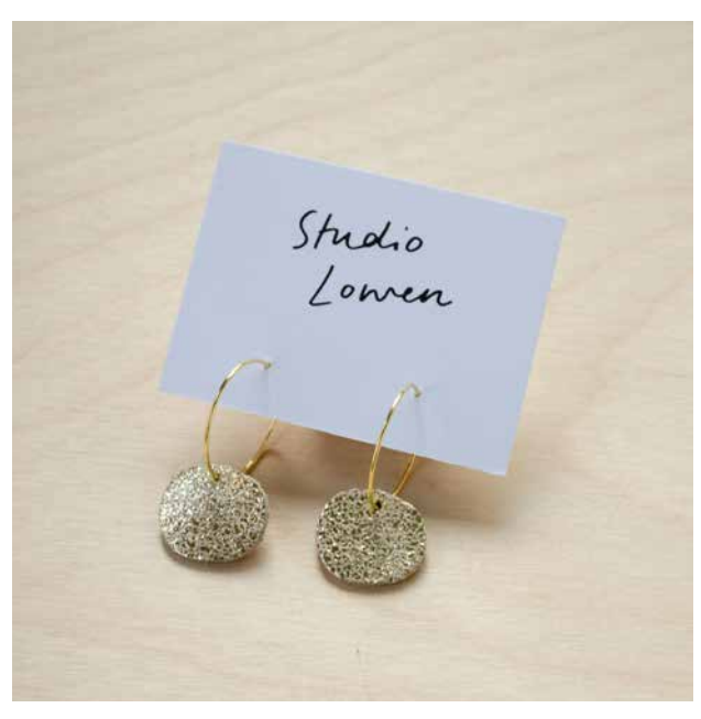
Sun Disc Earrings ERSDSGOL Available in Shimmer Silver and Gold.