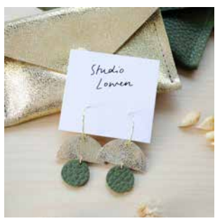
Sunrise Hoops ERSRNUDE