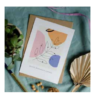
Happy Birthday Lovely CRDHBL