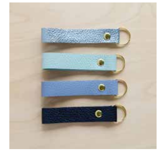
Loop Keyring KRLEDIA / KRLESEA / KRLEPOW / KRLEMNA