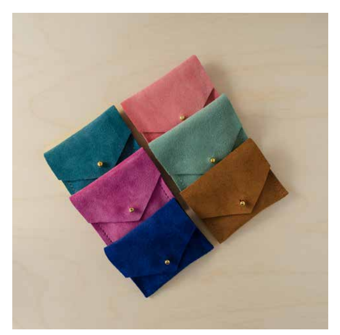
Suede Jewellery Pouch LSSUTEAL/LSSUCORA/LSSUFUCH/LSSUMINT/LSSUUBLU/LSSUTANB