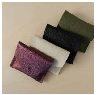
Jewellery Pouch LSLEBER / LSLECRM / LSLEBLK / LSLECLV

Soft Italian leather pouches, available in two collections, the first inspired by the colours in our autumnal hedgerows, the other inspired by the summer shoreline. Choose from Cream, Black, Olive, Metallic Berry, Metallic Navy, Metallic Diamond Blue, Seaglass and Powder Blue.