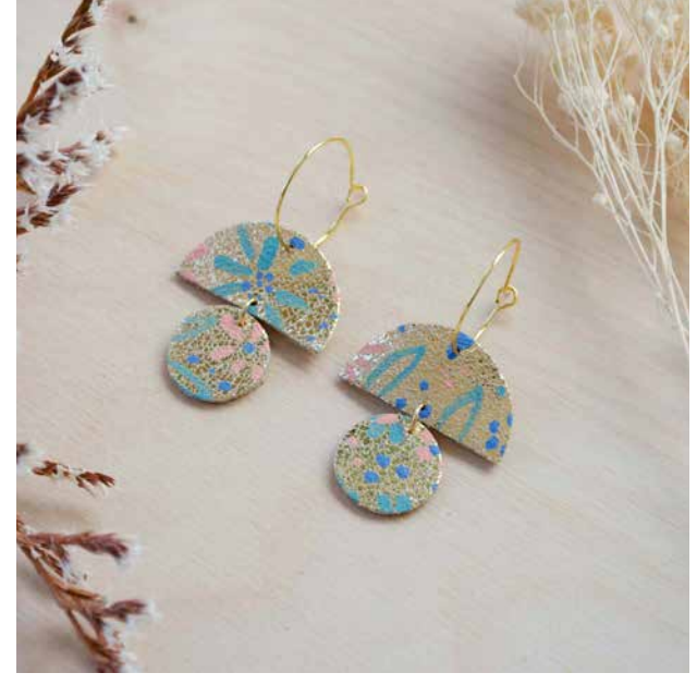
Floral Sunrise Hoops - Spring ERSRFLOW