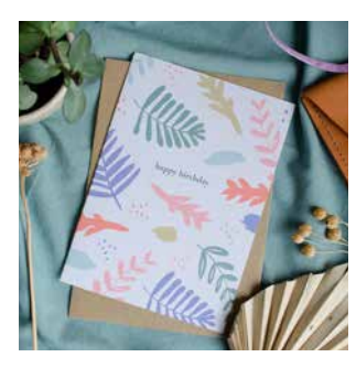
Fern Happy Birthday