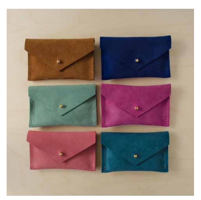
Suede Card Holder Chsutanb / Chsuublu / Chsumint / Chsufuch / Chsucora / Chsuteal