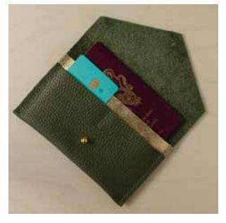
Inside of Envelope Passport Purse PPLEOLV, all colours feature gold insert.