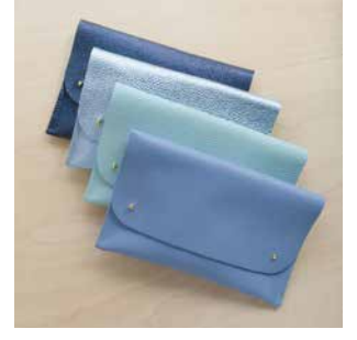
Clutch Bag CBLEMNA / CBLEDIA / CBLESEA / CBLEPOW