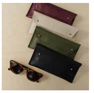
Double Stud Glasses Case GCDLEBER / GCDLECRM GCDLEOLV / GCDLEBLK