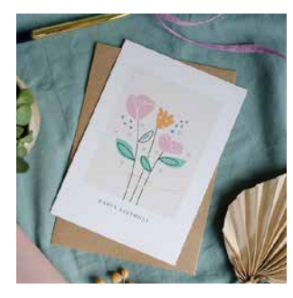
Happy Birthday Flowers CRDHBF