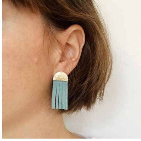
Jellyfish Tassel Earrings ERJFMINT Available in all suede colours.