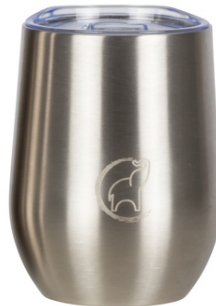
Steel Your Heart