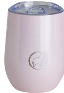
Candy Floss Shimmer