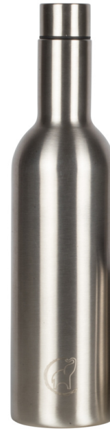
Steel Your Heart