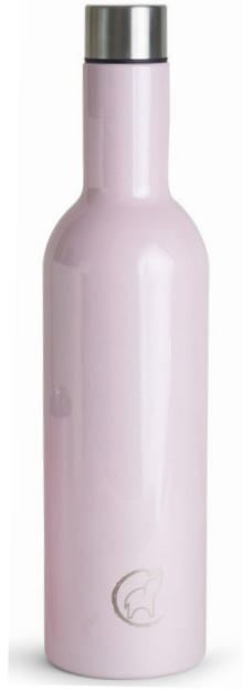
Candy Floss Shimmer