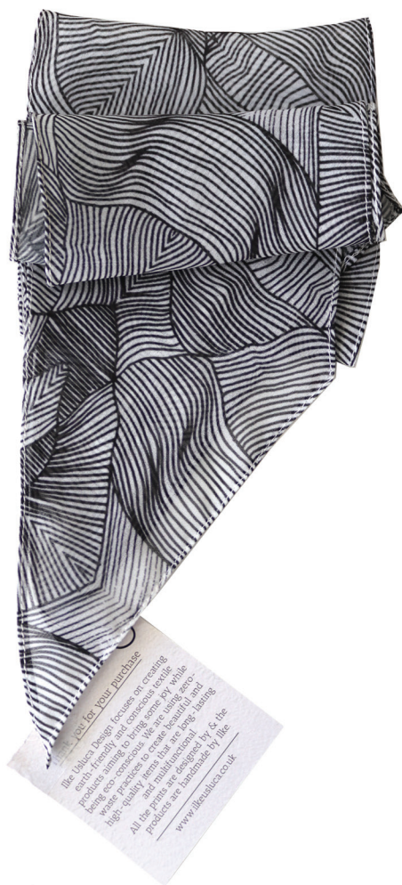
IUDSCR001 Illusion WSP: £10.90 RRP: £23