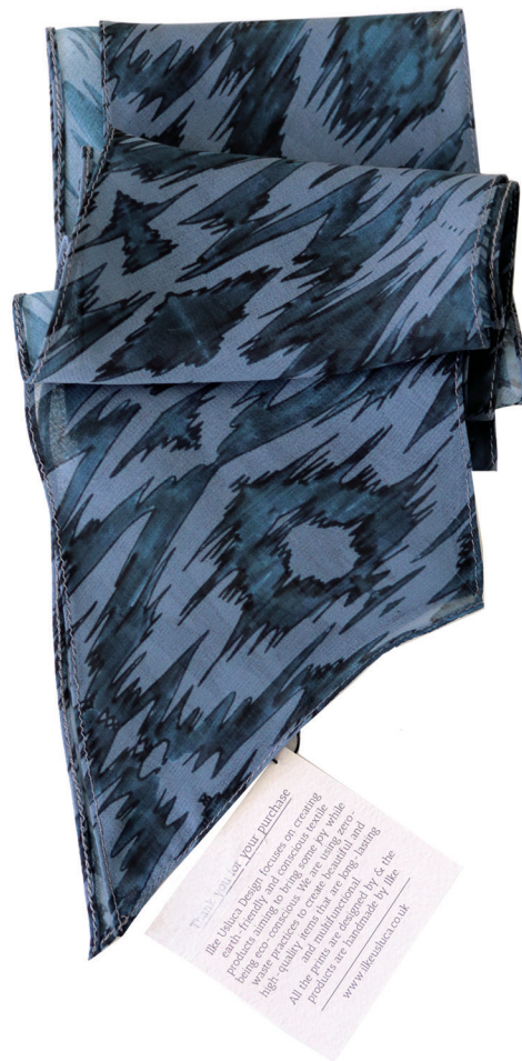
IUDSCR002 Ikat WSP: £10.90 RRP: £23