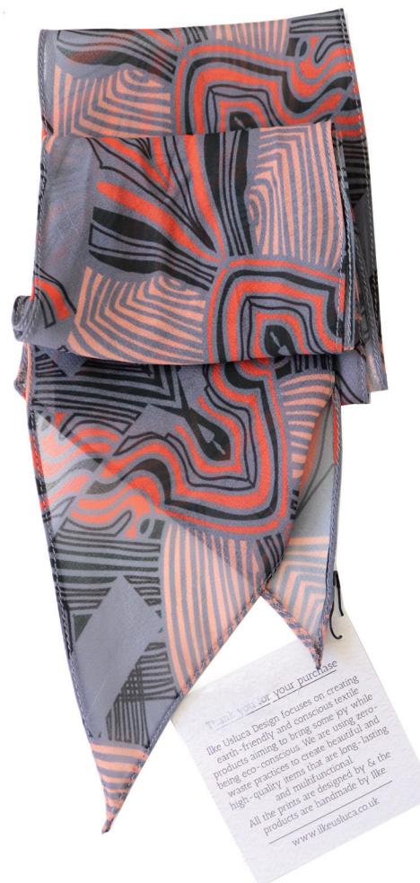
IUDSCR003 Balance WSP: £10.90 RRP: £23