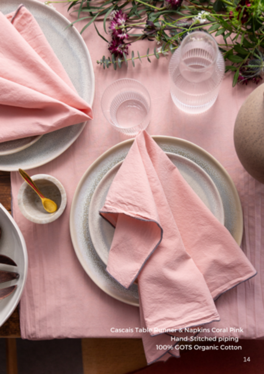
Cascais Table Runner & Napkins Coral Pink Hand-Stitched piping 100% GOTS Organic Cotton