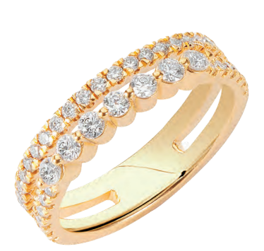
Illuminess™ 14K Combi Ring ILRV017 - Size

Illuminess™ SS Combi Ring ILRS016 - Size