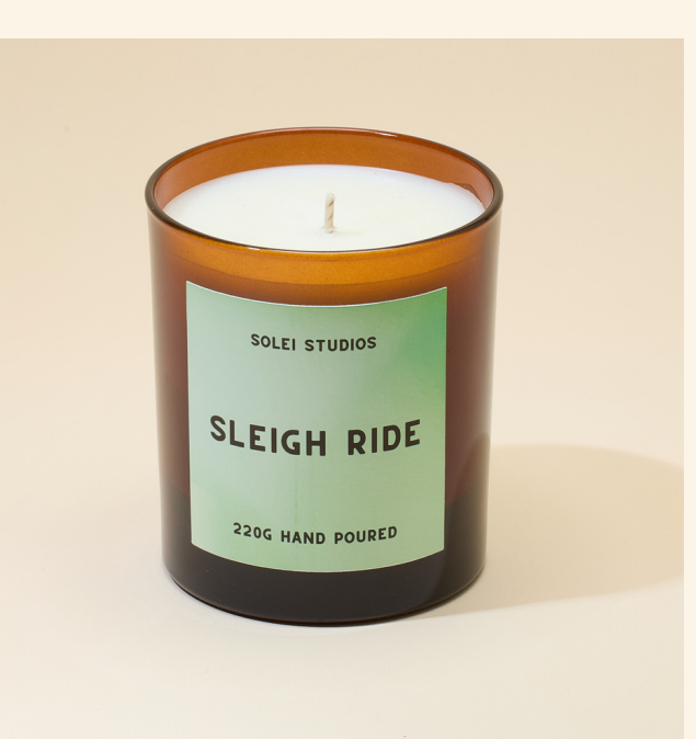
Sleigh Ride (green) Pine, Eucalyptus