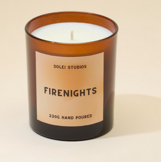
Firenights (amber) Hay, Amber, Honey, Musk, Nutmeg