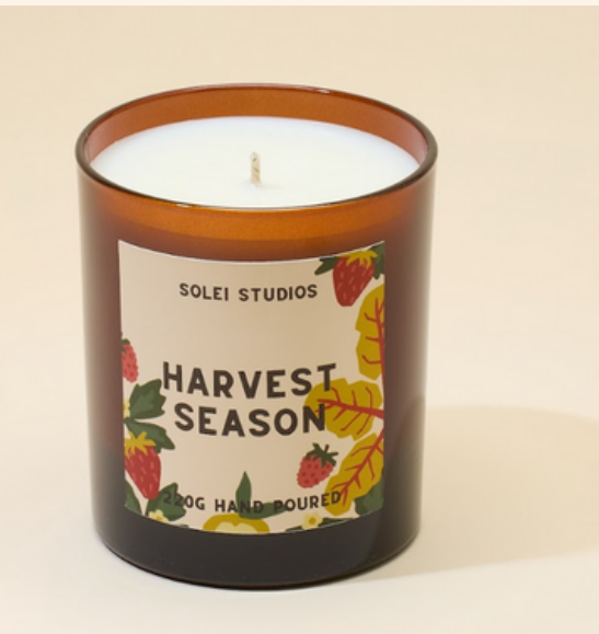
Harvest Season (fruity) Rhubarb, Apple, Blackberries, Vanilla

Desert Dunes (woody) Sandalwood, Black Tea, Black Pepper, Amber