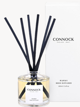
REED DIFFUSER 100ml - £42