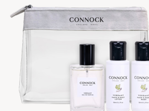
TRAVEL COLLECTION 30ml Eau de Parfum 50ml Hand & Body Wash 50ml Hand & Body Lotion £45