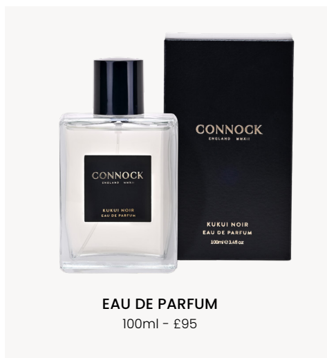
EAU DE PARFUM 100ml - £95

BASE: Black Amber, Oud Wood, Cashmere Musks