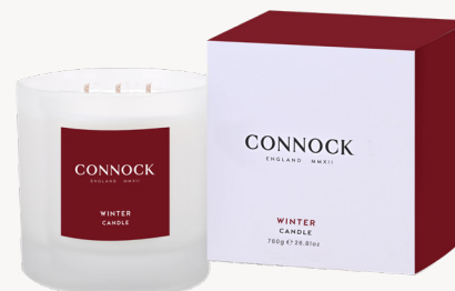
3-WICK CANDLE 760g - £70