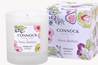
CANDLE 220g - £38