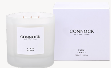
3-WICK CANDLE 760g - £70