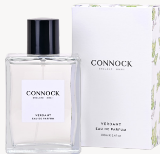
EAU DE PARFUM 100ml - £85 30ml - £40