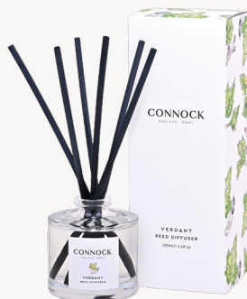
REED DIFFUSER 100ml - £42