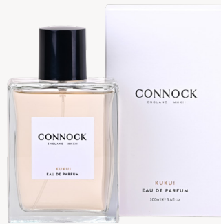
EAU DE PARFUM 100ml - £85 30ml - £40