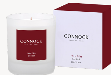
CANDLE 220g - £38

"This fragrance instantly transforms my home into a cosy haven. The bright citrus notes are uplifting, while the cinnamon and clove add just the right touch of warmth and spice. The patchouli base gives it a beautiful depth without being overpowering. It's become my go-to scent for the winter season—comforting, elegant, and truly inviting." Customer Review