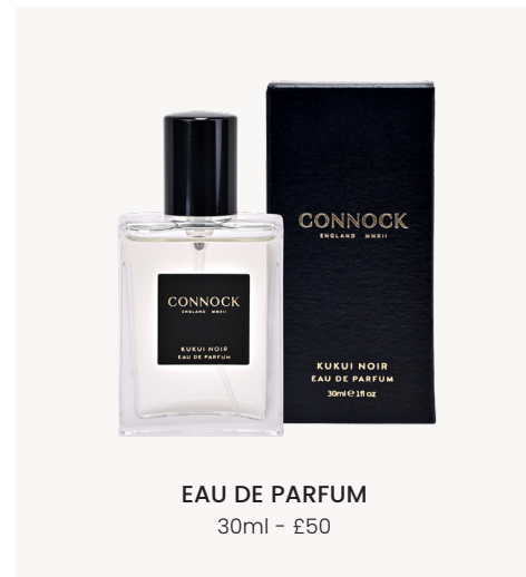
EAU DE PARFUM 30ml - £50

"Kukui Noir is not like any other fragrance I've tried before. It lasts all day and instantly makes me feel glamorous and ready for an evening out" - Customer Review