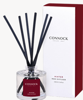
REED DIFFUSER 100ml - £42