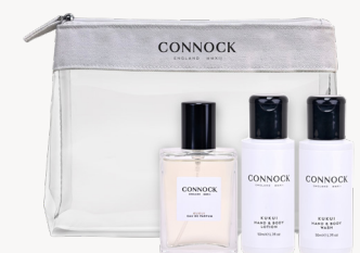
TRAVEL COLLECTION 30ml Eau de Parfum 50ml Hand & Body Wash 50ml Hand & Body Lotion £45