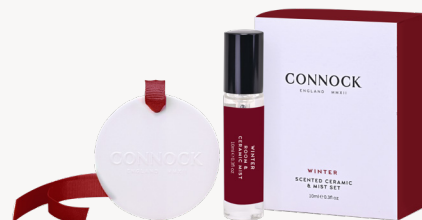
SCENTED CERAMIC & MIST SET 10ml - £20