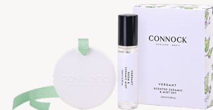
SCENTED CERAMIC & MIST SET 10ml - £20