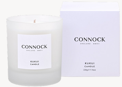
CANDLE 220g - £38