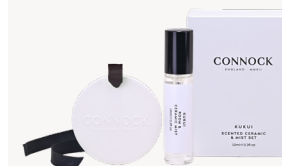
SCENTED CERAMIC & MIST SET 10ml - £20