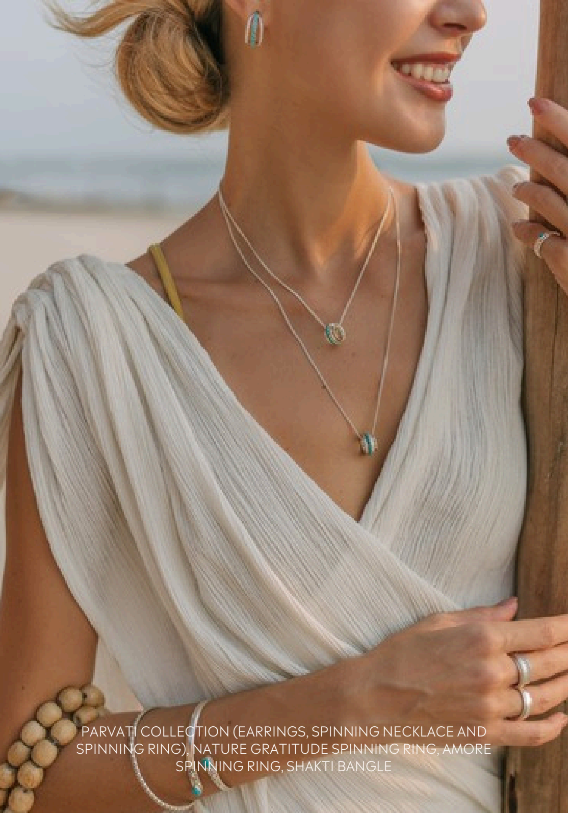
PARVATI COLLECTION (EARRINGS, SPINNING NECKLACE AND SPINNING RING), NATURE GRATITUDE SPINNING RING, AMORE SPINNING RING, SHAKTI BANGLA