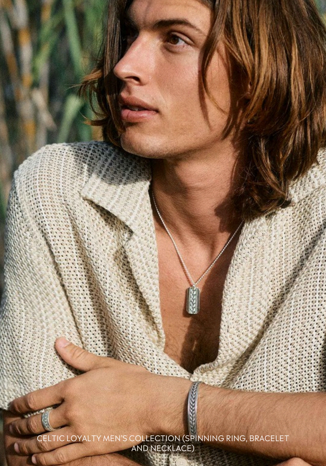
CELTIC LOYALTY MEN'S COLLECTION (SPINNING RING, BRACELET AND NECKLACE)