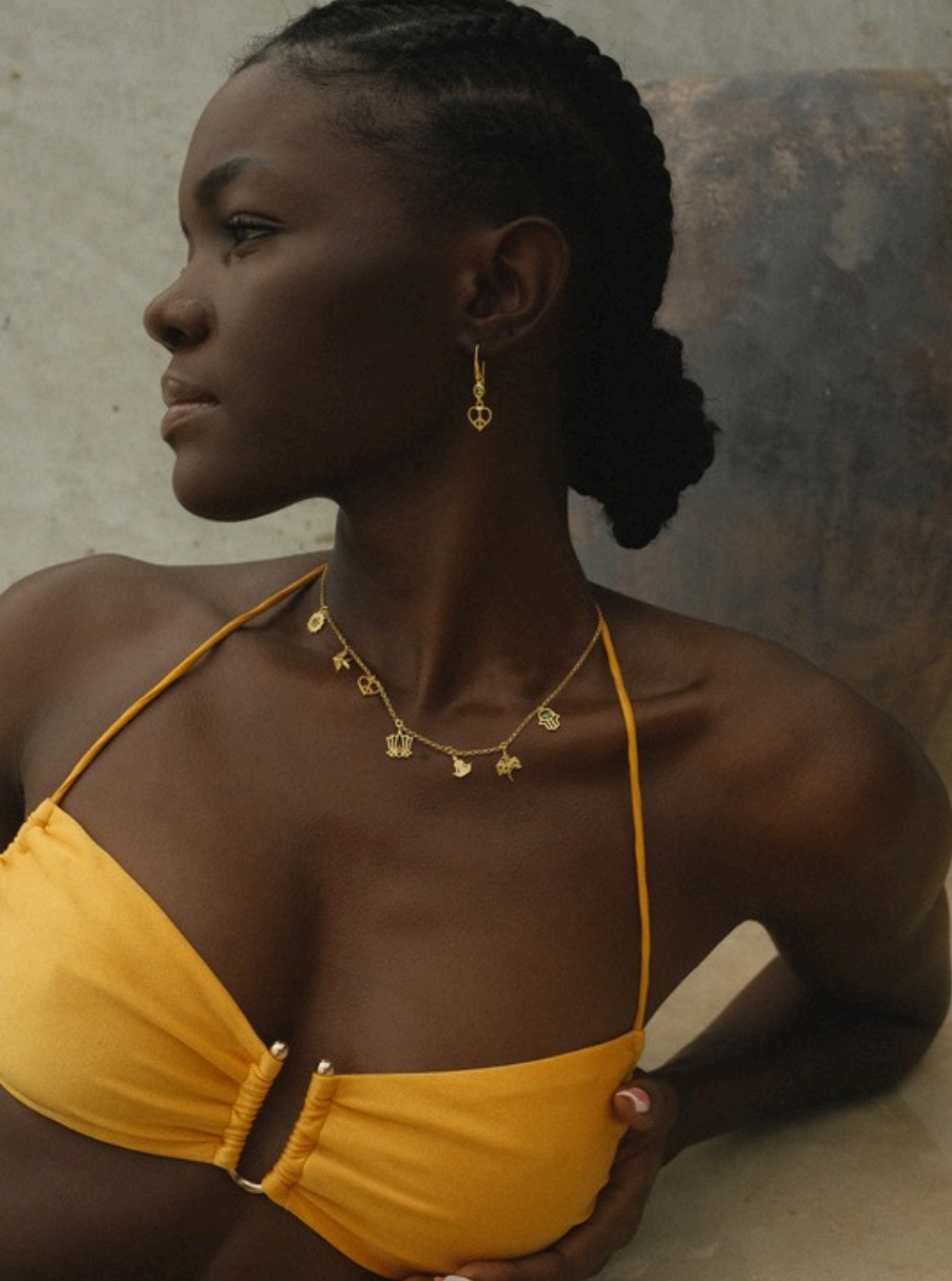
PEACE, LOVE AND FREEDOM NECKLACE AND PEACE HEART DROP EARRINGS