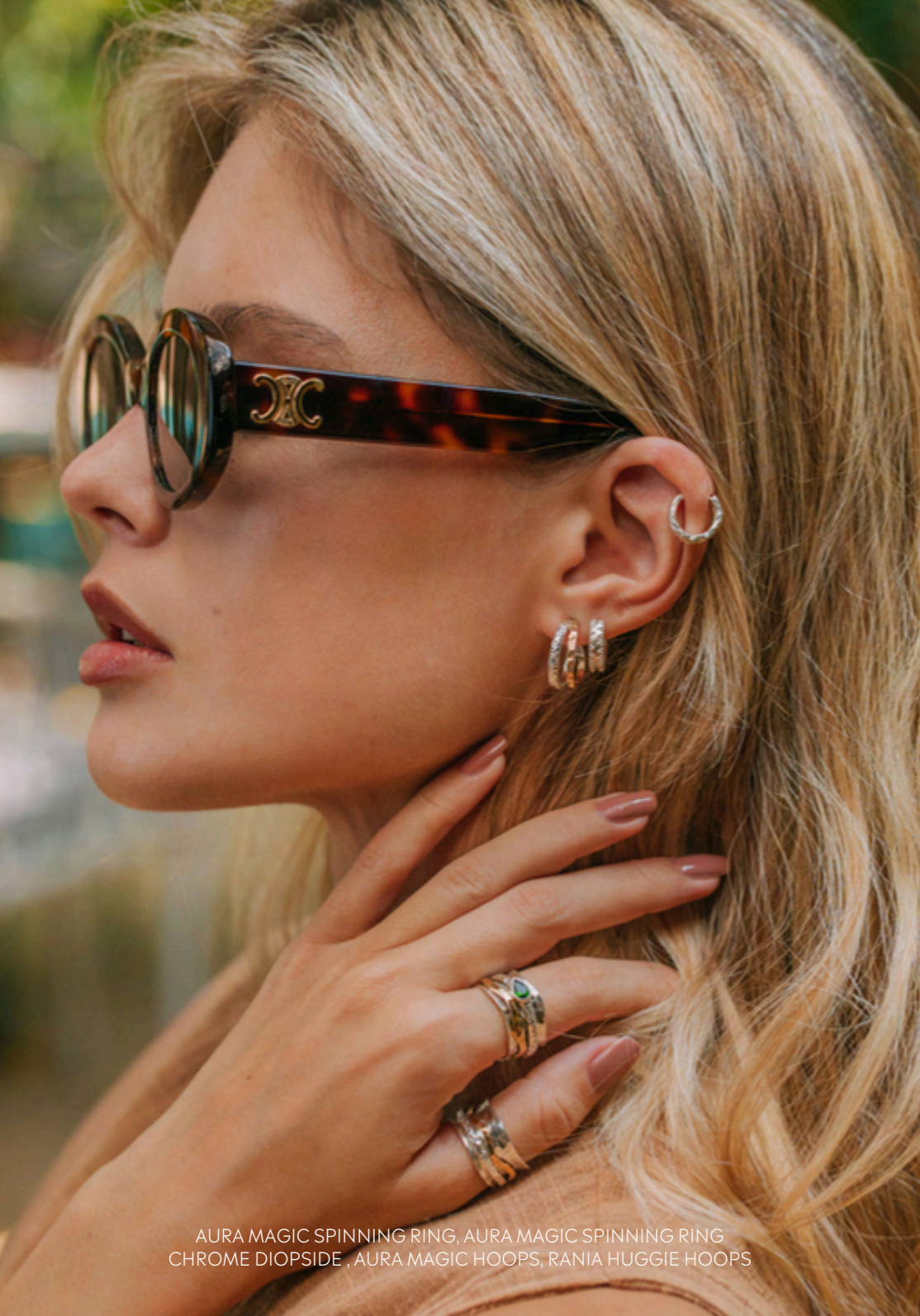
AURA MAGIC SPINNING RING, AURA MAGIC SPINNING RING CHROME DIOPSIDE , AURA MAGIC HOOPS, RANIA HUGGIE HOOPS