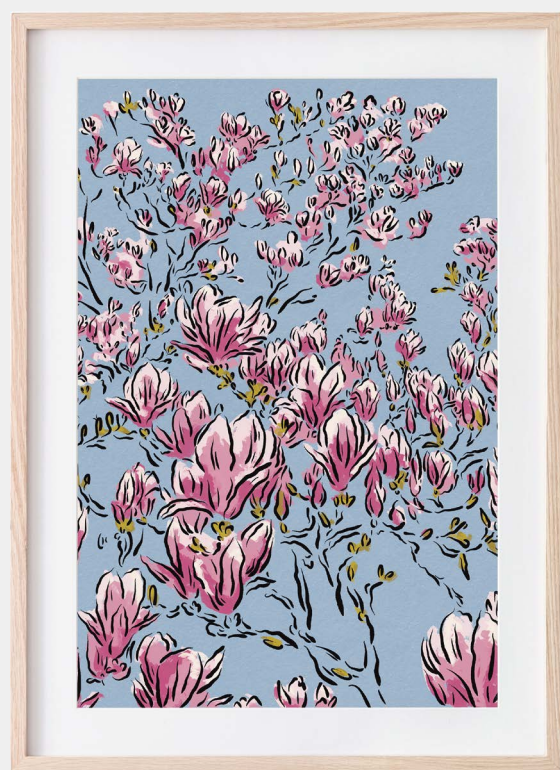
AP18 MAGNOLIA BLUE