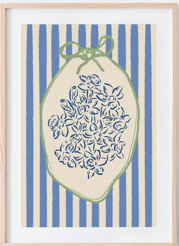
AP05 BLUE STRIPE