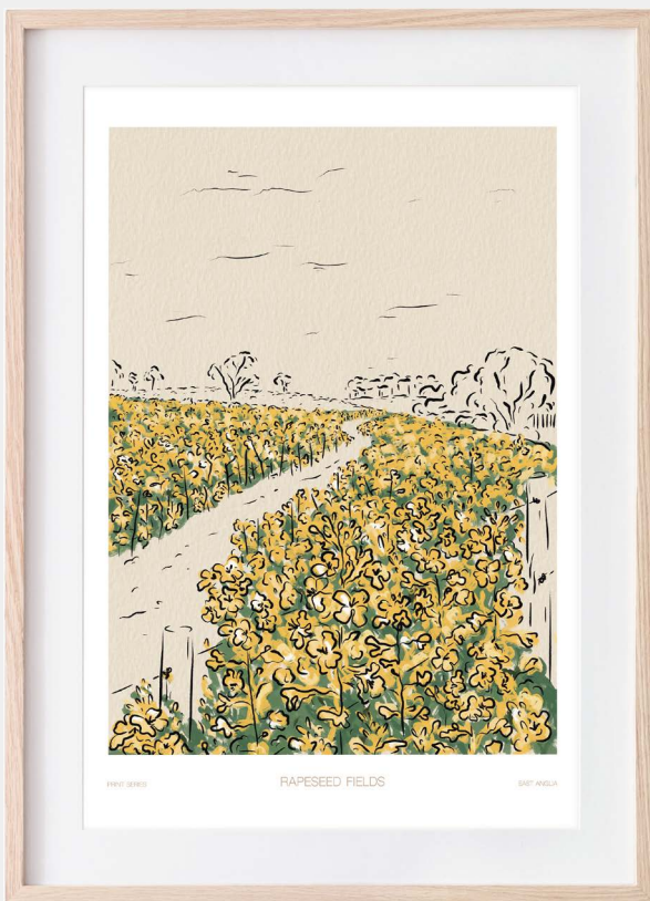
AP15 RAPESEED FIELDS