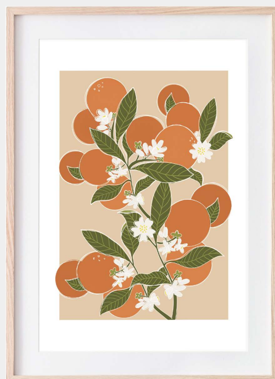
AP34 ORANGE BLOSSOM