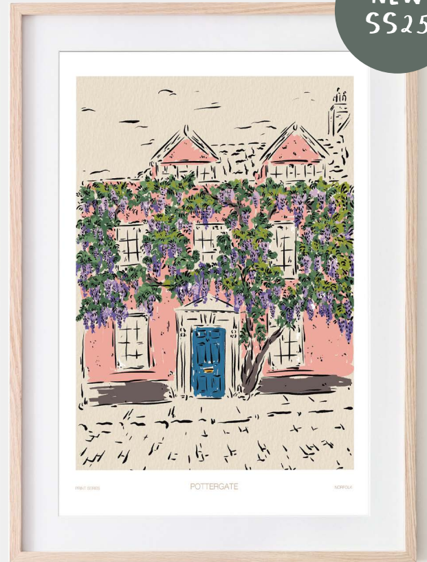
AP38 POTTERGATE- NORWICH