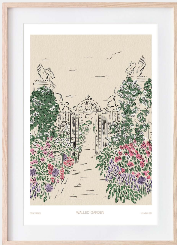
AP14 WALLED GARDEN- HELMINGHAM