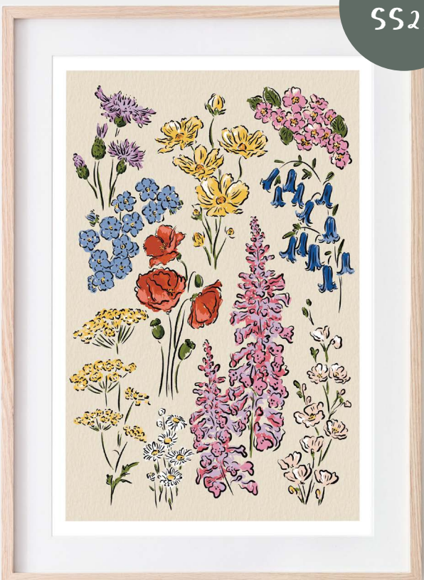
AP40 GARDEN FLOWERS