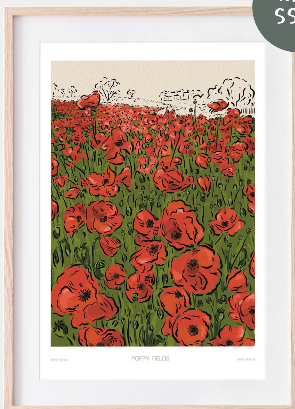
AP37 POPPY FIELDS