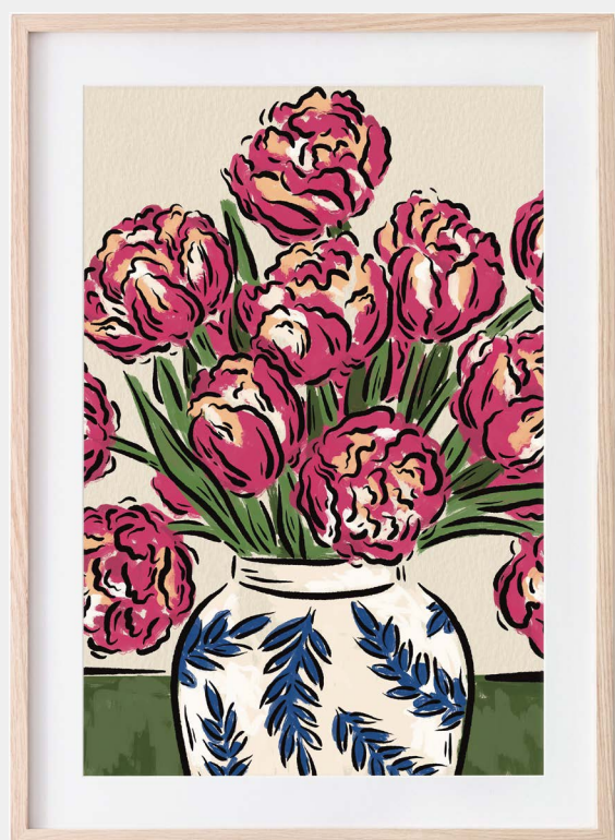
AP22 DOUBLE TULIP VASE