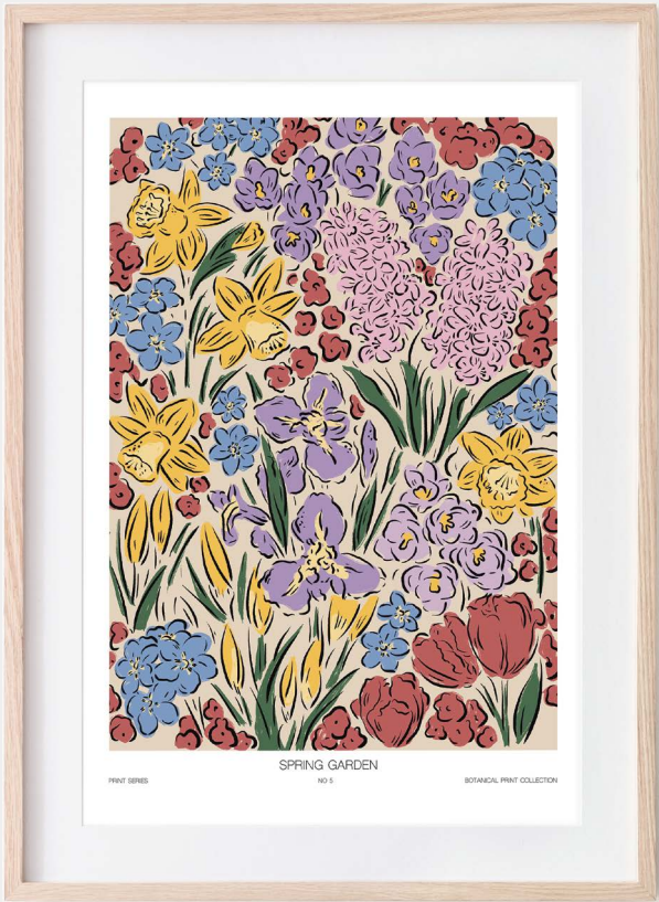
AP23 SPRING GARDEN COLOUR