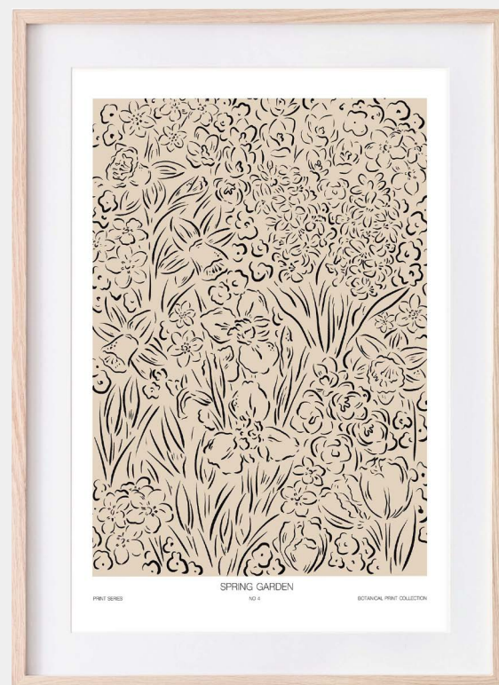
AP24 SPRING GARDEN BEIGE