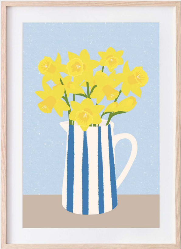
AP29 DAFFODIL VASE