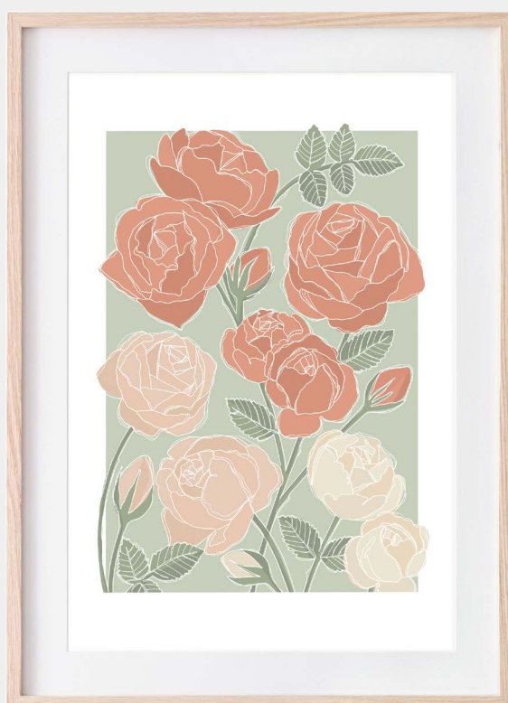
AP33 ROSE GARDEN