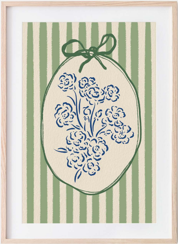
AP04 GREEN STRIPE