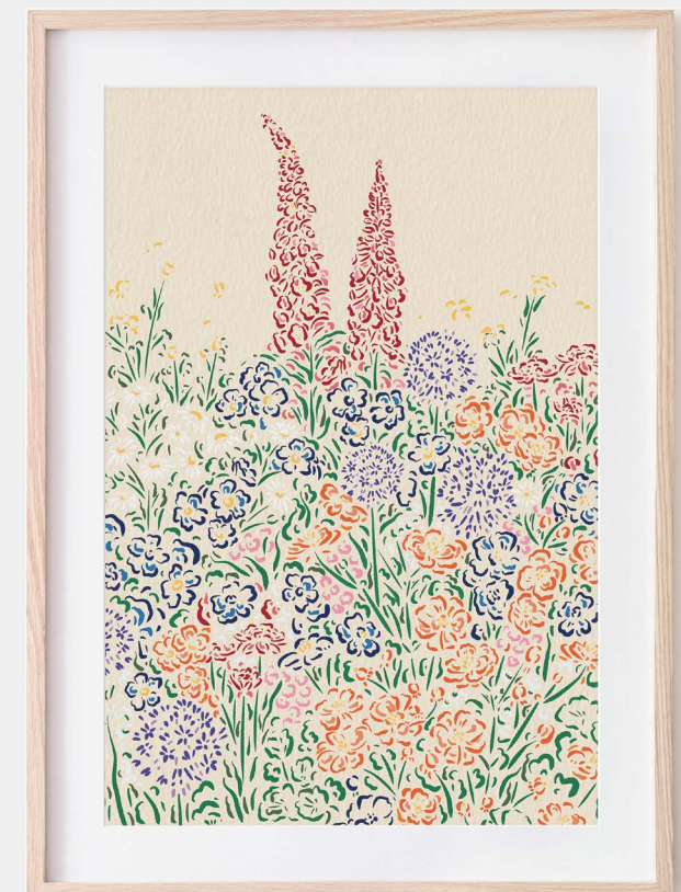
AP25 COTTAGE GARDEN

Interested in one of the Norfolk/ Suffolk prints without the text?