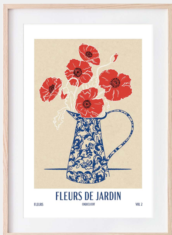
AP26 FLEURS POPPIES