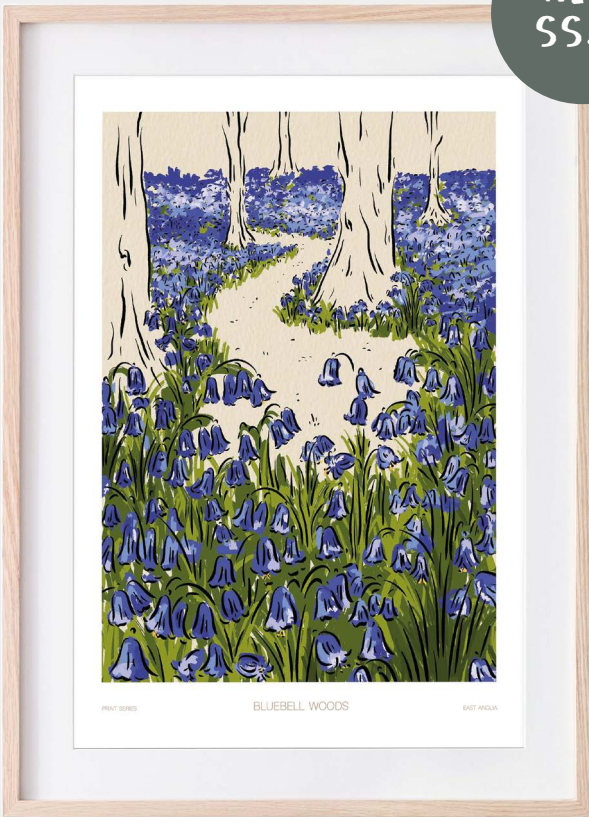
AP36 BLUEBELL WOODS