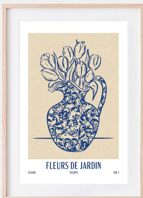
AP27 FLEURS TULIPS