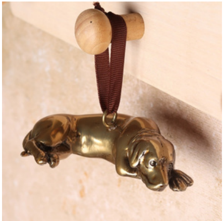
LABRADOR SKU HDLAB1 AVAILABLE IN PACKS OF 5