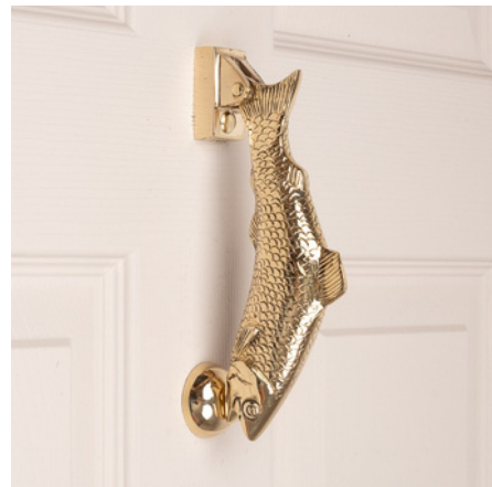
AMARIS THE SALMON AGED BRASS OR POLISHED BRASS SKU FISDK1 AVAILABLE IN PACKS OF 3

For initial orders, our door knockers are sold in a pack of three pieces of the same design. For future top-up orders, you may mix and match any of the designs and/or finishes to create a custom pack of three.