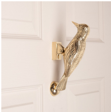
COSIMA THE WOODPECKER AGED BRASS OR POLISHED BRASS