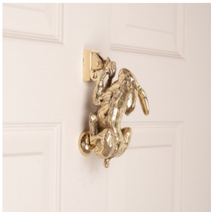
VITUS THE HARE AGED BRASS OR POLISHED BRASS