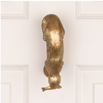
OTTO THE OTTER AGED BRASS OR POLISHED BRASS