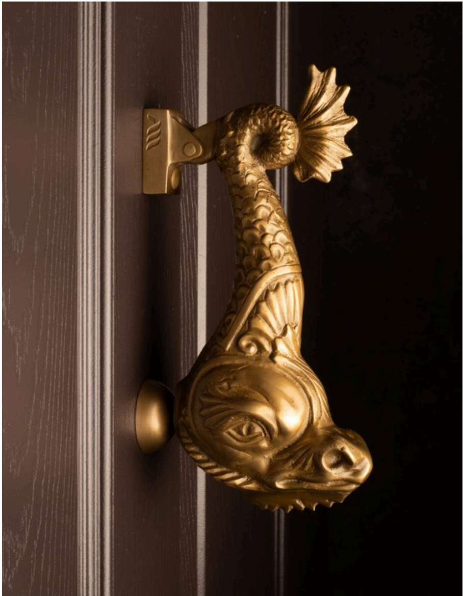
ALBA THE DRAGON AGED BRASS OR POLISHED BRASS