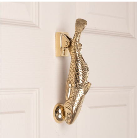
SAGAR THE COD AGED BRASS OR POLISHED BRASS SKU FISDK3 AVAILABLE IN PACKS OF 3