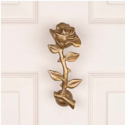
NOLA THE ROSE AGED BRASS OR POLISHED BRASS