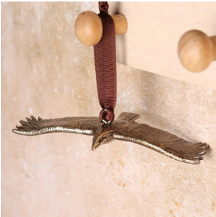
EAGLE SKU HDEAG1 AVAILABLE IN PACKS OF 5