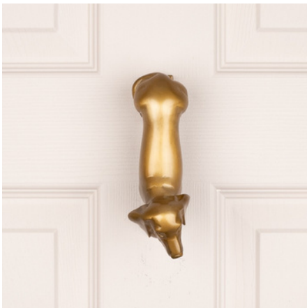
HUXLEY THE DACHSHUND AGED BRASS OR POLISHED BRASS