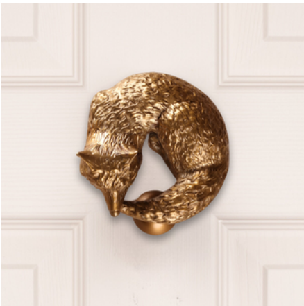
MANSTON THE FOX AGED BRASS OR POLISHED BRASS