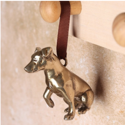
JACK RUSSELL SKU HDJAC1 AVAILABLE IN PACKS OF 5