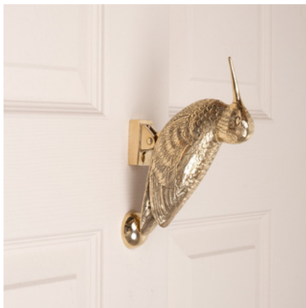
RANSLEY THE SNIPE AGED BRASS OR POLISHED BRASS