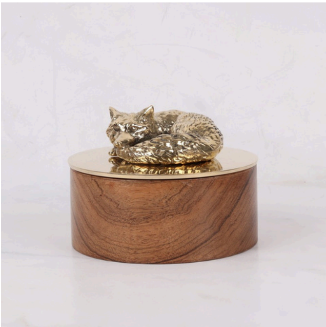
MANSTON THE FOX