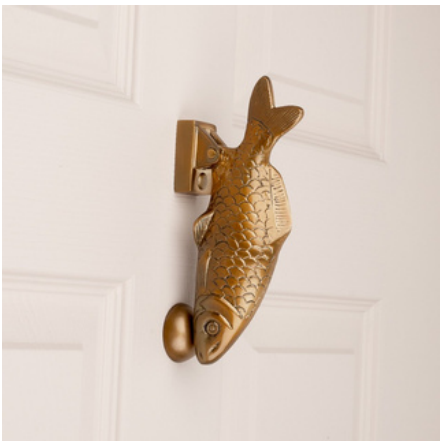
KAIROS THE CARP AGED BRASS OR POLISHED BRASS SKU FISDK2 AVAILABLE IN PACKS OF 3