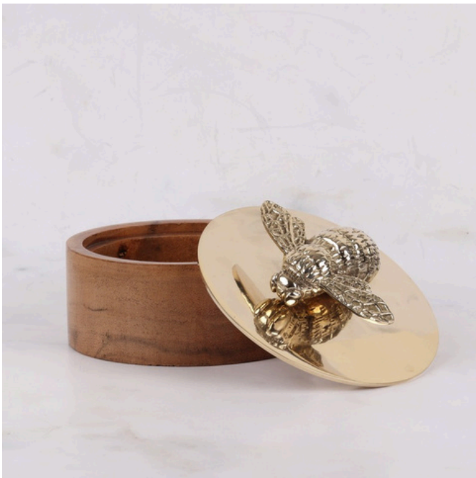
CORA THE BEE

A lid handcrafted in solid brass with an acacia wood base