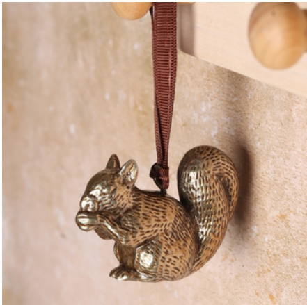
SQUIRREL SKU HDSQU1 AVAILABLE IN PACKS OF 5