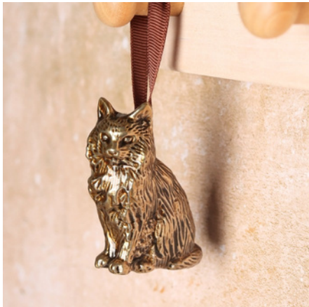
CAT SKU HDCAT1 AVAILABLE IN PACKS OF 5

Each hanging decoration is packaged in a branded linen gift bag. Please let us know if you would prefer not to have our gift bags.