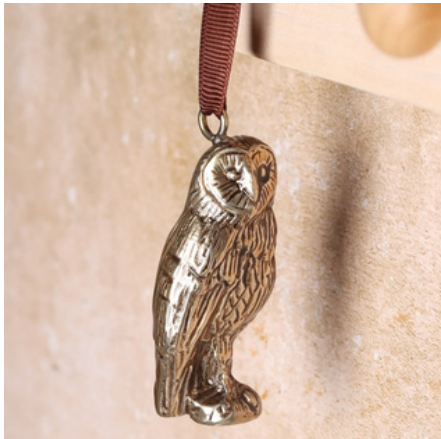
OWL SKU HDOWL1 AVAILABLE IN PACKS OF 5