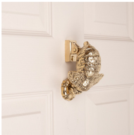
CORA THE BEE AGED BRASS OR POLISHED BRASS