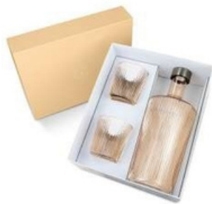
BELLS GIFT BOX