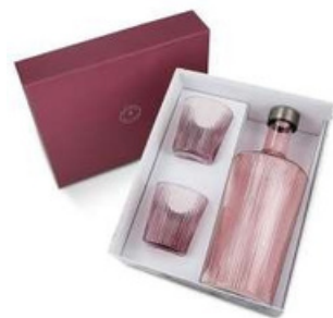
BROOME GIFT BOX