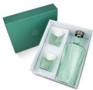
BONDI GIFT BOX