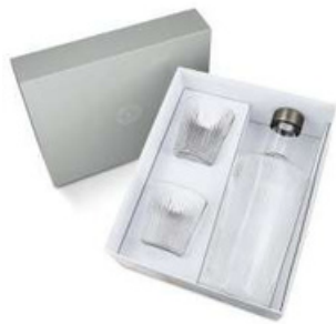
WHITE HAVEN GIFT BOX