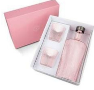
PINK GIFT BOX