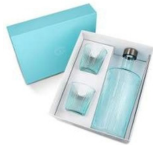
LUCKY GIFT BOX