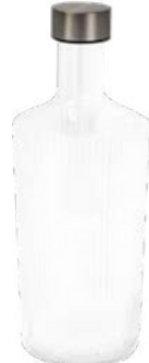
WHITE HAVEN BOTTLE