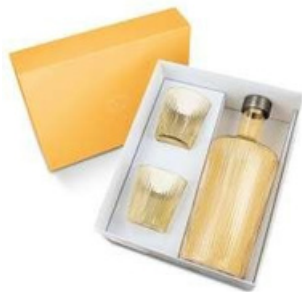
CABLE GIFT BOX