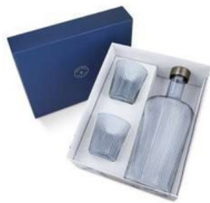
TWILIGHT GIFT BOX