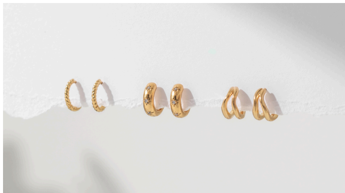
Enamel Slate Star Earrings & Crescent Moon Necklace, Enamel Latte Heart Earrings. Olive & Sky Crystal Rings, Mini Twist Huggies, Cosmic Crystal Huggies, Gold Duo Illusion Huggies