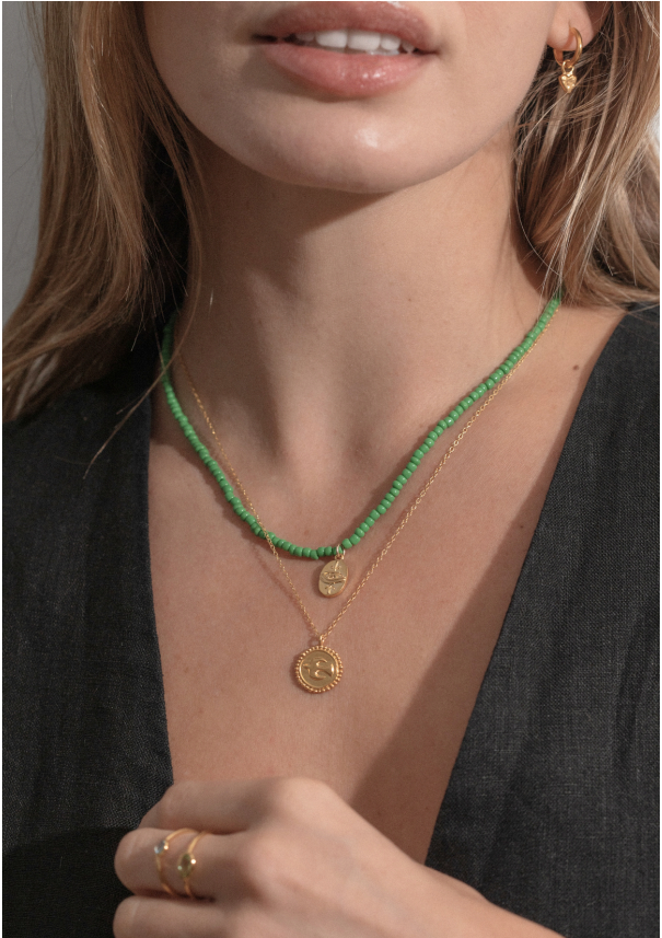
Gold Dove Necklace, Laurel Green Hamsa Necklace