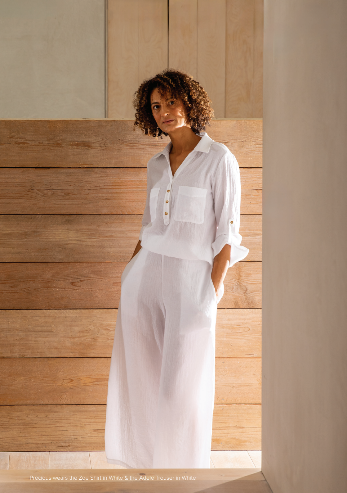
Precious wears the Zoe Shirt in White & the Adele Trouser in White