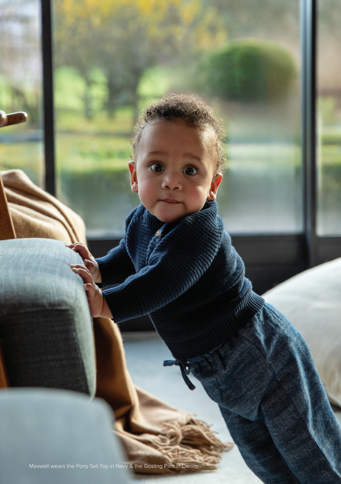
Maxwell wears the Pony Set Top in Navy & the Gosling Pant in Denim