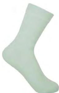
Baby Blue E