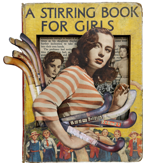
Face Book: A Stirring Book for Girls

Her four collections of work include Face Books , a witty take on social media; Picture Books , beautifully illustrated book art, alluding to the original title; Collaged Record Covers , collaged vinyls; and her monochrome Alphabetical Encyclopaedia pieces...all made from original ephemera.