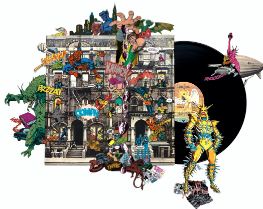
Collaged Record Cover: Physical Graffiti

Her work can be found at: Panter & Hall, Cecil Court, London The Rán Gallery, Westbourne Byard Art, Cambridge