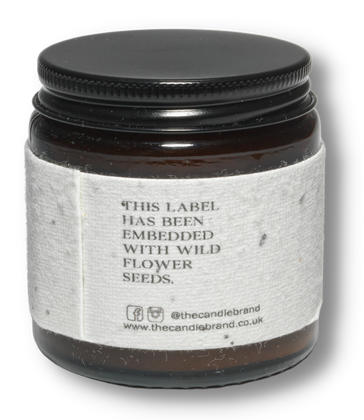
The Burn + Bloom 100 Hour