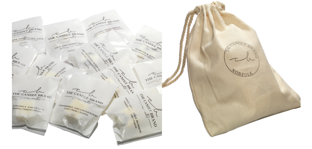
Pg. 9 Botanical wax melts