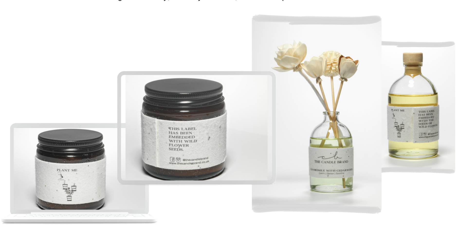
Pg. 3 Plantable seeded labels

The paper is handmade and not pressed in the same way as traditional paper this is to avoid crushing of the seeds. The seeds have a germination rate of 85% and you can expect to see flowers such as pink and red poppies, common daisy, gloriosa daisy, black eyed susan, annual and perennial wildflower mixes.