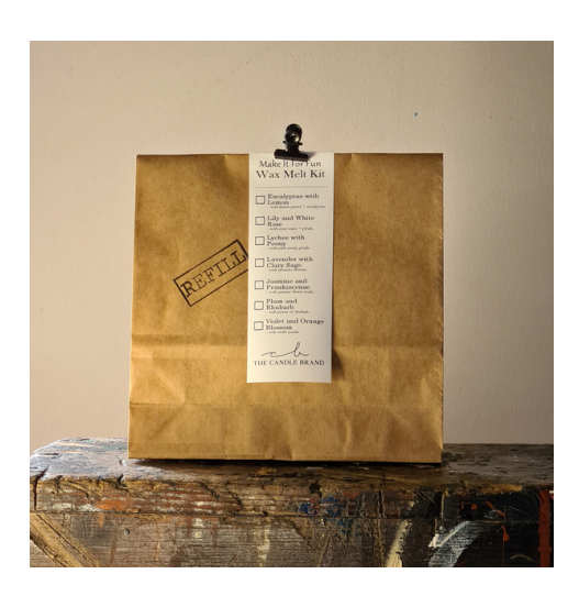
As recommended by

Wholesale per unit: £5 +VAT RRP per unit: £12.00