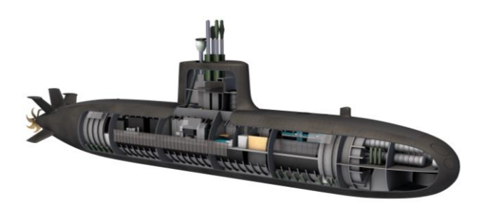
Fig. 5. BMT WYVERN SSK [23]

BMT's WYVERN SSK design (see figure 5) is a naval submarine concept design with a surfaced displacement of 720 tonnes. The design places considerable emphasis on a simplistic design approach and allows for a flexible equipment specification, which affords a high level of design tailoring in a cost effective package.