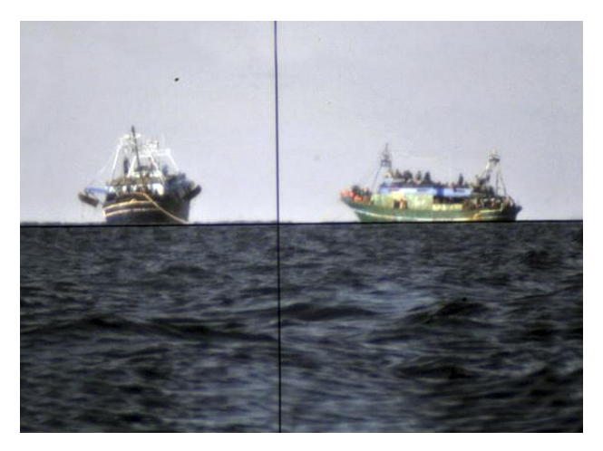
Fig. 1. Italian Navy submarine ITS GIANFRANCO GAZZANA-PRIAROGGIA conducted surveillance on human traffickers [13]

In the maritime security mode, submarines have been used for anti-piracy operations off the horn of Africa [10], anti-smuggling operations in the Irish Sea [11], SAR in the Indian Ocean [12] and to combat human trafficking in the Mediterranean (see figure 1).