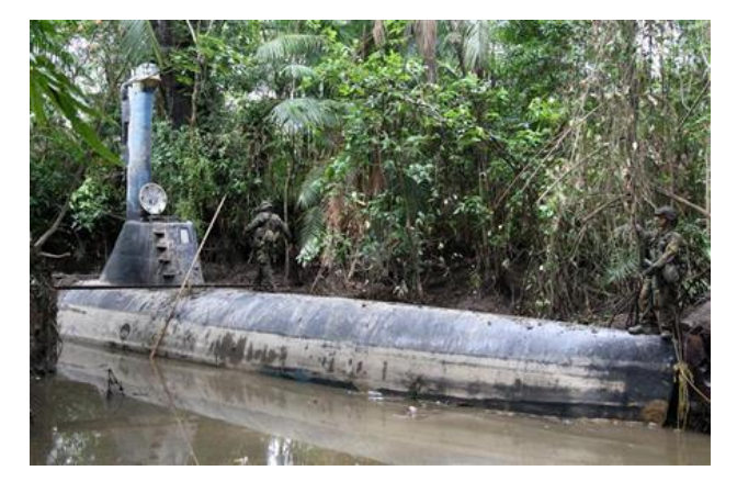
Fig. 4. Drug trafficking submarine [21]

One way to combat these evolving challenges is a dedicated coastguard submarine, particularly as naval submarines have already been used to counter the vessels mentioned above. Captain M.F. Morris, USN, notes the