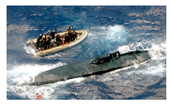
Fig. 2. Low-Profile Vessel (LPV) [19]

trafficking has steadily increased since the first semisubmersible was confiscated in 1993 [17]. Between June and September of 2017, cocaine worth $306 million was seized from seven interdicted LPVs [18].