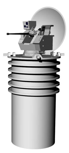
Fig. 10. Deck gun stowage design

The coastguard variant's deck gun is stored in a pressure tight stowage as shown in figure 10. For other variants, this stowage could be repurposed and turned into a container for modular systems whilst retaining the original option for a gun, similar to a Vertical Payload Module (VPM) [35] or other modular stowages [36].