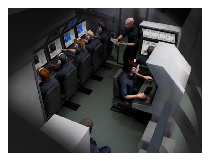
Fig. 8. WYVERN coastguard variant's control room

The flexible sensor and communication options present in the baseline design fulfil the ISR requirements and can be further tailored to meet specific needs. The acoustic, visual and electronic data can be interpreted and reviewed in the submarine's control room (figure 8) before the most relevant data is conveyed to other assets in a timely manner.