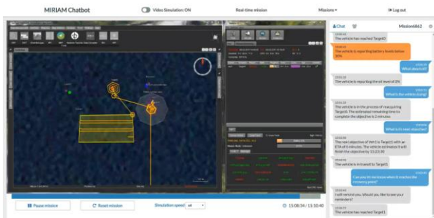
Fig. 2. Multi-vehicle MCM mission being executed, with chatbot communication between human and machine participants.

unmanned teaming. It also reduced the risk of mission objectives not being met, and further reduced operational risks by enabling end-users to set alerts and reminders for post-mission reporting and maintenance.